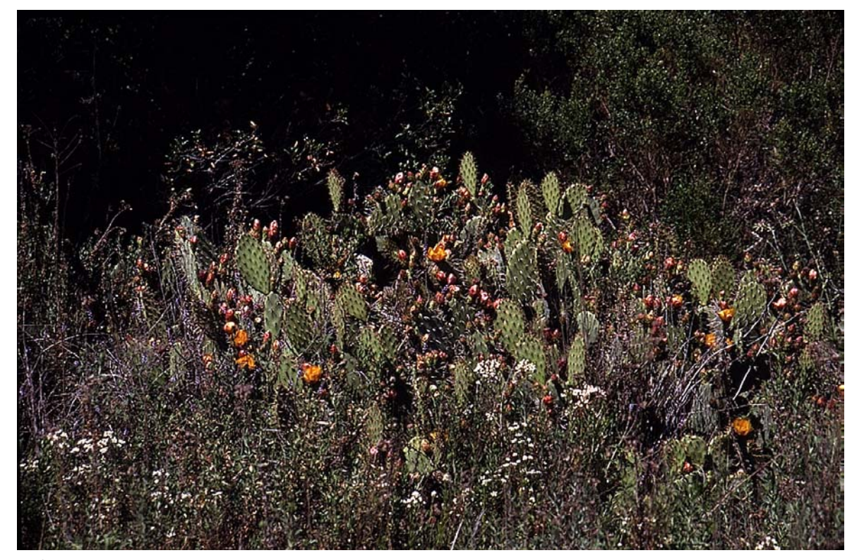
Pricklypear cactus around coastal sage scrub.

DFG and city and county governments started working closely together on an NCCP for the coastal sage scrub ecosystem. The first step provided a sound scientific foundation for the process. A team of independent, widely respected conservation biologists convened to