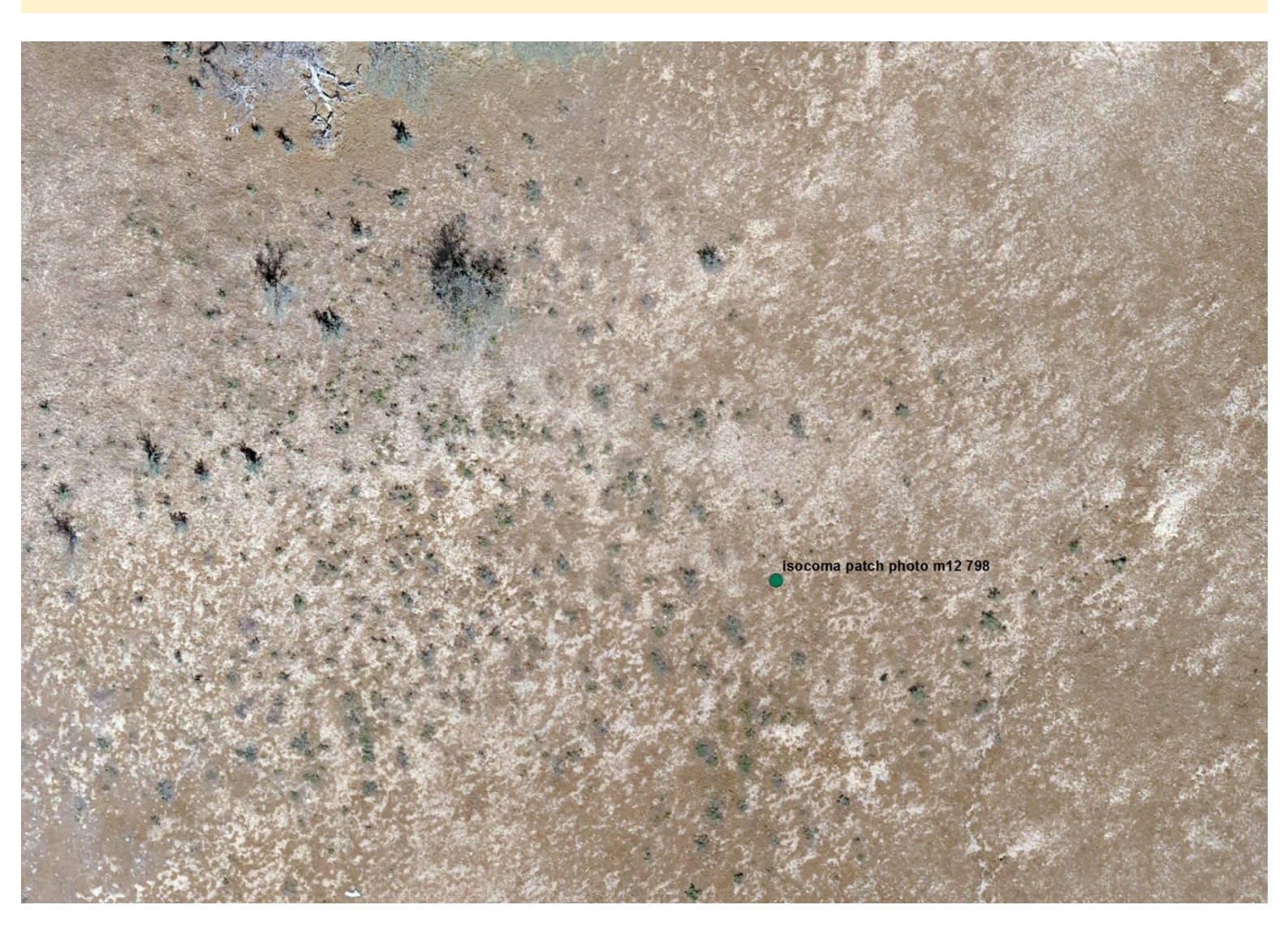
Figure 5. High resolution imagery was also flown in the same month as the drone imagery (April, 2015), and was available in Google Earth.

Figure 3: UAS-acquired imagery showing a patch of Isocoma . The resolution of the UAS-acquired imagery is 0.0321316 meters (1.27 inches), and the color of the shrubs is clearly visible.