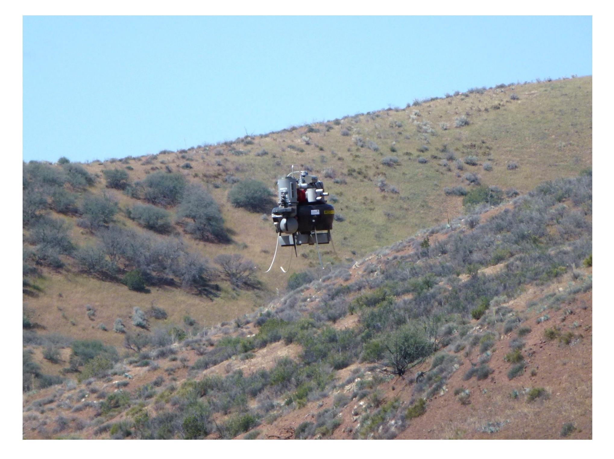
Figure 2: T-hawk UAS returning from a windy flight above Saltos Canyon.