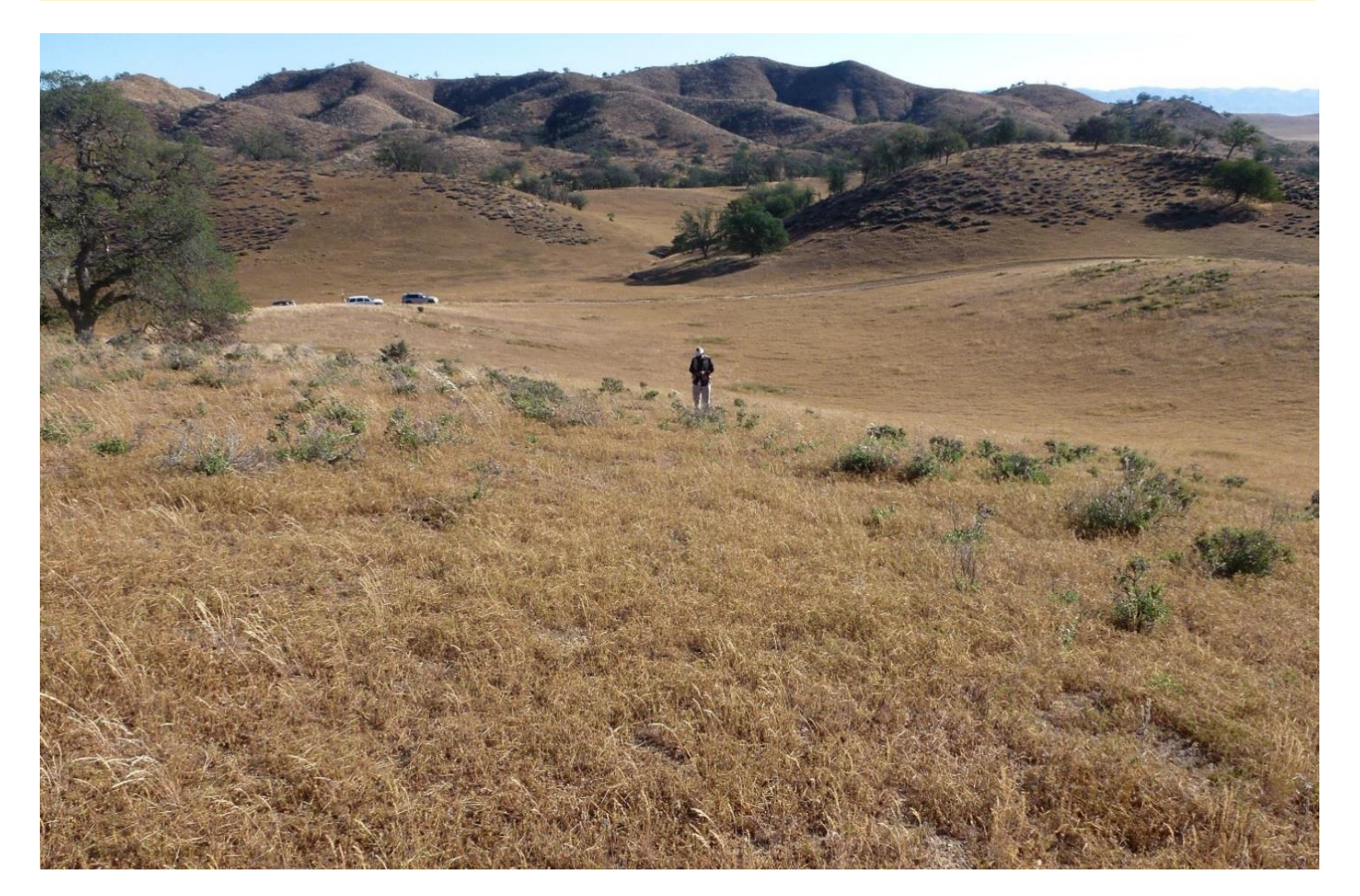
Figure 6. One of the authors in the stand. The green dot