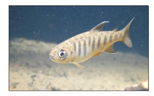
Priority Action Coho Team (PACT) Progress Report January 2016

Recovery of Coho Salmon in the Central California Coast Evolutionarily Significant Unit