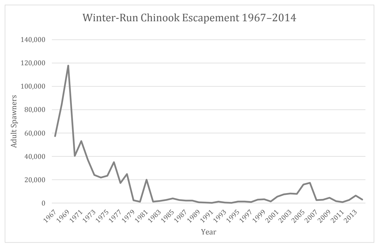
Figure 2 Estimated Escapement of Winter-Run Chinook Salmon in the Sacramento River

Following construction of RBDD, the population began to decline. Although RBDD was constructed with fish passage facilities, the dam impeded passage and contributed to adults spawning downstream of the structure (Hallock et al. 1982). Spawning downstream of RBDD tends to be unsuccessful because that reach of the river is beyond the influence of the cold water released from Shasta Reservoir, and water temperatures above 56°F result in increased egg mortality (Gains and Martin 2002). RBDD also was a source of mortality for downstream migrant juveniles that were spawned above the dam. Turbulence created when the dam's gates were lowered into the river disoriented juvenile outmigrants, making them easy prey for predatory fish such as the Sacramento pikeminnow ( Ptychocheilus grandis ) that concentrated below the dam (Vogel and Marine 1991). Following closure of the dam gates in 1966, the year classes that were at sea returned strong, and then the population began a steady decline (Figure 2) attributable to the cumulative effects of habitat loss, fishing pressures, entrainment, and the added effects of the new barrier. (Myers et al. 1998). This decline ultimately led to their listing under the California Endangered Species Act (CESA) and federal Endangered Species Acts (ESA) in 1989 (NMFS 1989).