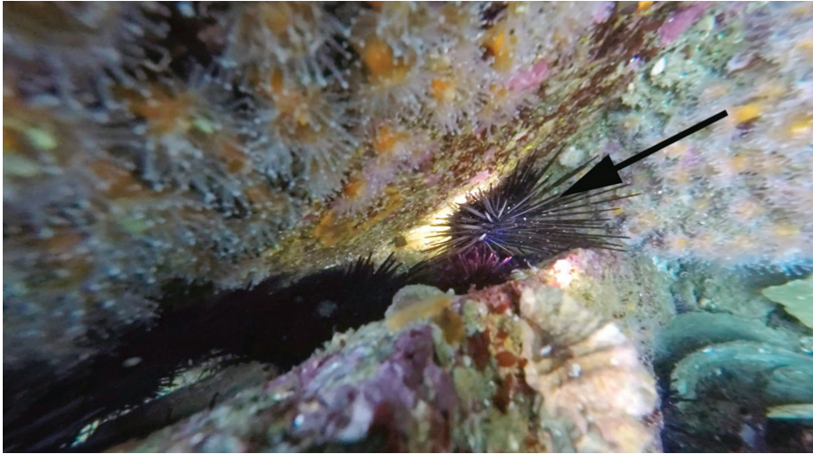
FIGURE 1.—Crowned urchin (arrow) photographed on 12 April 2016 near the Monterey breakwater in Monterey Bay, California. Specimen was found next to purple urchins in a crevice on rocky reef substrate at a depth of about 4 m.