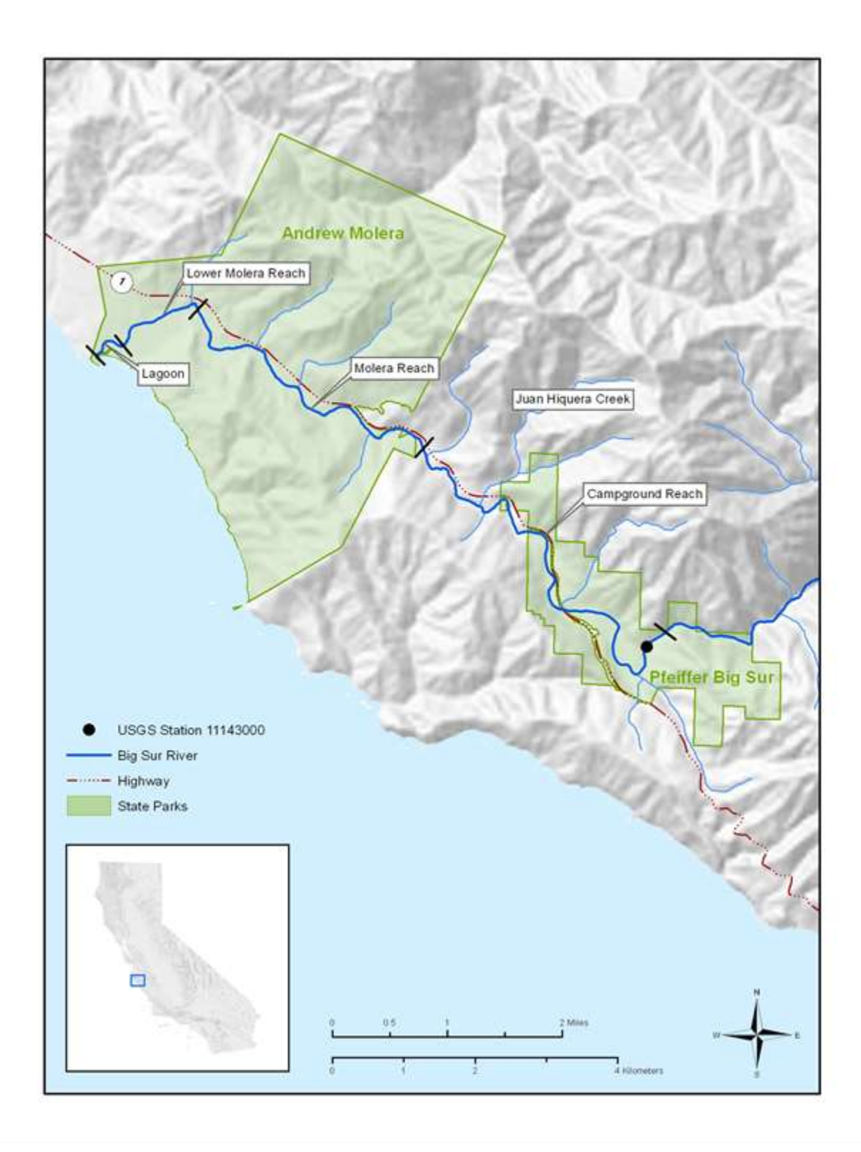
Figure 1. Map of Big Sur River showing study reaches.