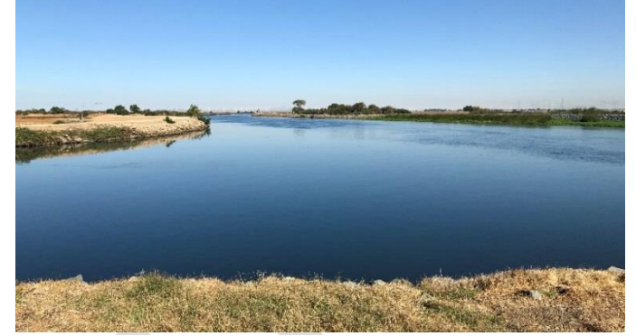
Figure 2: Dutch Slough