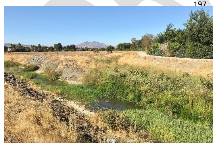
Figure 3: Three Creeks Parkway Restoration area - Marsh and Sand creek confluence

Habitat Conservancy, County of Contra Costa, City of Brentwood, City of Clayton, City of Oakley, the Flood and Water District, EBRPD, United States Fish and Wildlife Service, and California Department of Fish and Wildlife.