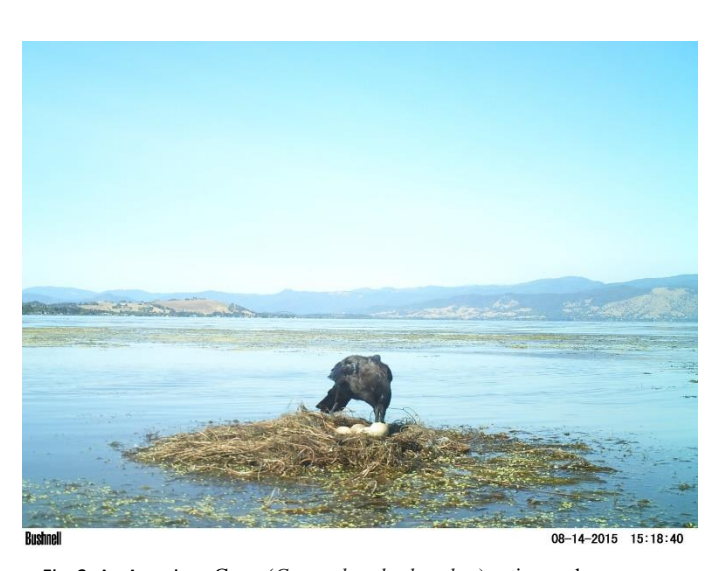
Fig. 2. An American Crow (Corvus brachyrhynchos) eating grebe eggs from an abandoned nest.

A disturbance was defined as an action causing a grebe to noticeably alter its behavior. Weekly disturbance and potential disturbance surveys were conducted once nesting began. [At Clear Lake we limited nest disturbance surveys to periods when eggs were present; we also conducted surveys for periods as short as 15 minutes] These were done at random times of day and week.