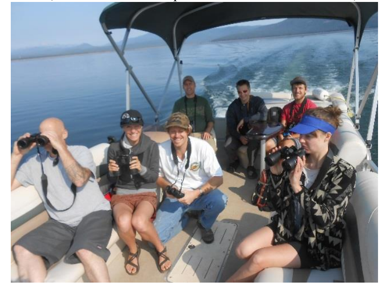
Fig. 3. Feather River College students on grebe tour at Lake Almanor.

Plumas National Forest's Kid's Fishing Derby, Plumas Arts presents Wild and Scenic Film Festival, and Plumas National Forest's Fall Fest. The chapter distributed grebe brochures, and displayed pictures and general information about Western and Clark's Grebes. Much attention was paid to a life sized wooden grebe sculpture and a birds and climate change display with information on the predicted range changes for grebes. 275 individuals came to the booths to learn about grebes and their conservation.