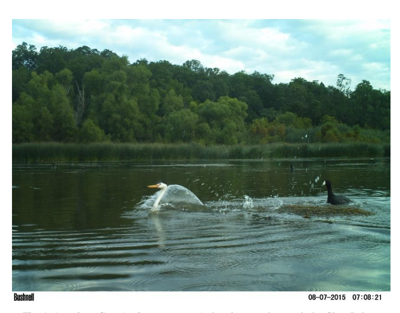
Fig. 1. American Coot ( Fulica\ americana ) charging a grebe caught by Clear Lake wildlife cameras. The two waterbirds usually coexist without issue.

The protocol was based on Gericke, et al. (2006) and has been modified based on our experiences on the lakes during the last five breeding seasons.