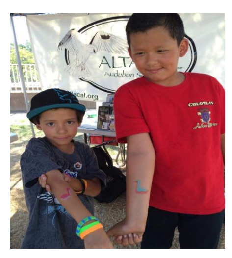
Fig. 5. Visitors at the Thermalito Afterbay display their grebe body art.