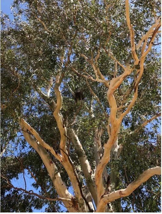
Red-tailed hawk nest in eucalyptus tree