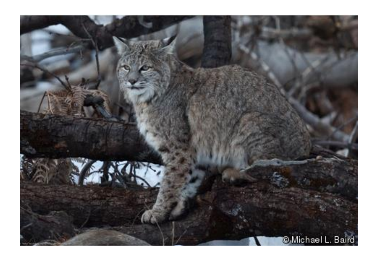
2017-18 Bobcat Harvest Assessment