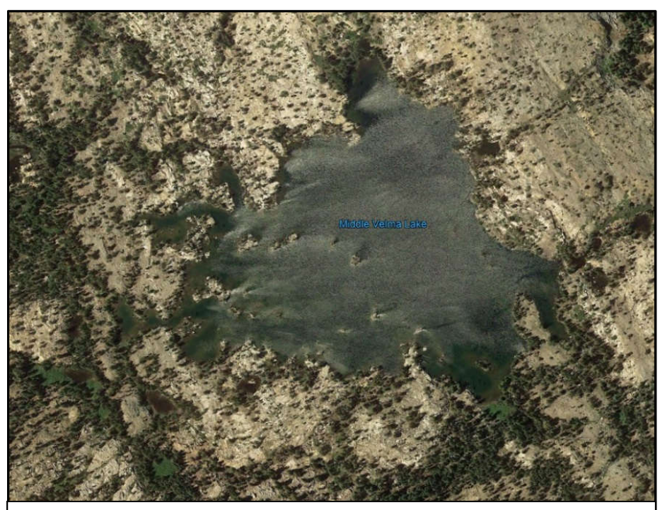
Figure 1: Middle Velma Lake (Site ID 13942), El Dorado County California.

Middle Velma Lake is a well-known trophy rainbow trout fishery and has earned a distinguished reputation amongst Desolation Wilderness anglers. It has been stocked with rainbow trout since the 1940s without any variation in species. HML (High Mountain Lakes) gill net data collected in 2003 demonstrate the rainbow trout population is not self-sustaining and has dwindled in the absence of stocking. Rainbow trout stocking will resume in numbers and frequency similar to historic management to reestablish this trophy fishery.