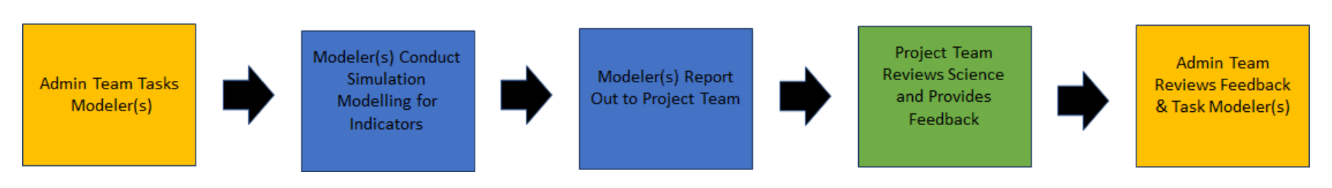
Step #1: Simulation modeling work

May repeat as feedback loop where modelers present revised model results to Project Team, Project Team provides additional input on model assumptions, and Admin Team reviews feedback from Project Team to inform any necessary tasks for modelers.