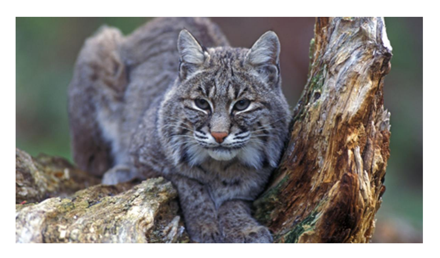
BOBCAT HARVEST ASSESSMENT 2018-19