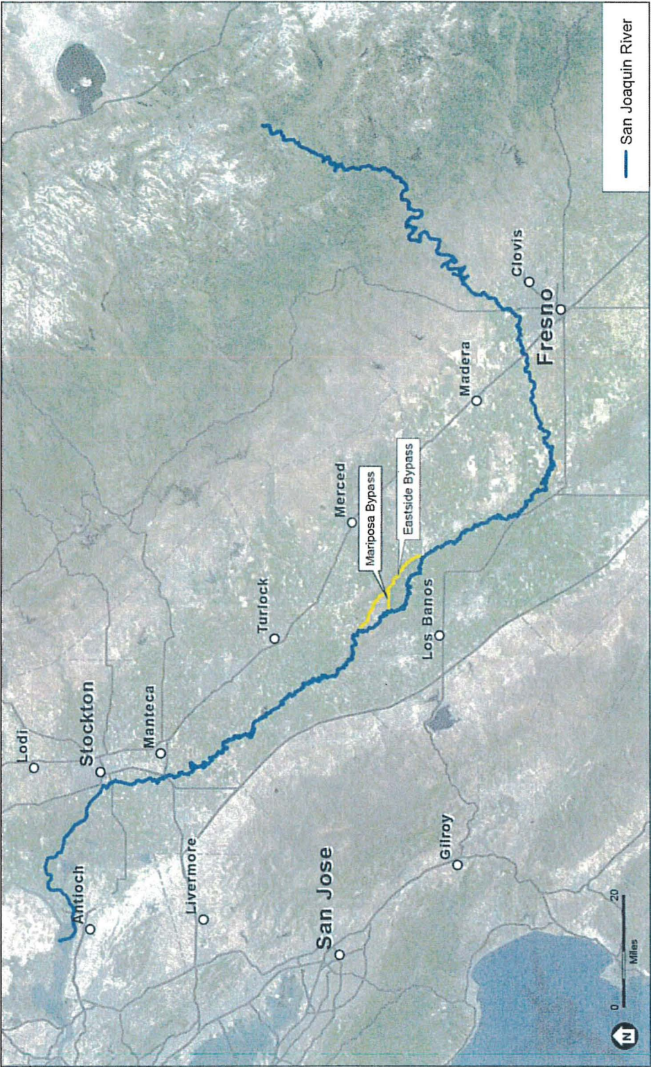
Figure 1. Regional Location