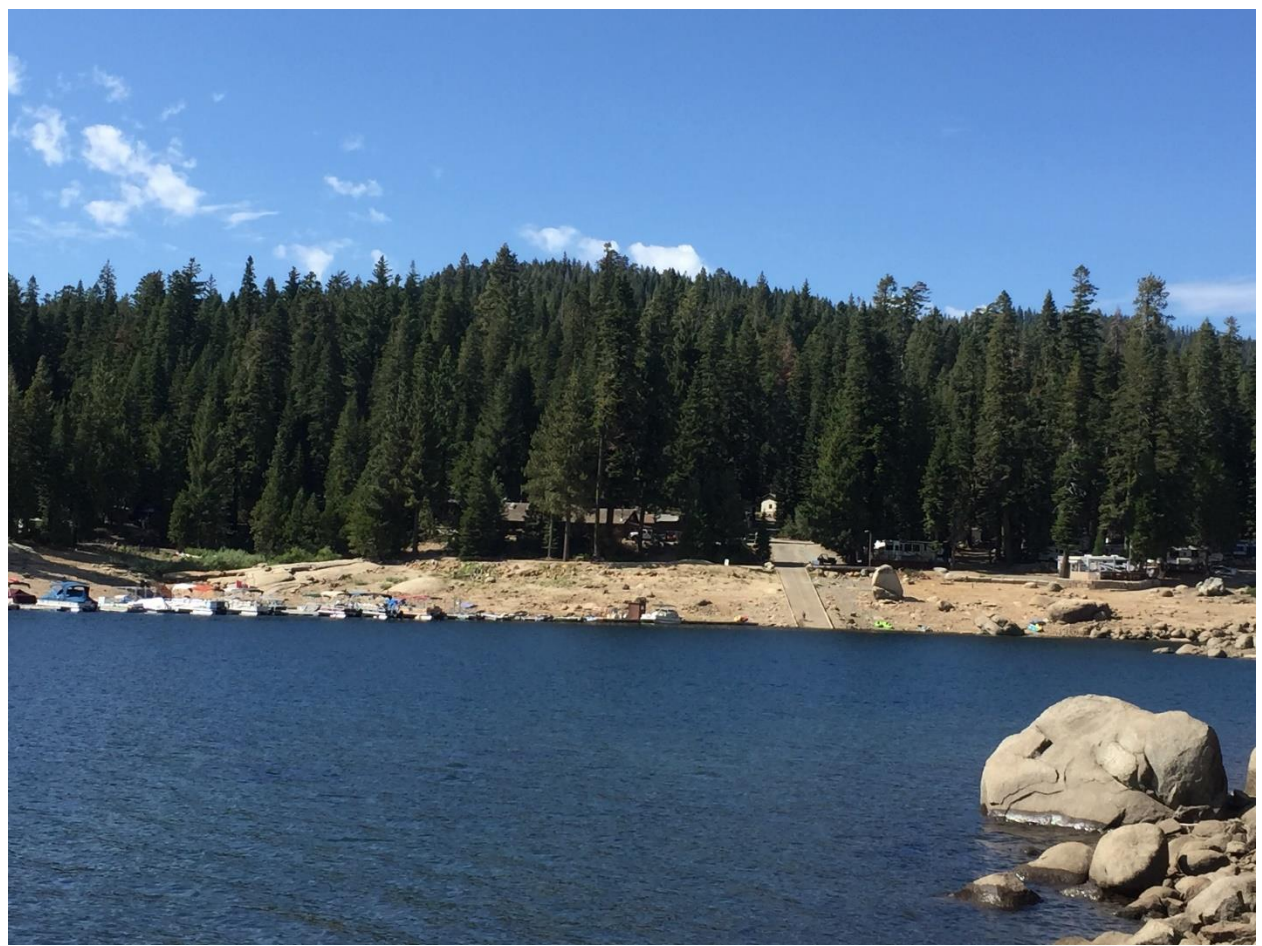
Figure 1. Lower Bear River Reservoir (9/4/2019) (Photo by B. Ewing).

One Department biologist conducted a visual encounter survey (VES) at Lower Bear. The biologist slowly circumambulated the lake looking for diurnal amphibians and reptiles (Fellers and Freel 1995). On July 9, 2019, the VES began at 10:30 and ended at 15:34 with a total survey duration of 88 minutes. Some of this time was used shuttling to accessible survey locations on the shore, surveying inlets (which were recorded separately), and a lunch period. The air temperature was 66.4°F (19.1°C) at 10:25 under clear skies. Water conditions were relatively clear, with visibility to about 10 feet. There was little to no breeze on the water, producing relatively flat water conditions and unimpeded views into the water. Water temperature was 64.4°F (18.0°C) at 10:28. On September 4, 2019, the VES began at 13:39 and ended at 15:15 with a total survey duration of 81 minutes. The air temperature was 73.7°F (23.2°C) at 13:00 under partly cloudy skies. Water conditions were relatively clear, with visibility to about 10 feet. There was little to no breeze on the water, producing relatively flat water conditions and unimpeded views into the water. Water temperature was 70.8°F (21.6°C) at 13:00. Due to the large size of Lower Bear and the amount of steep bedrock and difficult shoreline terrain to navigate, the biologist was not able to survey Lower Bear's entire shoreline (Figure 2).