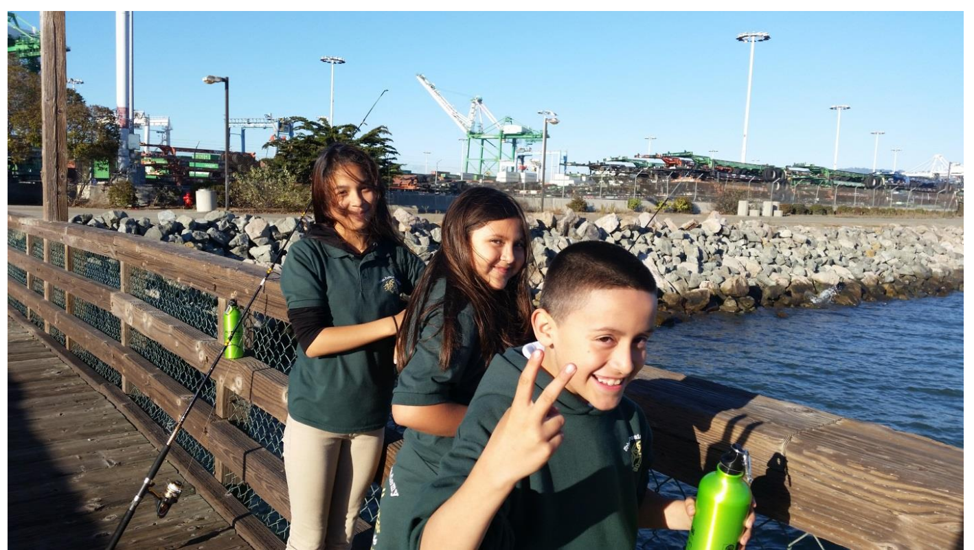
Image 7: Urban Promise Academy Elementary youth fishing at Port View Park, Middle Harbor Shoreline for their afterschool shoreline program.