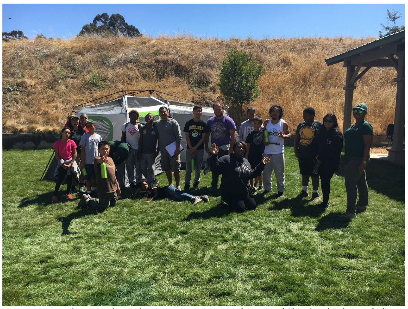
Image 4: Main cohort Lincoln Kinship camping at Point Pinole Regional Shoreline for their end of year overnight end of trip all group photo.