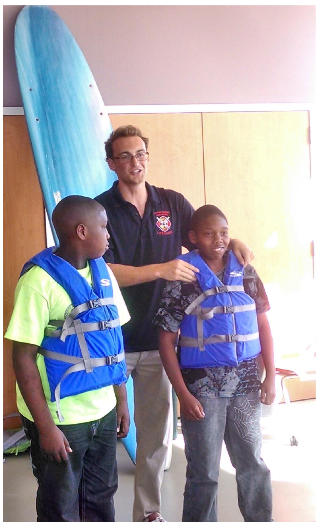
Image 8: EBRPD Lifeguard Services staff conducting Water Safety presentation at REACH Ashland Youth Center.