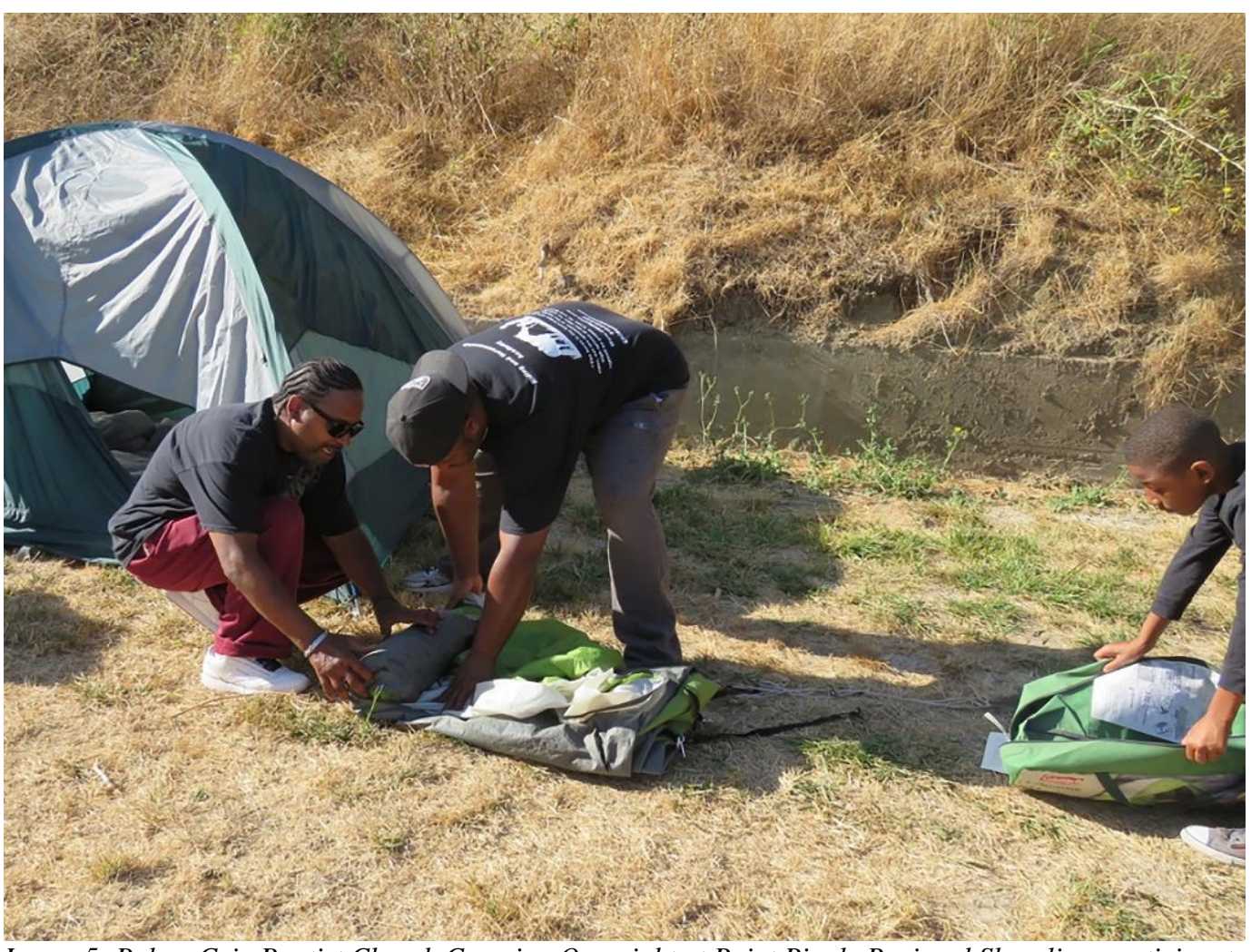
Image 5: Palma Ceia Baptist Church Camping Overnight at Point Pinole Regional Shoreline, participants taking down tents and cleaning up the campsite.