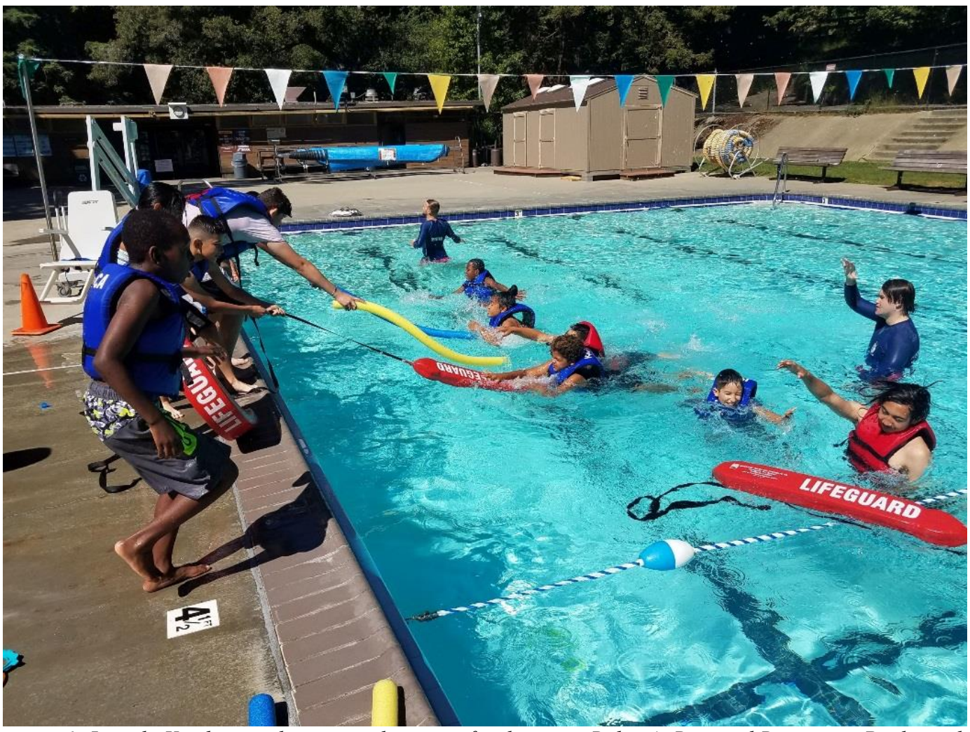
Image 1: Lincoln Kinship youth, swim and water safety lesson at Robert's Regional Recreation Pool, youth practicing rescues and pool side reach assists with WSI's (Water Safety Instructors).