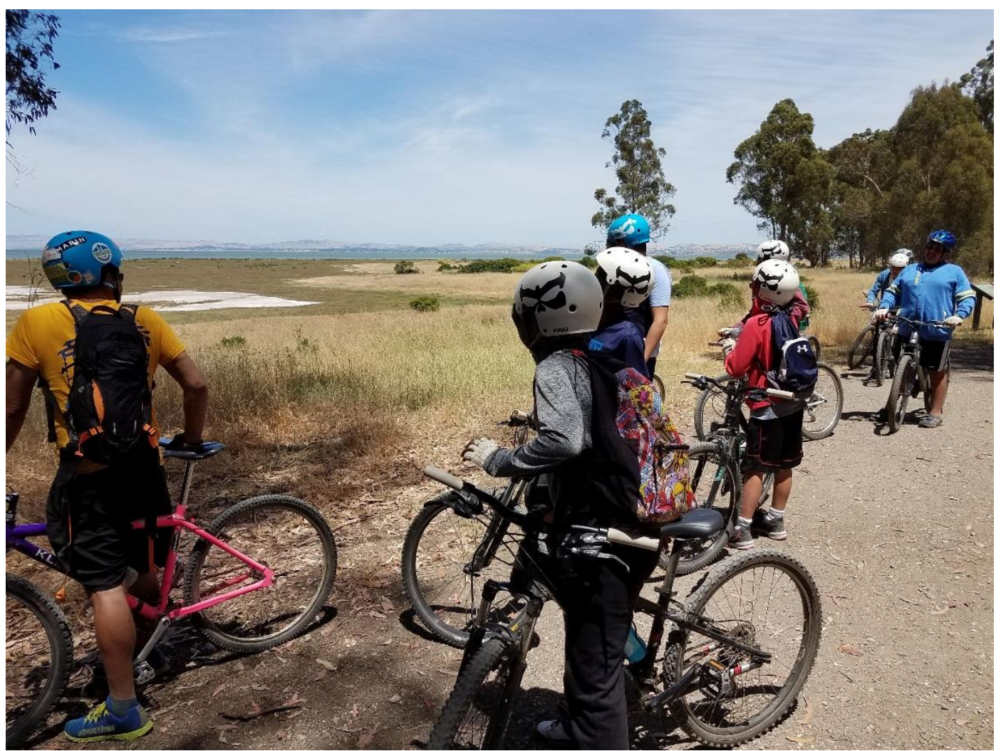
Image 2: Lincoln Kinship youth, mountain biking with Trips for Kids at Point Pinole Regional Shoreline for their final shoreline Saturday.