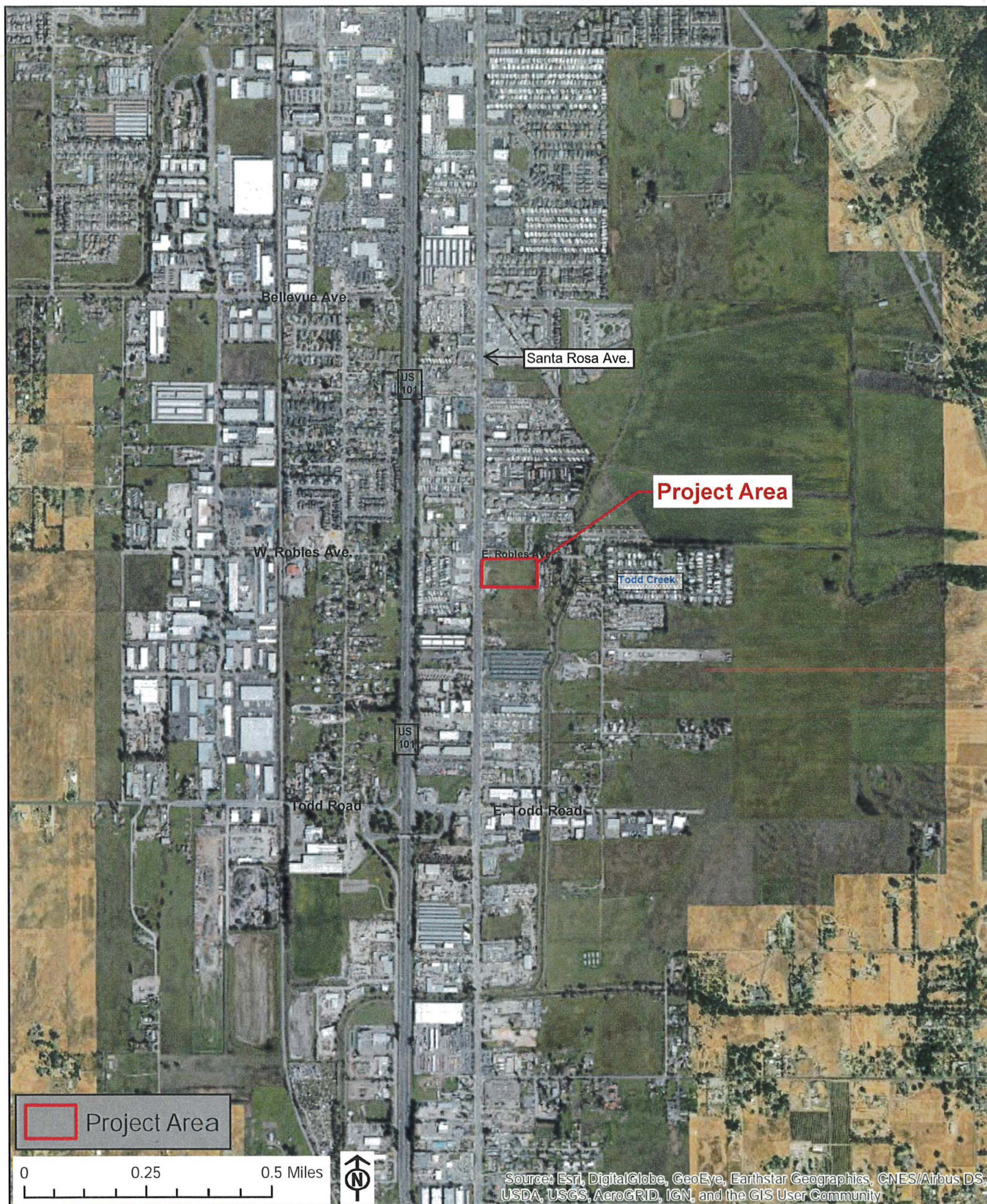
Figure 1. Project Location Map

The Redwood Apartments Project Sonoma County, California, USACE File# 2003-28294N