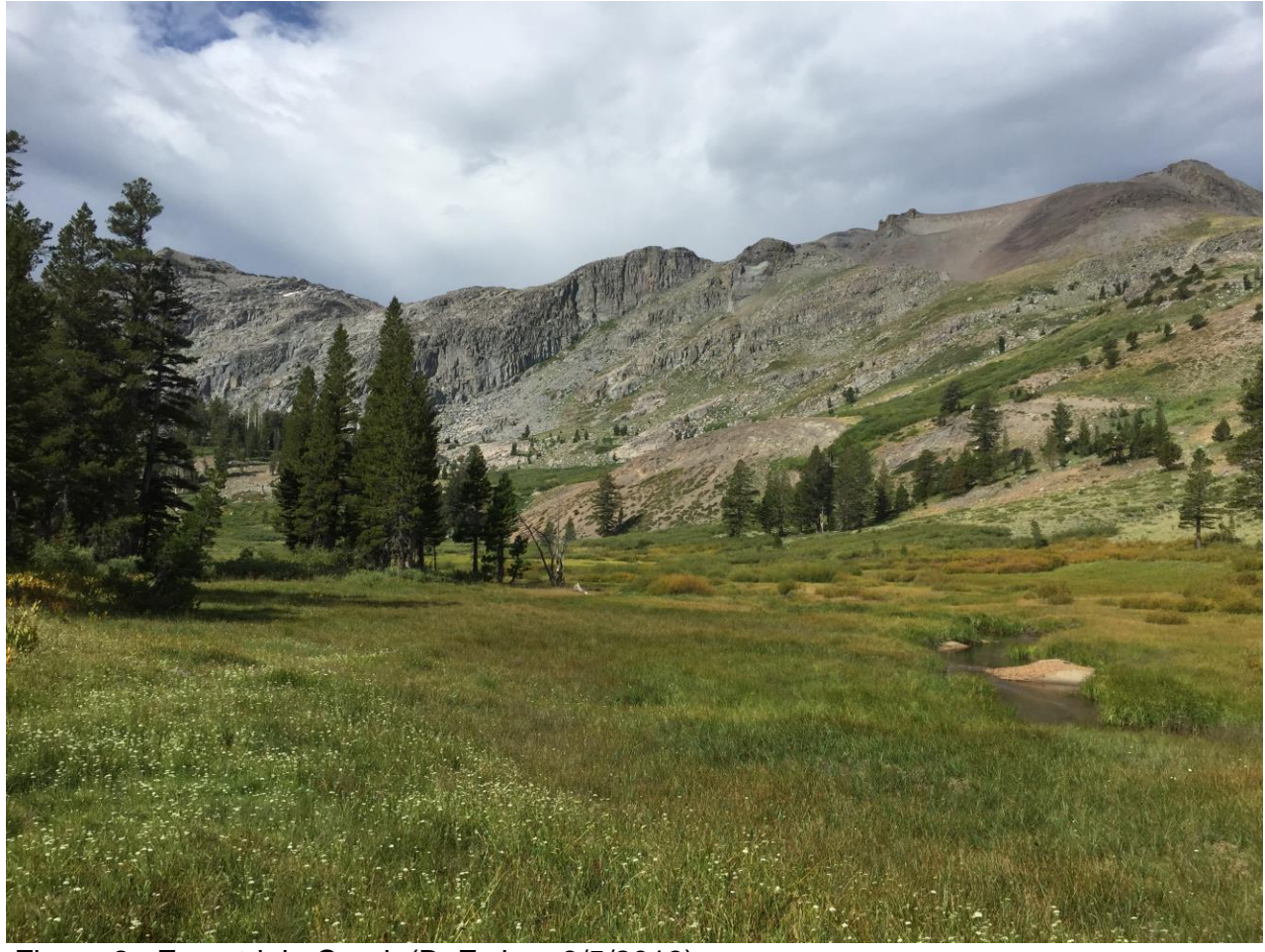
Figure 2. Forestdale Creek (B. Ewing, 9/5/2019).