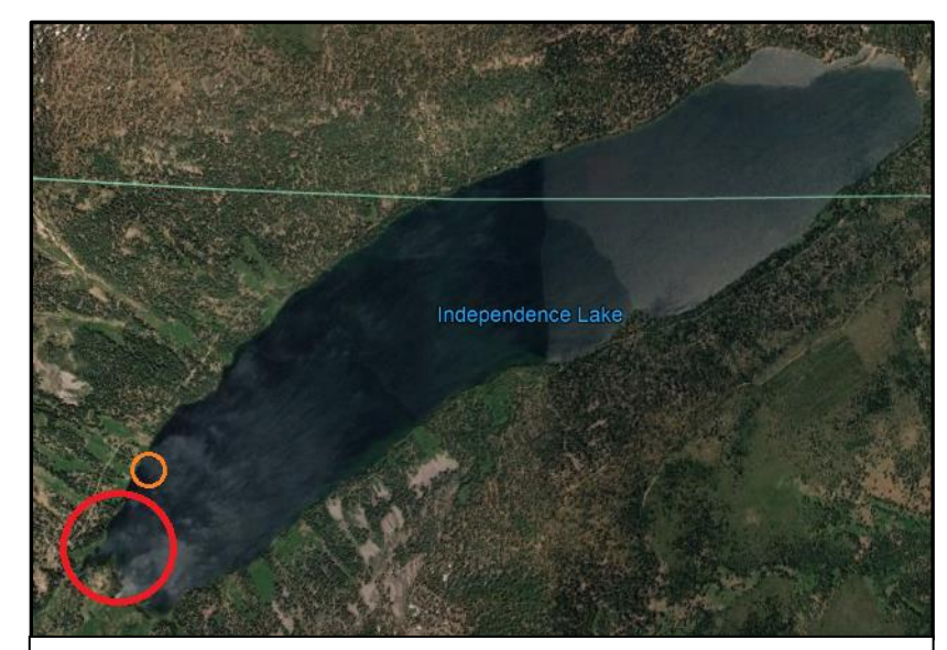
Figure 1. Aerial imagery of Independence Lake. The red circle depicts where Fyke Trap #'s 1-6 were set on June 24, 2019. The orange circle indicates where Trap #1 was reset on June 27, 2019.

From the dates of June 24, 2019 to June 27, 2019, a team of Scientific Aids led by CDFW Environmental Scientists Mitch Lockhart, John Hanson, and Isaac Chellman, went to Independence Lake, CA (Figure 1), to capture as many Lahontan Cutthroat Trout (LCT; Oncorhynchus clarkii henshawi) as possible, to gather fin clips for genetic analysis. The crew set and checked Fyke Ttraps and angled from shore and boat. The tissue samples will be analyzed to establish whether this historically native population