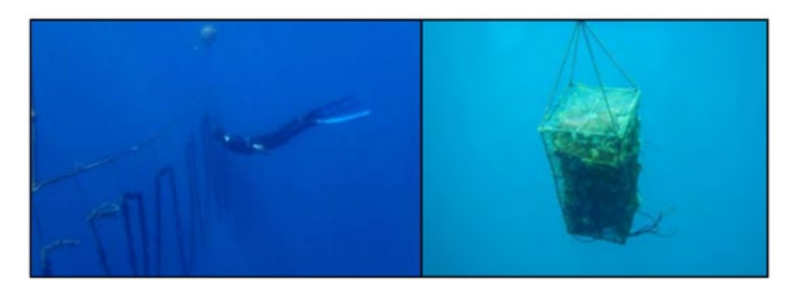
Figure 2-10. Submerged longline variations: mussel longline and stacked cages hanging from a submerged longline.