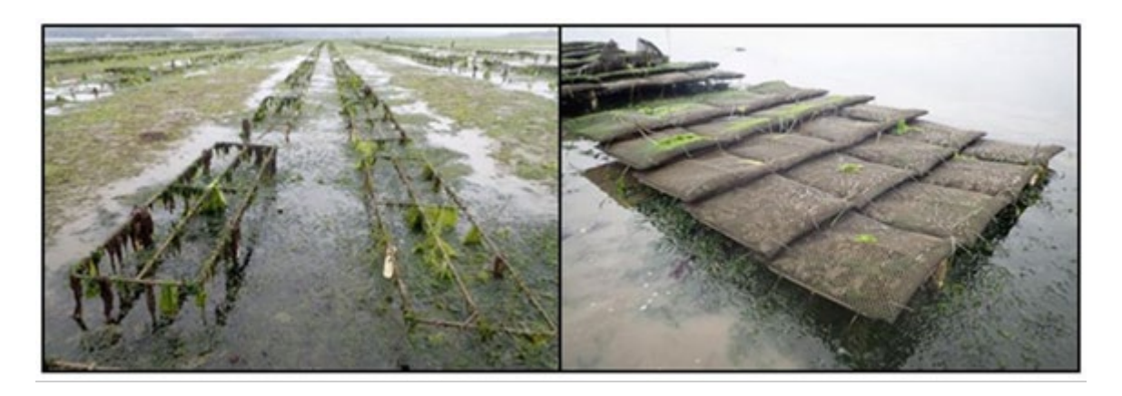
Figure 2-6. Rebar racks and Vexar mesh oyster bags, suspended above substrate using PVC. Bags may be arranged in an overlapping fashion to absorb wave energy more effectively.

This method is commonly used in California for several reasons. Logistically, the raised containers can be accessed by boat and may be easier to handle than bottom containers. In addition, the rack structure allows containers to be placed off-bottom in softer sediments where the bottom container method is not an option due to a high burial risk.