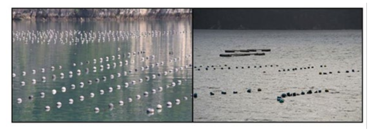
Figure 2-9. View of subtidal longlines from a distance.