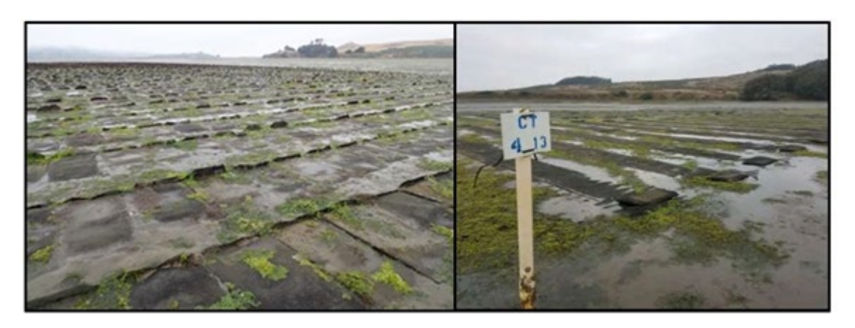
Figure 2-5. Left: Embedded bottom bags used for clam culture. Right: Clams seeded into the mud are covered with mesh netting until they can be raked out at harvest time.

several years of grow-out time, the bags are removed from the mud and gently shaken to remove sediment. To harvest clams that are directly seeded into the sediment, rakes or hydraulic dredges must be used. Only one company in California still uses in-ground clam culture. Because of the increased substrate disturbance caused by harvesting with the hydraulic rake, this method will be phased out in the next few years.