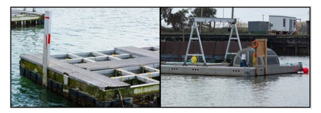
Figure 2-12. Raft modification: floating upwelling raft system. Upwelling containers hang in compartments on floating rafts (left) with a large paddle wheel directing nutrient rich water through containers (right).

A popular modification of this method, the floating upwelling raft system (FLUPSY), is used to grow shellfish seed quickly to the appropriate size for planting. On a FLUPSY, a series of upwelling containers hold small oyster seed while an underwater paddle wheel circulates algae and nutrient-rich waters through the screened bottoms of each container (Figure 2-12). Floating rafts support the upwelling containers and keep the shellfish several feet below the water surface. FLUPSYs are typically installed adjacent to piers and held in place using mooring lines and chain as well as anchored to the seafloor.