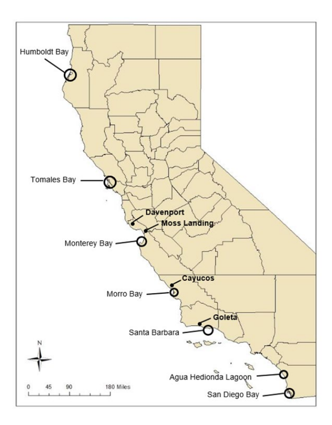
Figure 2-1. Locations of commercial marine aquaculture facilities in California. Open circles show locations with facilities in state waters and closed circles show land-based facilities. Many facilities within state waters also have associated land-based facilities.

Marine aquaculture of shellfish and seaweed occurs throughout the state of California in both coastal waters and private land-based facilities (Figure 2-1 and Table 2-1). Although the majority of operations are within coastal waters, there are three active land-based facilities growing shellfish and/or seaweed for commercial sale and consumption, with a fourth long-standing operation in Cayucos closing business in early 2020. A total of 4,960 acres of California public tidelands are utilized for marine aquaculture, which are leased out by the Commission via a state water bottom lease, unless the tidelands are previously granted or privately owned by other entities.