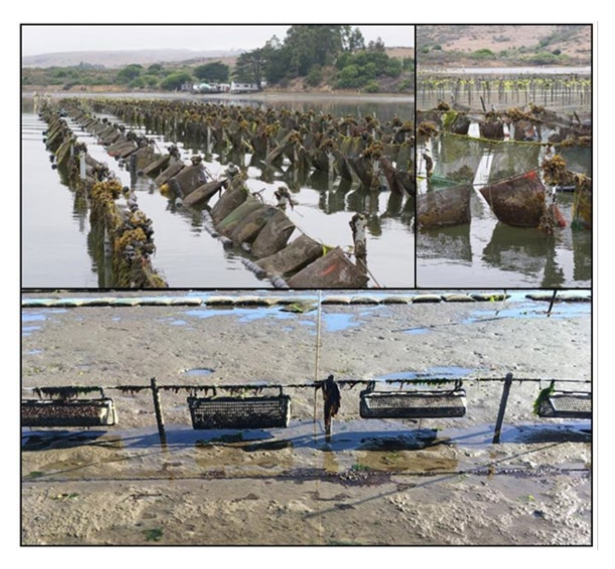
Figure 2-7. Intertidally suspended lines with floating bags (top, left and right) and hanging non-floating baskets (bottom).