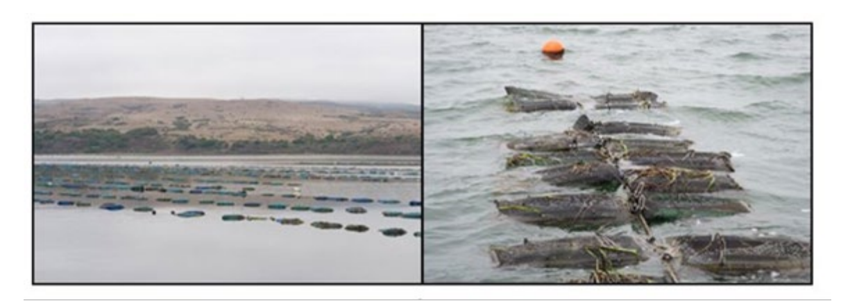
Figure 2-8. Subtidal longlines using bags with floats attached to keep the bags at the surface (Photos: CDFW).

suspension of stacked trays or cages of shellfish that hang vertically beneath the longline (Figure 2-10). A variation of this method is used for mussels, which utilizes a specialized "fuzzy mussel rope" with a higher surface area for mussel settling and culturing. Fuzzy rope containing cultured mussels is hung in long repeating loops suspended from evenly spaced attachment points to the submerged longline. The submerged longline can be maintained at a constant water depth, approaching 30 feet deep in some nearshore farms, using a series of submerged floats and counterweights.