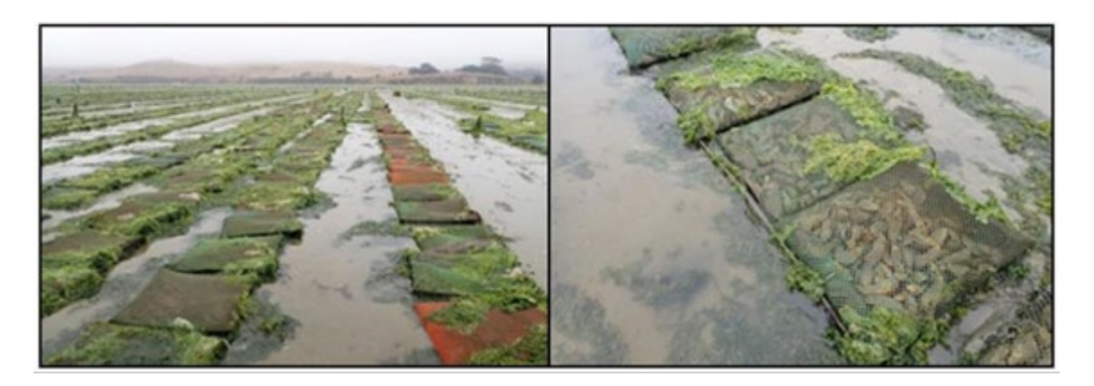
Figure 2-4. Bags on bottom attached to staked lines; bags are attached to lines using coated wire and closed using zip ties (Photos: CDFW).

This culture method dominates oyster production in California due to its suitability to the extensive intertidal areas in most leases and its low-cost relative to culture methods which require more structural components. Oysters grow well, are relatively easy to handle, allow boats to pass over easily during high tide, and can be walked through relatively easily during low tide.