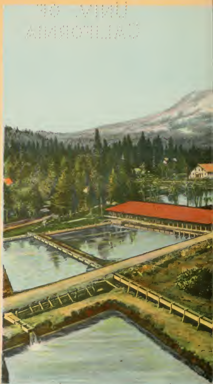
BIRDSEYE VIEW OF ONE SECTION OF HATCHERY AND FINEST IN THE WORLD. MO