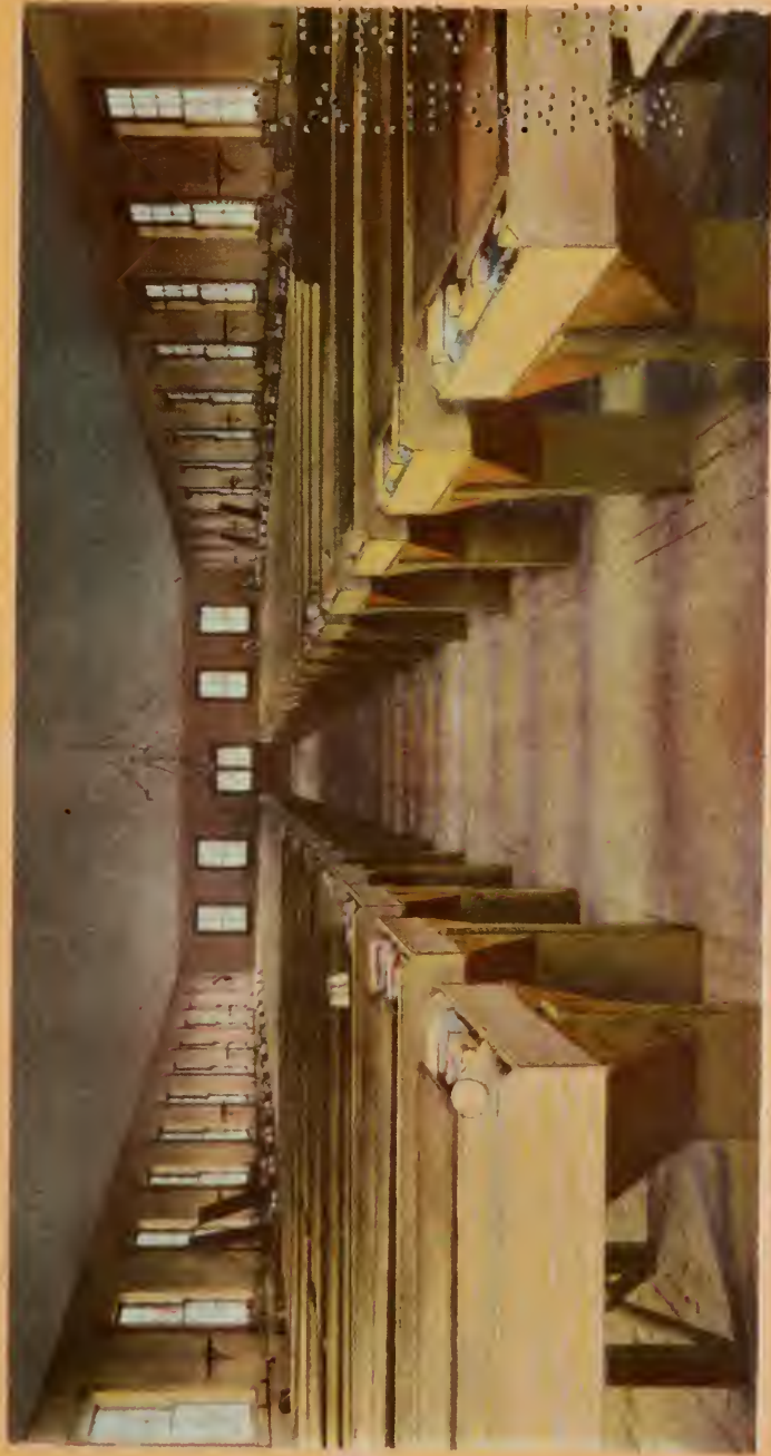
INTERIOR OF ONE OF THE HATCHING BUILDINGS AT STATE HATCHERY, SISSON, CAL.