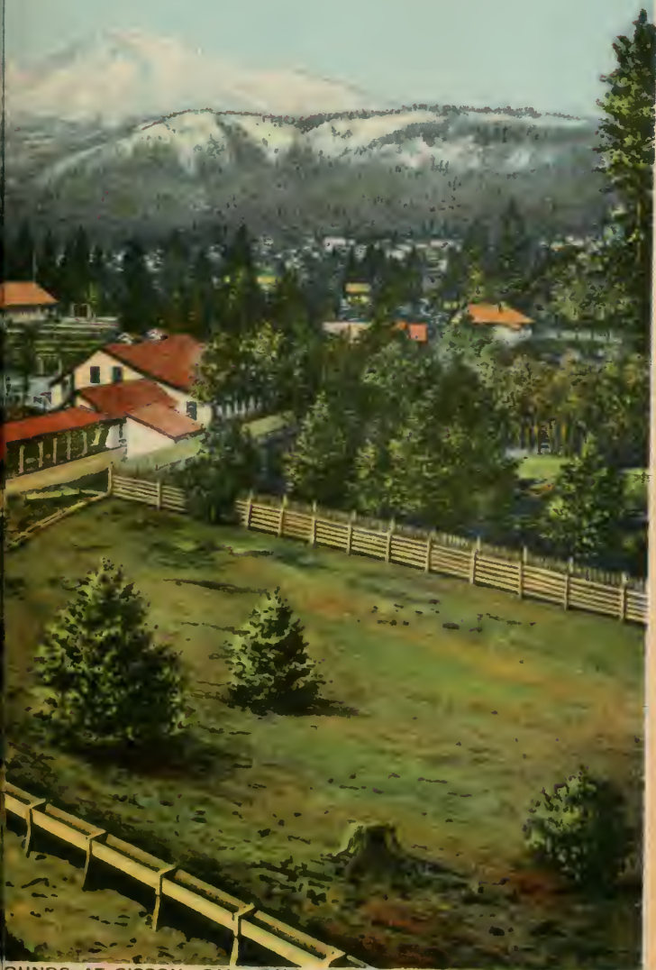
HOUSES AT SISSON, CAL. ONE OF THE LARGEST AND SHASTA IN BACKGROUND.