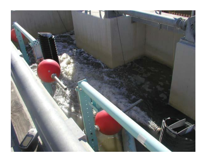
Operating tide gate

McNabney Marsh is a 137-acre marsh that is part of the Peyton Slough Marsh complex. Peyton Slough is the hydrological connection between McNabney Marsh and the Carquinez Straits. Over the past 150 years, the natural tidal regime of McNabney Marsh has been altered by numerous human activities. Those activities resulted in a marsh that had poor drainage and reduced tidal fluctuations, resulting in desalination, low vegetation cover, and a change in plant species composition. Consequently, there was a reduced habitat suitability for the salt marsh harvest mouse and other tidal marsh wildlife species.