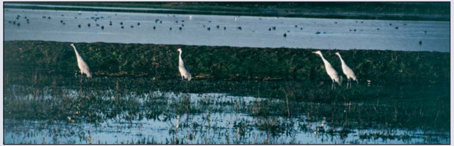
Sandhill crane.

of the amphibians to survive and reproduce. In order to protect peninsular bighorn sheep watering areas, managers close two reserves in the Eastern Sierra - Inland Deserts Region from June 15 to Sept. 30 each year. Managers also close reserves during peregrine falcon and shorebird nesting periods so these birds can care for their young without disturbance. The rarity of the plant communities protected at Pine Hill, Phoenix Field and Apricum Hill ecological reserves in the Sacramento Valley - Central Sierra Region necessitates caution