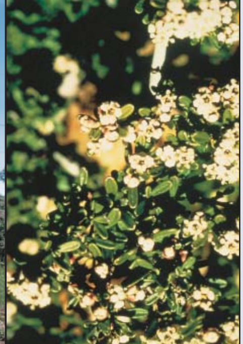
Left, Pine Hill.