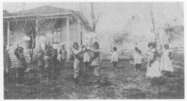
Kindergarten class at play [circa 1900]

In summary, this period saw the establishment of California as a state. With statehood, laws were passed that infringed on the rights of Indian people to occupy their homelands, and caused them to be used much like slaves. It was not until the enactment of the 14th Amendment that these rights were restored. Treaties were negotiated and rejected; reservations established, dissolved, and reinstated; and Indians were still in a period of unrest.