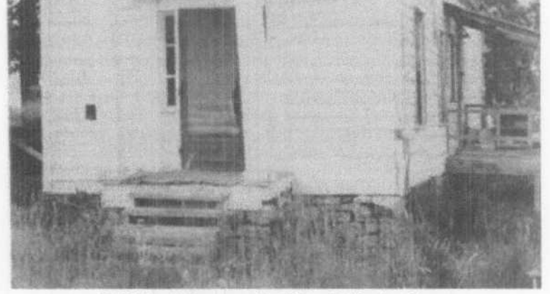
Old School House at Ft. Bidwell, Modoc County