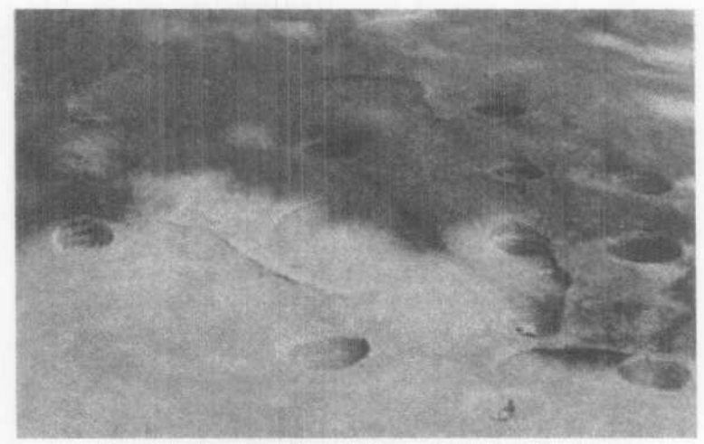
Indian Grinding Rock State Historic Park, Amador County

$29,100,000 was awarded as redress. This amounted to approximately 47 cents per acre. The Indian Claims Commission approved the settlement in 1964, and Congress appropriated the funds that same year.