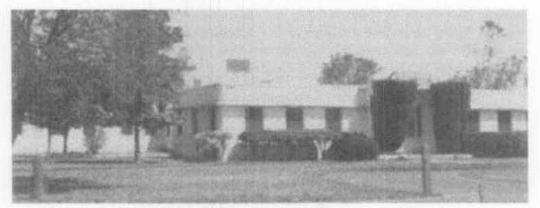
Ya-Ka-Ama Indian School, Sonoma County

number of Indians in California had grown to more than 201,000, more Indians than in any other state. Probably a little more than half of these are the descendents of aboriginal Californians. Their population is still far below the approximately 310,000 Indians living in California when Europeans first arrived on these shores.