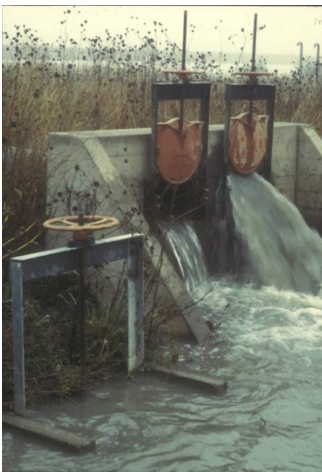
Dave Feliz, CDFW

Rivers, streams, and estuaries in California have been substantially modified and controlled since the Gold Rush. As a result, the natural hydrologic processes of the state's system of rivers, lakes, streams, and estuaries have also been substantially altered, which has created significant ecosystem stress on native aquatic species. Land development, construction of dams, flood control structures, diversions of water, and groundwater withdrawal all change the volume, timing, hydraulics, sediment load, and temperatures of water that runs off the landscape into the ground and/or streams. These impacts are exacerbated by drought conditions and climate change. These changes affect aquatic habitats necessary for species survival.