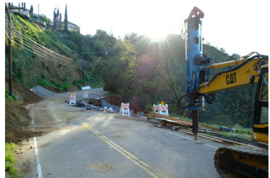
Adam Dubrowa, FEMA

Avalanches, landslides, and sinkholes have a variety of ecological effects, and many of these effects can be amplified by other factors. Generally, avalanches and landslides bring additional sediment into river systems, degrading water quality and silting reservoirs. Timber harvests and fires that remove vegetation increase the incidence of landslides and the probability of slope failure during the wet season. Landslides create bare ground that is subject to erosion and to invasion by non-native species. Sinkholes may directly impact species and ecosystems.