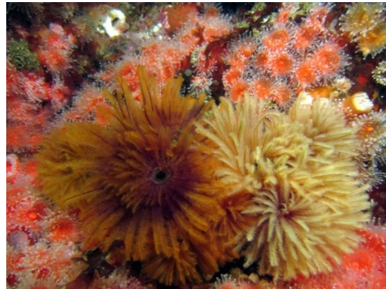
Athena Maguire, CDFW

Vernal pools are a unique type of rain-fed seasonal wetland that occurs in depressions underlain by poorly drained or restrictive soil types. California vernal pools contain standing water during the winter and spring and are completely dry during the hot Mediterranean summer. As the standing water evaporates the pool and the surrounding soils can become saline, alkaline, or acidic. Many specially-adapted crustaceans, amphibians, insects, and plants occur only in vernal pools (CDFW 2015).