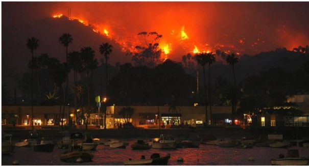
Harry Morse, CDFW

was lightning, followed by human-related causes, including power lines, arson, and vehicles (CAL FIRE 2015). Lightning-caused fires typically occur above 5,000 feet in altitude, but are recorded to have occurred at much lower elevations (Burcham 1957).