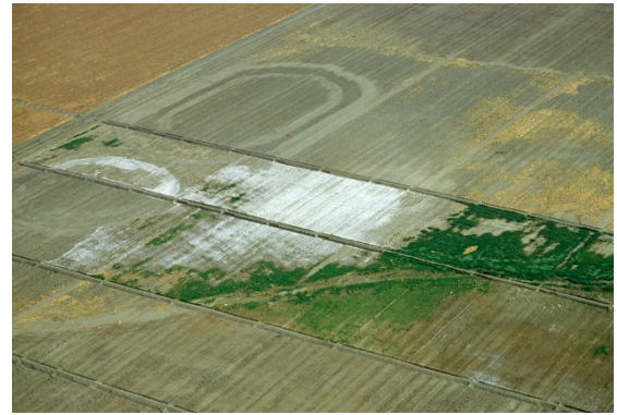
Scott Bauer, USDA

Changes in soil pH have a strong effect on the relative availability of nutrients and minerals. Acidification of soils can lead to excessive availability of some minerals, including aluminum, which can be toxic to plants at high levels. Soil chemistry is also highly dependent on the presence of very small soil colloid particles which are found in clay minerals and soil organic matter. These colloids hold a static electrical charge which allows the soil to bond with and retain excess nutrients and pollutants that are carried into the soil. As soil organic matter is depleted through erosion, ground disturbance, vegetation removal, or lowering of the water table, the soil loses its ability to filter out pollutants which can lead to impacts on surface and groundwater quality (Pierzynski et al. 2000).