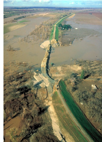
Michael Nevins, USACE

The shallow and nutrient dense waters of flooded areas provide excellent habitat for immature fish and other aquatic species. Many bird species rely on floodplains to provide wintering habitat or stop-over nutrition during migrations. Changes in the season of flooding can affect the availability of seed for migrating birds. Unseasonably high flows from hydroelectric projects, or urban runoff, can flush amphibian and fish spawning sites, or deposit sediment on egg masses, while the restriction of seasonal high flows to conserve water and electricity storage can interrupt the regeneration of riparian habitats that rely on flood events and lead to unsuitably high water temperatures.