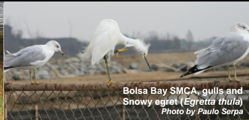
Bolsa Bay SMCA, gulls and Snowy egret ( Egretta thula )