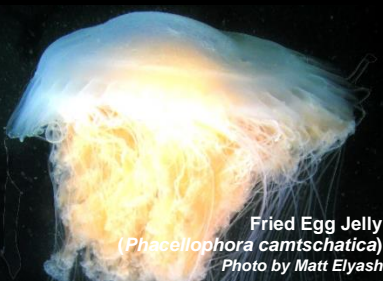
Fried Egg Jelly ( Phacellophora camtschatica )