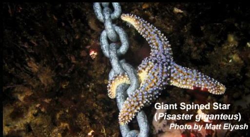
Giant Spined Star ( Pisaster giganteus )