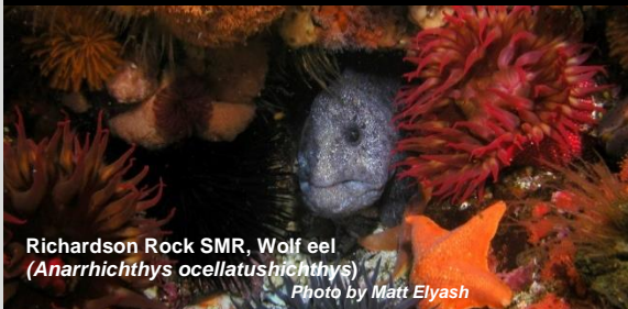
Richardson Rock SMR, Wolf eel ( Anarrhichthys ocellatus)