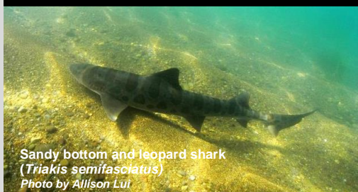
Sandy bottom and leopard shark ( Triakis semifasciatus)

Southern California Marine Protected Areas (MPAs), Established January 2012