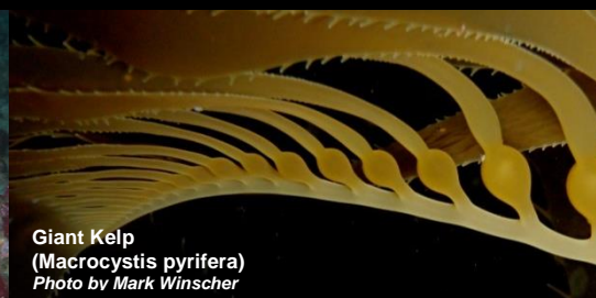
Giant Kelp ( Macrocystis pyrifera)