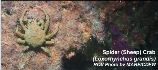
Spider (Sheep) Crab ( Loxorhynchus grandis ) ROV Photo by MARE/CDFW

Southern California Marine Protected Areas (MPAs), Established January 2012