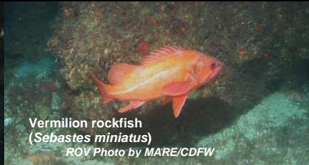
Vermilion rockfish ( Sebastes miniatus ) ROV Photo by MARE/CDFW