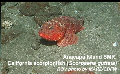
Anacapa Island SMR, California scorpionfish ( Scorpaena guttata ) ROV photo by MARE/CDFW