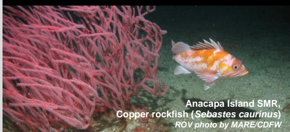
Anacapa Island SMR, Copper rockfish ( Sebastes caurinus ) ROV

Southern California Marine Protected Areas (MPAs), Established January 2012