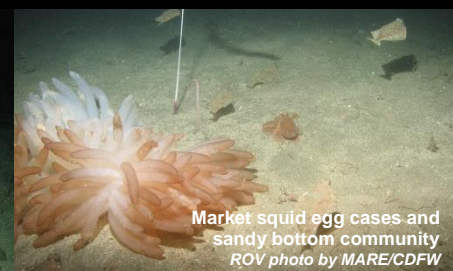
Market squid egg cases and sandy bottom community ROV