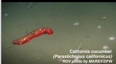
California cucumber ( Parastichopus californicus ) ROV photo by MARE/CDFW

Southern California Marine Protected Areas (MPAs), Established January 2012