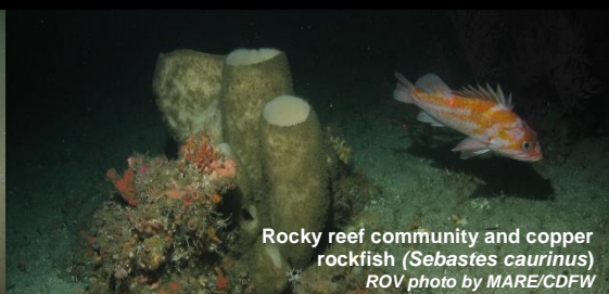
Rocky reef community and copper rockfish ( Sebastes caurinus )