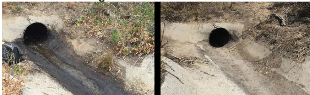
Left: May 21, 2015.