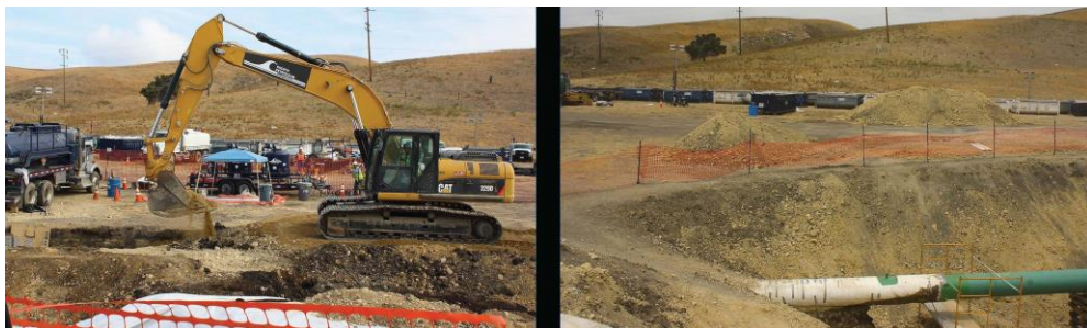
Left: May 24, 2015.