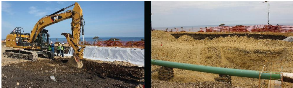
Left: May 25, 2015.