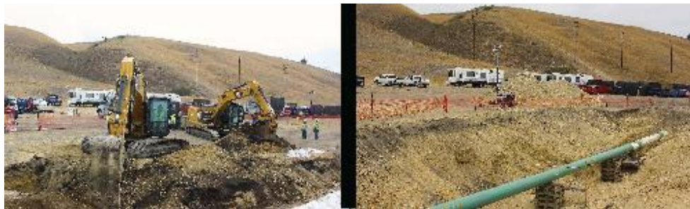
Left: May 24, 2015.