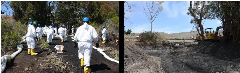
Left: June 2, 2015.