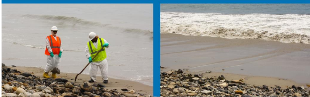
Left: May 29, 2015.