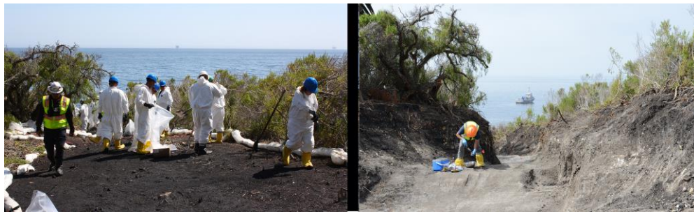
Left: June 2, 2015.