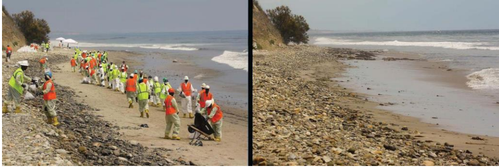
Left: May 29, 2015.