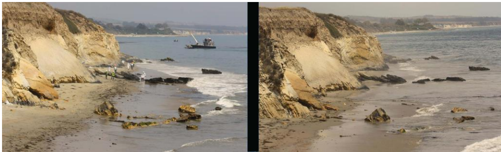
Left: May 29, 2015.