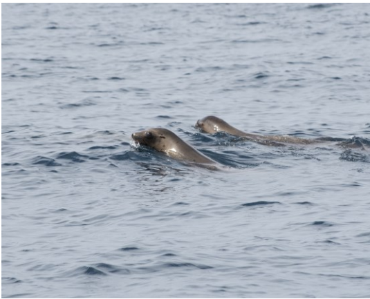
Two of three California sea lions, treated in San Diego for exposure to oil, return to the Pacific Ocean, Friday, July 17, 2015. The sea lions were recovered near the Refugio oil spill that occurred May 19 near Santa Barbara, Calif.