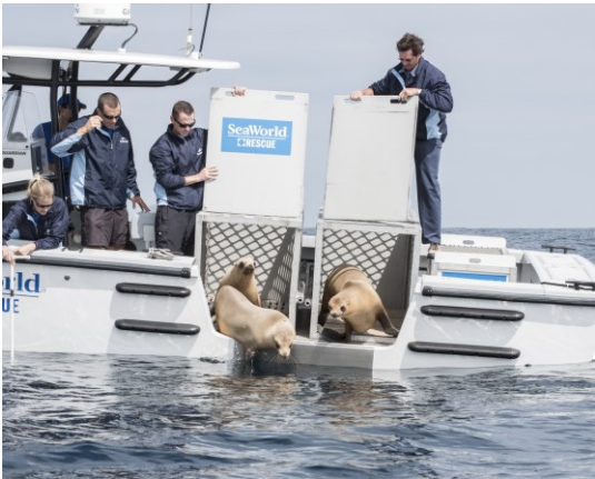
Three California sea lions, treated in San Diego for exposure to oil, aboard a boat are ready to return to the Pacific Ocean, Friday, July 17, 2015. The sea lions were recovered near the Refugio oil spill that occurred May 19 near Santa Barbara, Calif.