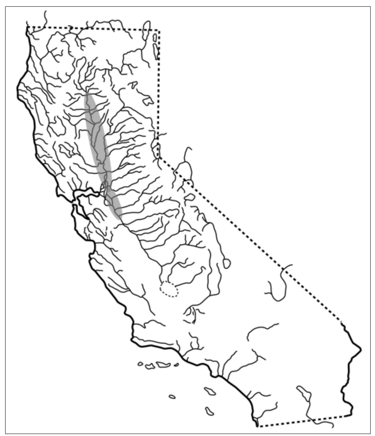
Figure 2. Distribution of Central Valley fall-run Chinook salmon, Oncorhynchus tshawytscha ESU, in the Sacramento and San Joaquin rivers of California.