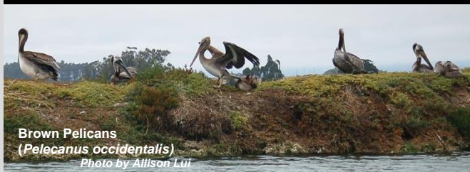
Brown Pelicans ( Pelecanus occidentalis )

Southern California Marine Protected Areas (MPAs)