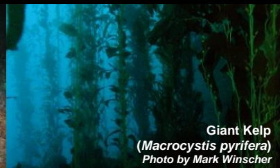
Giant Kelp ( Macrocystis pyrifera )