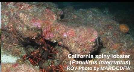
California spiny lobster ( Panulirus interruptus )