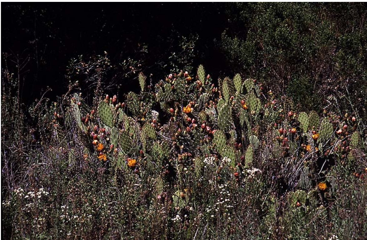
Pricklypear cactus around coastal sage scrub.

DFG and city and county governments started working closely together on an NCCP for the coastal sage scrub ecosystem. The first step provided a sound scientific foundation for the process. A team of independent, widely respected conservation biologists convened to