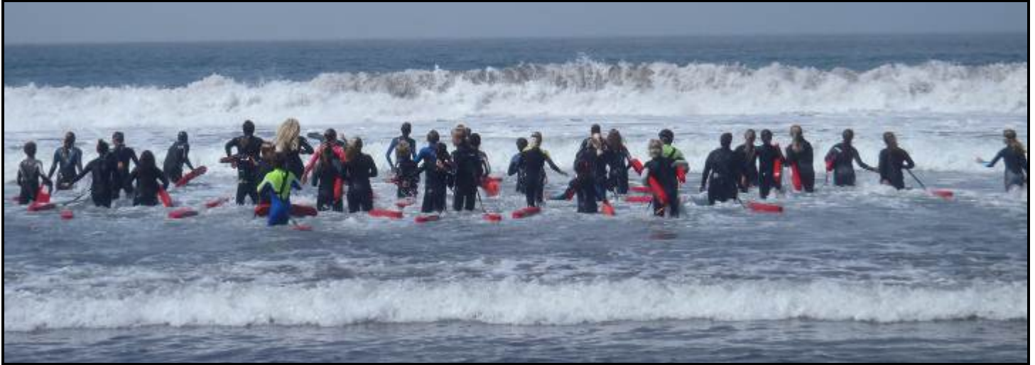
Junior Lifeguard Program at Stinson Beach, Golden Gate National Recreation Area

Forty-two recreational use projects are under way around the Bay Area. Here are some recent pictorial highlights: