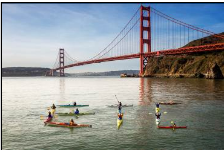
Environmental Traveling Companions Kayak Program