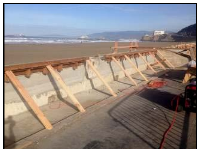
Ocean Beach seawall repairs