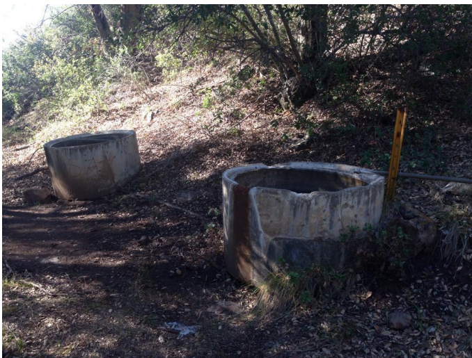
The current concrete troughs that attempt to retain the spring water.

A natural spring along Pine Creek Rd on Mt. Laguna was tapped into several decades ago, and a pipe was installed underneath the road that fed into two upright concrete troughs. This may have originally been done to supplement water for cattle grazing in the area. However, the fill pipe from the spring has since become disconnected and no longer feeds the troughs. Also, the current troughs pose severe danger to thirsty turkey poults, quail chicks, and rodent species by way of drowning since there is no way for them to escape if fallen into the troughs. The specific goals and objectives of this project are to provide a source of water during a horrific drought, that will in turn benefit upland game birds and upland game bird hunters.