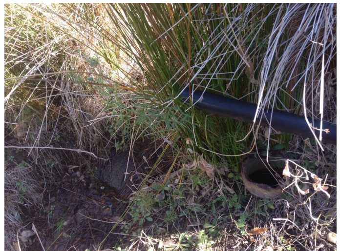
The extended fill pipe no longer serving its purpose.