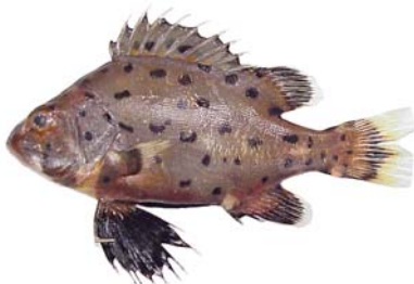
Junvenile giant sea bass.