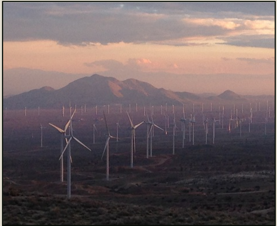
Tehachapi Wind Resource Area, Kern County, California