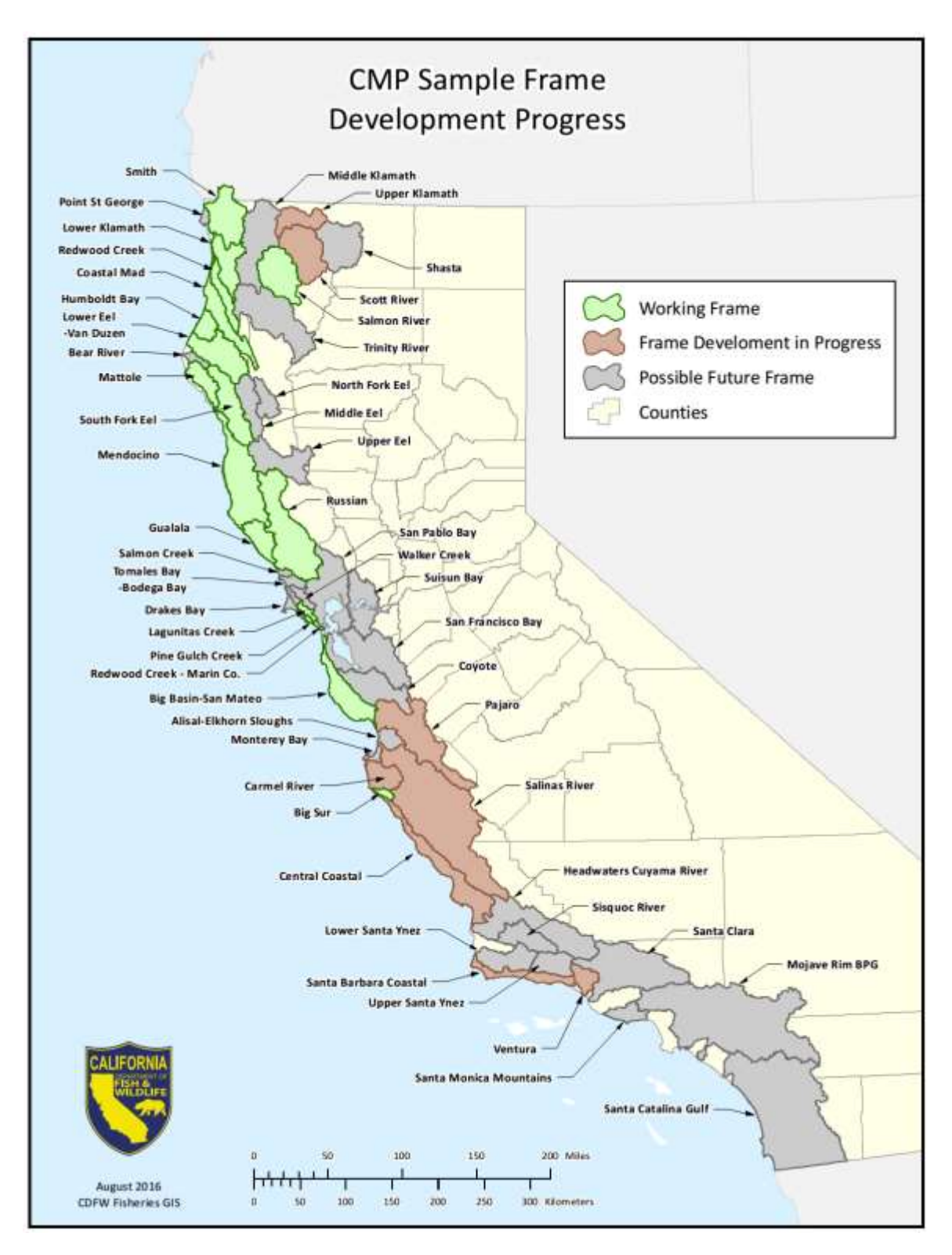
FIGURE 3 . California Coastal Salmonid Monitoring Plan watersheds showing the status of sampling frame development.