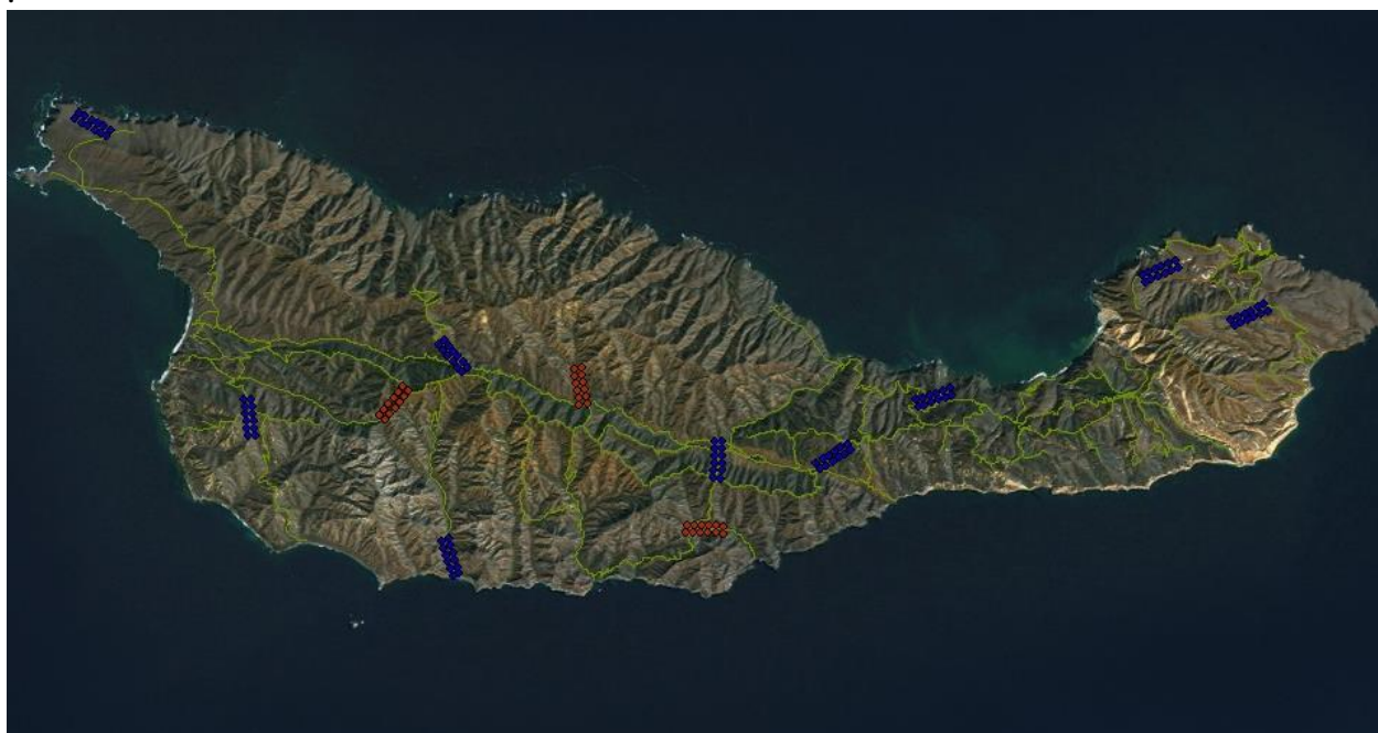
Figure 2. A map of the twelve trapping grids run in 2015-2016 on Santa Cruz Island, CA.