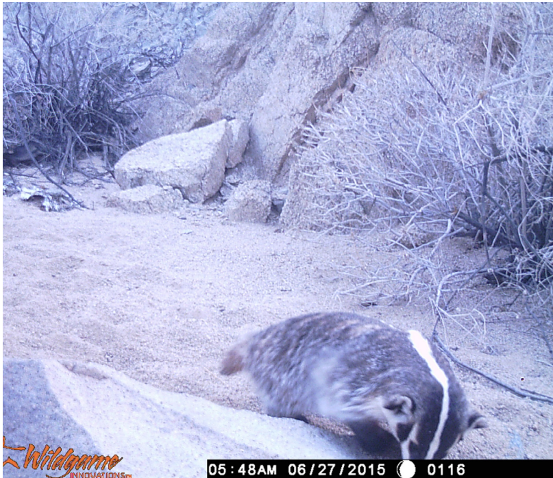
FIGURE 2.—An American badger ( Taxidea taxus ) photographed by a trail camera on 27 June 2015 in southern Joshua Tree National Park near the site where the tortoise carcass displayed in Figure 1 was discovered.

In an effort to determine if a badger was the potential predator of the tortoise in our study, two trail cameras were placed in pinch points of the wash on 29 April 2015, just above the dead tortoise's burrow at first capture. After two months with no carnivore activity captured on camera, the camera angles were adjusted on 15 June 2015 to provide a wider view of the ground. On 27 June 2015, 75 days after the tortoise carcass was found, a badger was photographed by the trail camera (Figure 2). It was walking down the wash,