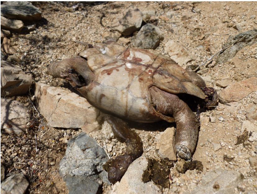
FIGURE 1.—Adult male Gopherus agassizii as found dead in southern Joshua Tree National Park on 13 April 2015. The tortoise was eviscerated through the left rear limb pocket and the neck was nearly severed, implicating the American badger ( Taxidea taxus ) as the predator. Intestines can be seen in the foreground.