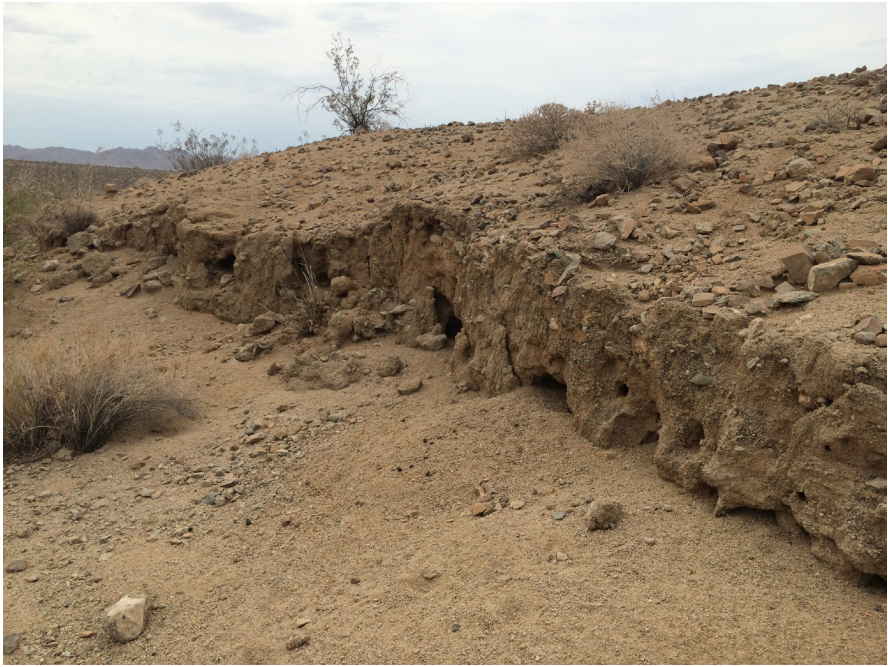
FIGURE 4.—Cut bank in the wash adjacent to where the desert tortoise carcass shown in Figure 1 was discovered. Note extensive excavations under the caliche layer of the soil horizon attributed largely to a badger digging to excavate rodent prey. When first captured alive, the male desert tortoise was using one of the burrows (not shown) in the same bank, and he may have enlarged some of the holes started by the badger. Overburden above excavations ranges from 0.5 - 1.0 m in thickness.