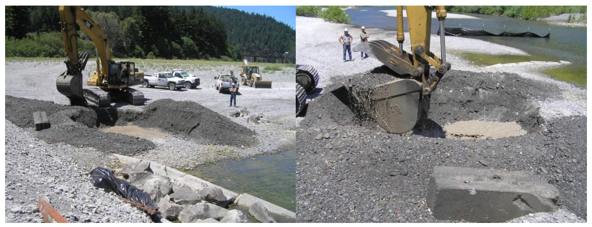
Off-channel water hole by Humboldt Redwood Company, near Dyerville Bar on the Eel River, Humboldt County