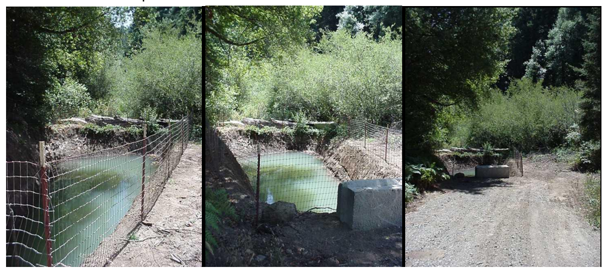
Sump by Mendocino Redwood Company near South Fork Albion River, August 2003