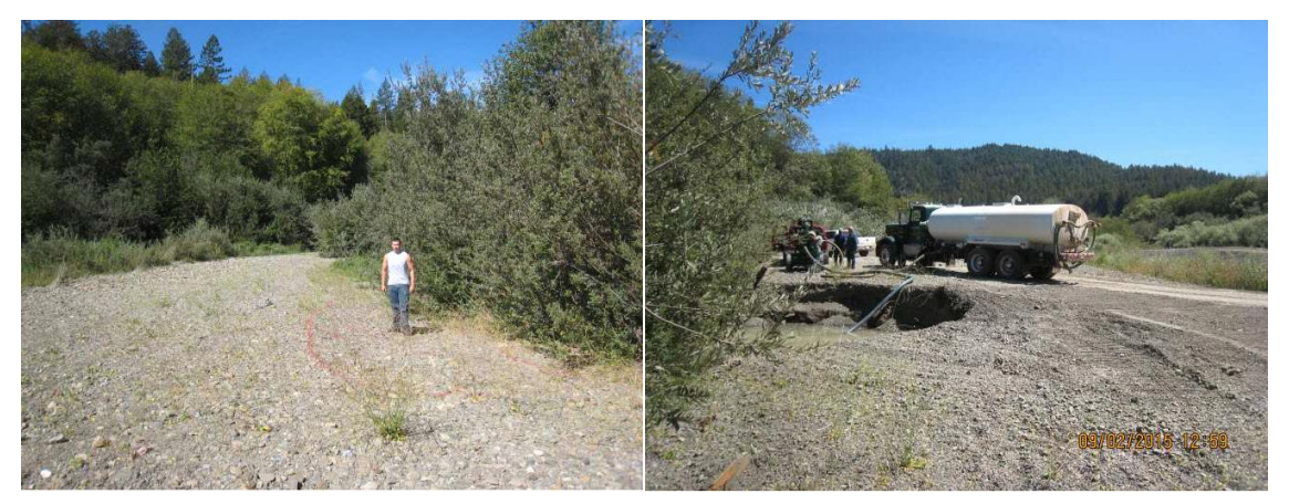
Off-channel water hole by Gualala Redwood Timber on the South Fork Gualala River, September 2015