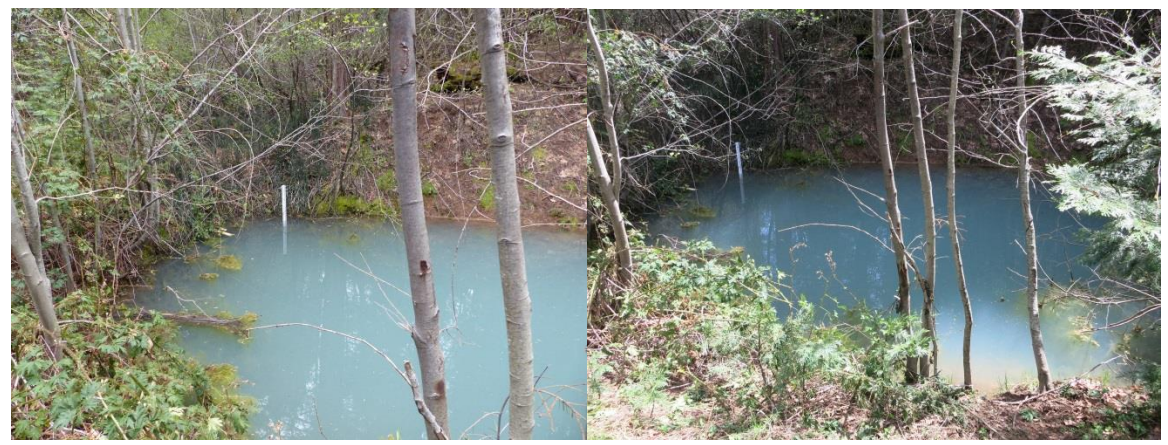
Off-channel waterhole on Esmeralda Creek near Fresh Pond, CA on Sierra Pacific Industries, April 26, 2016

40. Is reducing the pump rate enough with drought conditions?