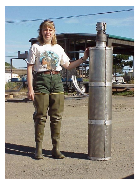
This screen meets the CDFW specifications for Class I diversions

39. Give examples of off-channel drafting sites other than above ground tanks, e.g., lined ponds.