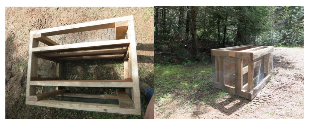
This screen is suitable for Class II watercourses and was brought for demonstration purposes by Sierra Pacific Industries to the Rancho Cordova Water Drafting Workshop, April 2016