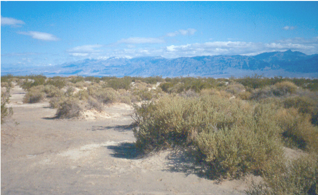
Figure A9. Atriplex canescens Shrubland Alliance, Stovepipe Wells

Atriplex canescens is the sole or dominant shrub in canopy. Ambrosia dumosa , Atriplex confertifolia , Atriplex polycarpa , Chrysothamnus viscidiflorus , Ephedra viridis , Grayia spinosa , Hymenoclea salsola , Isomeris acradenia , Larrea tridentata , or Suaeda moquinii , may be present. Emergent Prosopis glandulosa may be present. Shrubs < 3 m tall, canopy open or intermittent. Trees < 5 m tall, scattered distribution. Ground layer variable, seasonally present including annual herbs and non-native grasses.