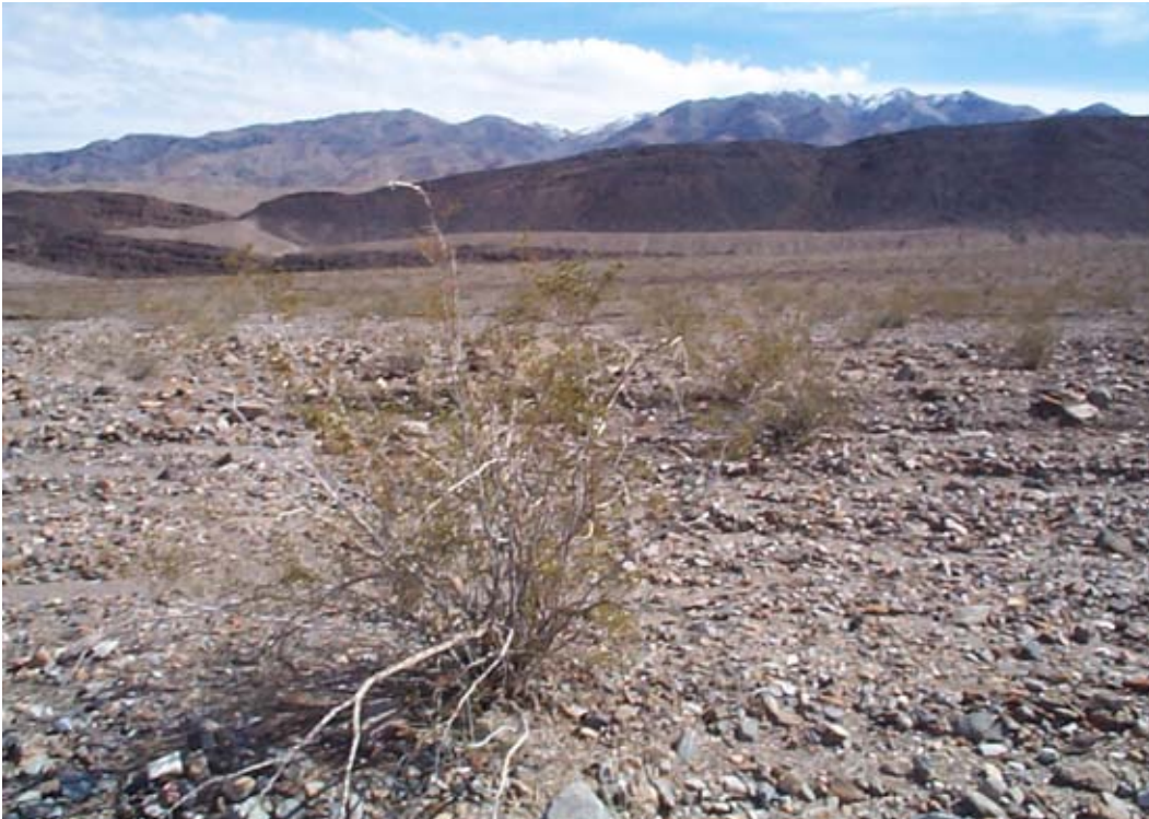
Figure A28. Larrea tridentata Shrubland Alliance, Stovepipe Wells

Larrea tridentata is the sole or important shrub in canopy. Acamptopappus spherocephalus , Acamptopappus shockleyi , Atriplex confertifolia , Atriplex hymenelytra , Atriplex polycarpa , Brickellia incana , Ephedra californica , Ephedra nevadensis , Hymenoclea salsola , or Lycium andersonii may be present. Shrubs < 4 m tall; canopy open. Emergent Yucca brevifolia or Prosopis glandulosa may be present. Achnatherum speciosum , Eriogonum inflatum , Eriophyllum confertiflorum , Poa secunda , or Pleuraphis rigida may be present. Ground layer open; annuals seasonally present.