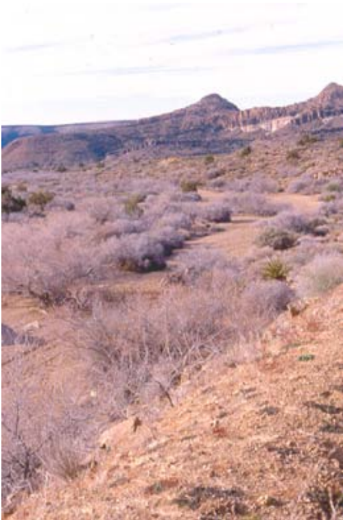
Figure A42. Prunus fasciculata Intermittently Flooded Shrubland Alliance, Black Canyon (with scattered Chilopsis linearis , both plants dormant)

Prunus fasciculata is the sole or dominant shrub in canopy. Achnatherum speciosum , Atriplex confertifolia , Ephedra nevadensis , Eriogonum fasciculatum , Grayia spinosa , Hymenoclea salsola , Krascheninnikovia lanata , Larrea tridentata , Lycium andersonii , Salvia dorrii , Thamnosma montana or Viguiera reticulata may be present. Emergent Acacia greggii , Juniperus osteosperma , J. californica , Pinus monophylla or Yucca brevifolia may be present. Shrubs < 3 m tall; canopy continuous, intermittent, or open. Ground layer sparse.