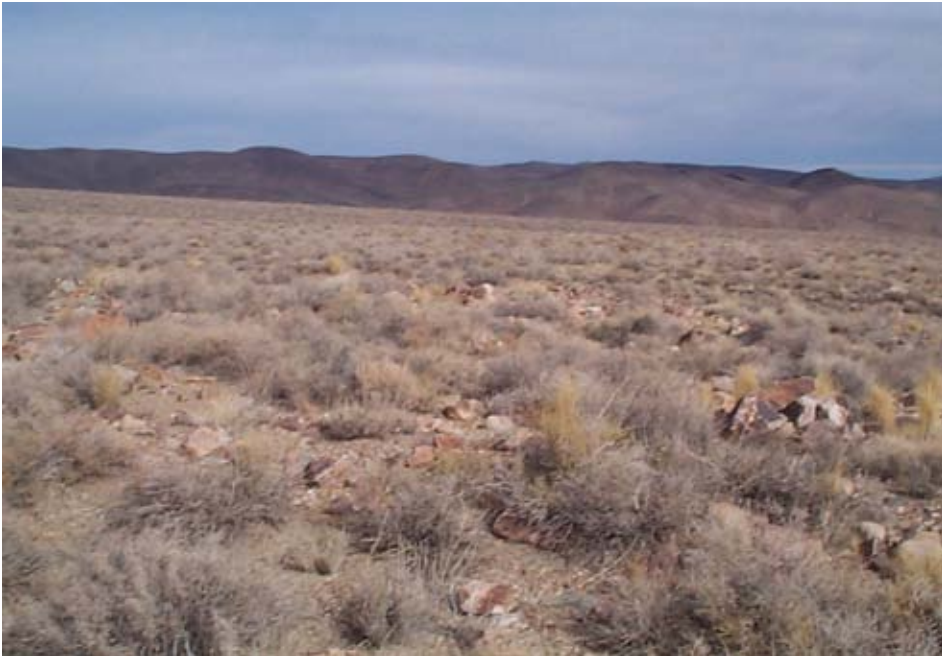
Figure A21. Grayia spinosa Shrubland Alliance, Inyo Mountains

Grayia spinosa is the dominant or important shrub in canopy. Acamptopappus sphercephalus , Achnatherum speciosum , Ambrosia dumosa , Artemisia spinescens , Atriplex confertifolia , Chrysothamnus viscidiflorus , Larrea tridentata , Krascheninnikovia lanata , Lycium andersonii , or Tetradymia spp. may be present. Emergent Yucca brevifolia may be present. Shrubs < 1 m tall; canopy continuous, intermittent, or open. Bromus tectorum , Eriogonum ovalifolium , or Poa secunda may be present. Ground layer sparse to intermittent.