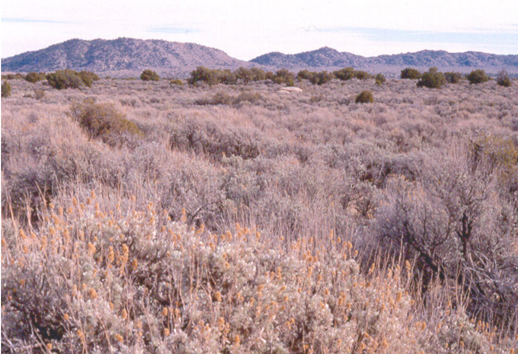
Figure A6. Artemisia tridentata Shrubland Alliance, Mid Hills

Artemisia tridentata is the sole or dominant shrub in canopy. Ericameria nauseosa , Chrysothamnus viscidiflorus , Ephedra viridis , Purshia tridentata , Ribes velutinum , or Tetradymia canescens may be present. Emergent trees may be present. Shrubs < 3 m tall; cover continuous, intermittent, or open. Ground layer sparse or grassy.