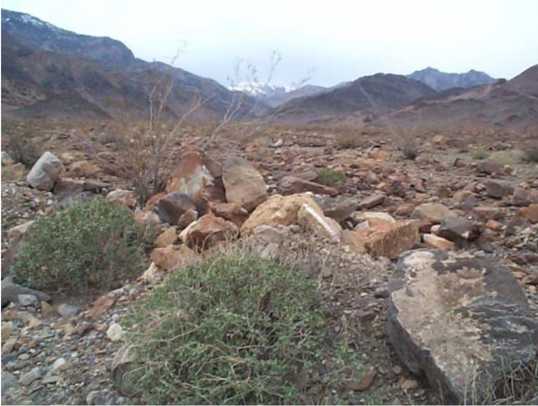
Figure A27. Larrea tridentata - Encelia farinosa Shrubland Alliance, Panamint Mountains

Larrea tridentata and Encelia farinosa are the important or conspicuous shrubs in canopy. Agave deserti , Ambrosia dumosa , Atriplex hymenelytra , Bebbia juncea , Eriogonum inflatum , Dasyochloa pulchella , Fagonia laevis , Ferocactus cylindraceus , Krameria grayi , Opuntia bigelovii , O. basilaris , or Stephanomeria pauciflora may be present. Emergent Fouquieria splendens may be present in the Sonoran Desert. Shrubs < 3 m tall; open to intermittent, two-tiered canopy. Trees < 5 m tall; scattered canopy. Ground layer open; annuals seasonally present.