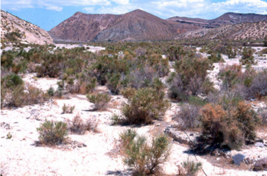
Figure A29. Lepidospartum squamatum Intermittently Flooded Shrubland Alliance

Lepidospartum squamatum is the sole, dominant, or important shrub with other shrubs in the canopy. Artemisia californica , Baccharis salicifolia , Encelia farinosa , Eriogonum fasciculatum , Eriodictyon crassifolium , Hymenoclea Salsola , Eriastrum densifolium ssp. sanctorum , Dodecahema leptoceras , Isomeris arborea , Juniperus californica , Lotus scoparius , Opuntia littoralis , O. parryi , Malosma laurina , Rhus integrifolia , Rhus trilobata , R. ovata , Sambucus mexicana , Toxicodendron diversilobum or Yucca whipplei may be present. Emergent trees such as Cercocarpus betuloides , Juglans californica , Platanus racemosa , or Populus fremontii may be present. Shrubs < 1.5 m tall; canopy continuous, intermittent, or open. Ground layer variable, may be grassy.