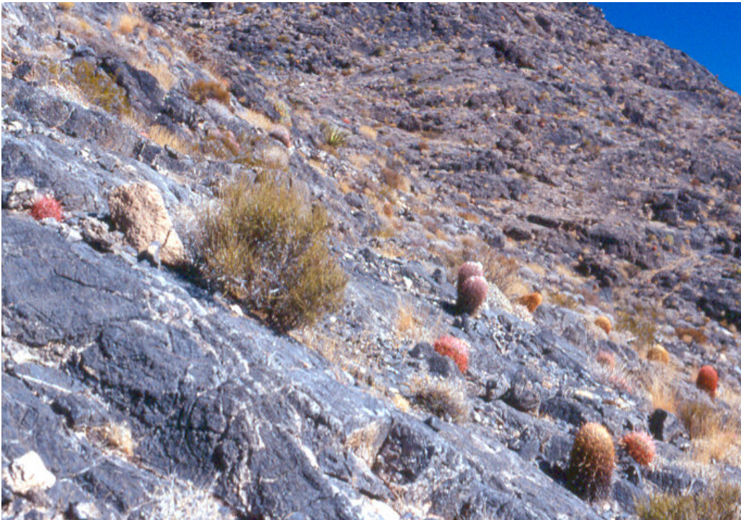
Figure A16. Ephedra funerea Sparse Vegetation Alliance

Ephedra funerea is the dominant or important shrub in the canopy. Amphipappus fremontii , Achnatherum speciosum , Encelia farinosa , Encelia virginensis , Ferocactus cylindraceus , Echinocactus polycephalus , Eucnide urens , Gutierrezia microcephala , Larrea tridentata , Salazaria mexicana , or Yucca schidigera may be present. Shrubs < 1 m tall; canopy open. Ground layer sparse.