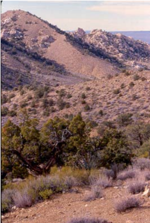
Figure A34. Pinus monophylla Sparsely Wooded Shrubland, Mid Hills, San Bernardino County.

Pinus monophylla is present as an emergent tree over a shrub canopy. Juniperus osteosperma , Juniperus californica , J. occidentalis ssp. australis , Quercus cornelius-mulleri , or Quercus john tuckeri may be present as emergent trees or large shrubs over a shorter shrub canopy. Artemisia tridentata , Artemisia nova , Artemisia arbuscula , Chrysothamnus viscidiflorus , Chrysothamnus nauseosus , Ephedra viridis , Eriogonum fasciculatum , Eriogonum umbellatum , Grayia spinosa , Opuntia erinacea , Purshia tridentata , Purshia stansburiana , or Yucca baccata may be present. Trees < 15 m tall; canopy intermittent to open. Shrubs common. Ground layer absent, sparse, or grassy.