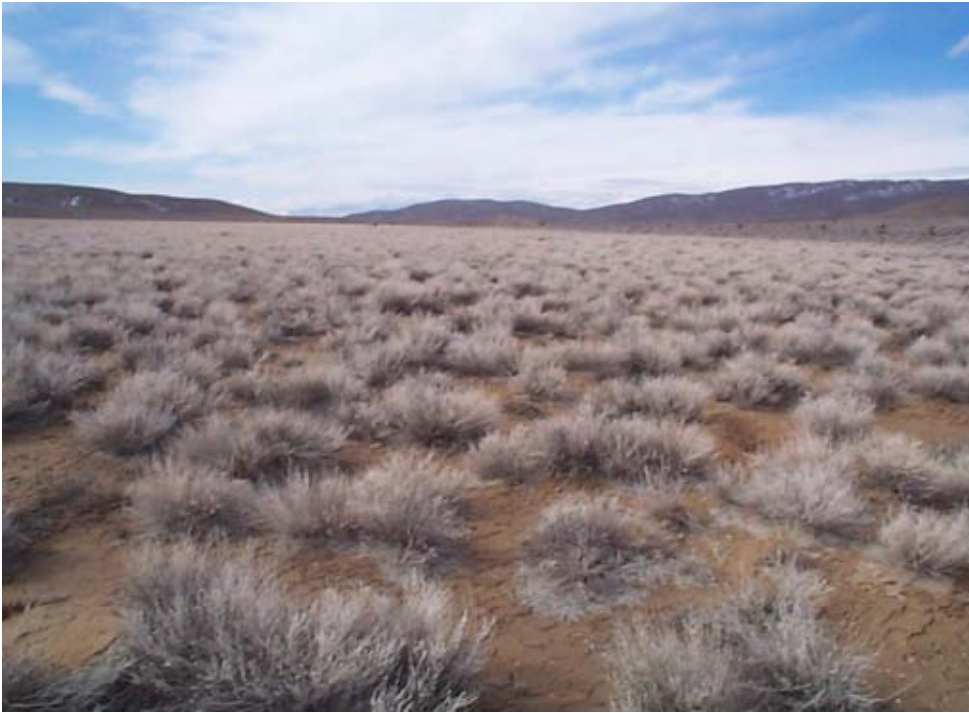
Figure A25. Krascheninnikovia lanata Dwarf-Shrubland Alliance, Panamint Mountains

Krascheninnikovia lanata is the sole or dominant shrub in canopy. Artemisia nova , Coleogyne ramosissima , Atriplex confertifolia , or Chrysothamnus viscidiflorus may be present. Shrubs < 1 m tall; canopy continuous, intermittent, or open. Ground layer sparse, grassy.