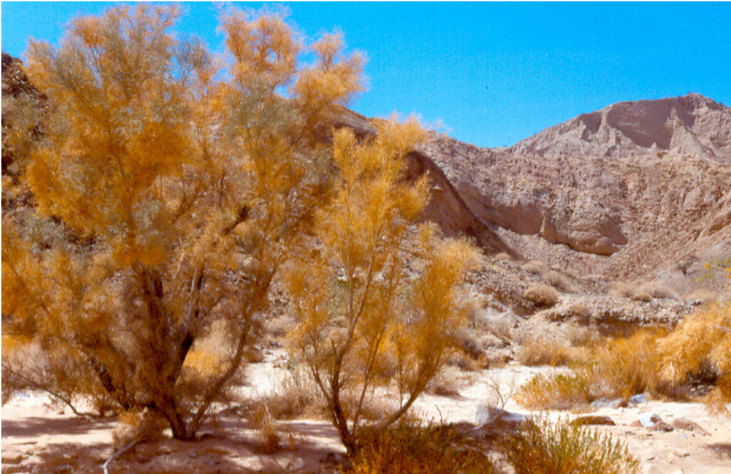
Figure A43. Psorothamnus spinosus Intermittently Flooded Shrubland Alliance

Psorothamnus spinosus is the sole, dominant, or important tall shrub or small tree in canopy. Parkinsonia florida , Acacia greggii , Chilopsis linearis , or Olneya tesota may be present. Emergent trees may be present over a shrub canopy. Hymenoclea salsola , Bebbia juncea , Hyptis emoryi , Larrea tridentata , Ambrosia dumosa , Encelia farinosa , Baccharis emoryi , Petalonyx thurberi , or Stephanomeria pauciflora may form sparse to intermittent shrub layer. Shrubs < 3 m tall; intermittent or open canopy. Ground layer sparse; annual herbs or grasses seasonally present.