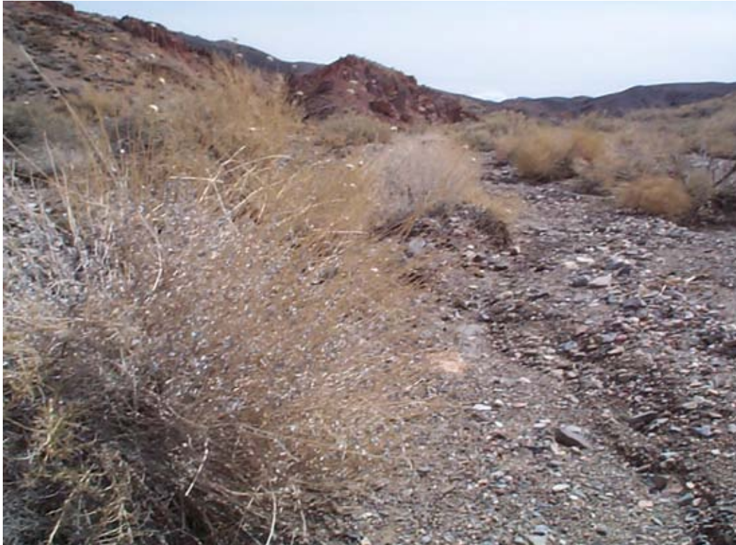
Figure A55. Viguiera reticulata Intermittently Flooded Shrubland Alliance

Viguiera reticulata is dominant or important in canopy. Ambrosia dumosa , Atriplex confertifolia , Encelia virginensis , Eriogonum fasciculatum , Gutierrezia microcephala , Hymenoclea salsola , Psoralea arborescens , Salvia dorrii , Salazaria mexicana , Senecio flaccidus , or Stephanomeria pauciflora may be present. Canopy intermittent to open; short shrubs < 2 m tall. Sparse ground layer.