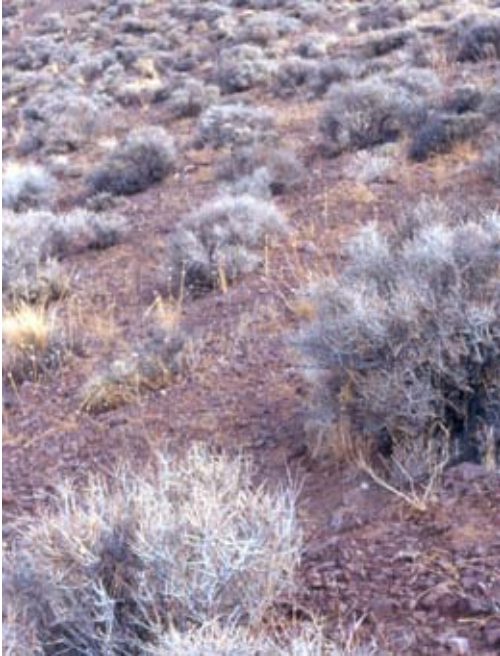
Figure A17. Ephedra nevadensis Shrubland Alliance

Ephedra nevadensis is the sole, dominant or important shrub in canopy. Artemisia tridentata , Atriplex confertifolia , Coleogyne ramosissima , Ericameria cooperi , Eriogonum fasciculatum , Grayia spinosa , Lycium andersonii , Menodora spinescens , Salazaria mexicana or Yucca schidigera may be present. Shrubs < 2 m; open to intermittent cover. Ground layer open may include the bunchgrass Achnatherum speciosum , Oryzopsis hymenoides , Elymus elymoides , Poa secunda or Pleuraphis jamesii . Annuals seasonally present. Emergent Yucca brevifolia may be present.