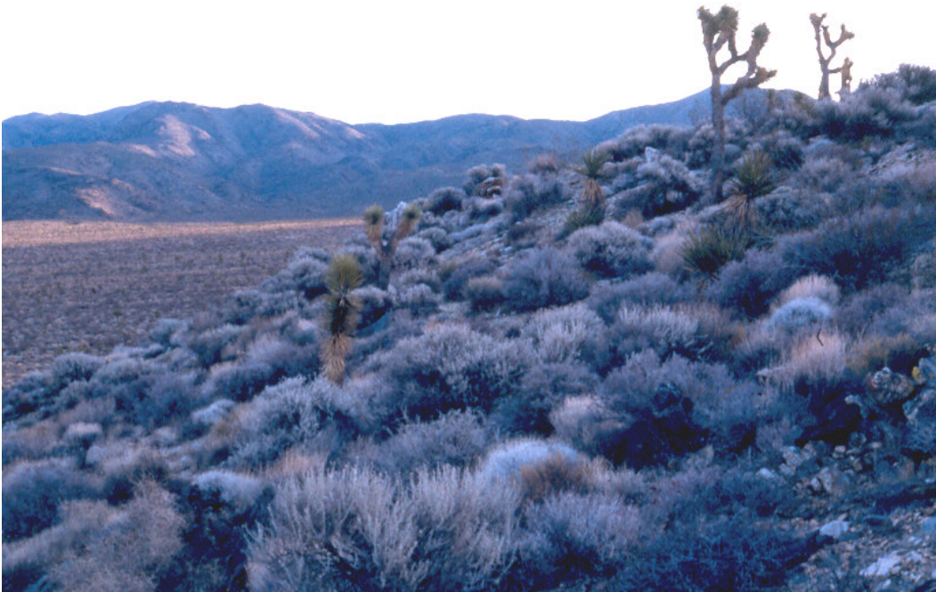
Figure A54. Viguiera parishii Shrubland Alliance, Joshua Tree National Park

Viguiera parishii is the dominant or important shrub in the canopy. Agave deserti , Bebbia juncea , Ericameria teretifolia , Ephedra nevadensis , Eriogonum fasciculatum , Encelia farinosa , Ferocactus cylindraceus , Galium stellatum , Gutierrezia microcephala , Krameria grayi , Opuntia acanthocarpa , Pleuraphis rigida , Salazaria mexicana , Salvia dorrii , Simmondsia chinensis , or Yucca schidigera may be present. Shrubs < 2 m tall; canopy intermittent or open. Emergent tall shrubs or trees < 5 m tall such as Acacia greggii , Fouquieria splendens , or Juniperus californica may be present. Ground cover is open to intermittent. Achnatherum speciosum , Adenophyllum porophylloides , Bromus madritensis , Echinocereus engelmannii , Mirabilis bigelovii , or Opuntia basilaris may be present. Annuals seasonally present.