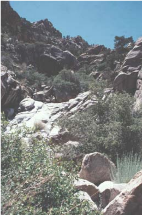
Figure A46. Quercus turbinella Shrubland Alliance

Quercus turbinella is the sole or important shrub or small tree in canopy. Pinus monophylla may be an emergent or small tree with near equal cover. Fallugia paradoxa , Eriogonum wrightii , Galium munzii , Rhus trilobata , Artemisia ludoviciana , Gutierrezia sarothrae , Elymus elymoides , or Yucca baccata may be present. Shrubs or small trees < 6 m tall; canopy intermittent to dense. Ground layer is open and includes native grasses such as Poa fendleriana , Agrostis viridis , and Elymus elymoides .