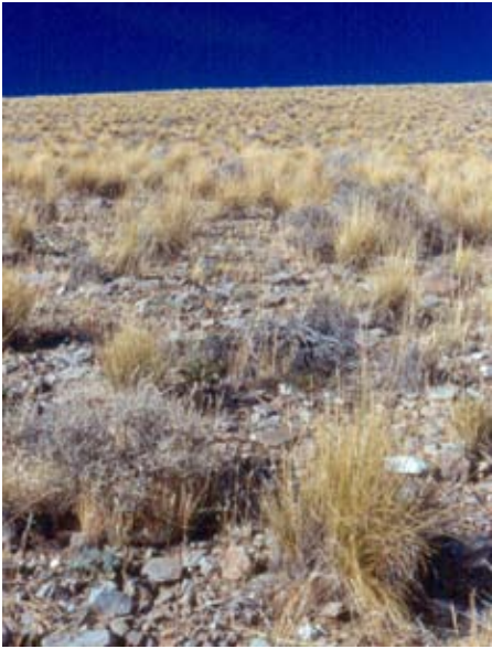
Figure A2. Achnatherum speciosum Herbaceous Alliance, Aguerreberry Point, Panamint Mountains

Achnatherum speciosum is the sole, dominant, or important grass in ground layer. Achnatherum hymenoides , Elymus elymoides , Nassella cernua , and/or Poa secunda may be present. Emergent shrubs such as Coleogyne ramosissima , Ericameria cooperi , Grayia spinosa , Hymenoclea salsola , and Krascheninnikovia lanata may be present. Emergent Yucca brevifolia may be present (< 1% cover). Grass < 1 m; cover open to intermittent. Annual herbs may be seasonally present.