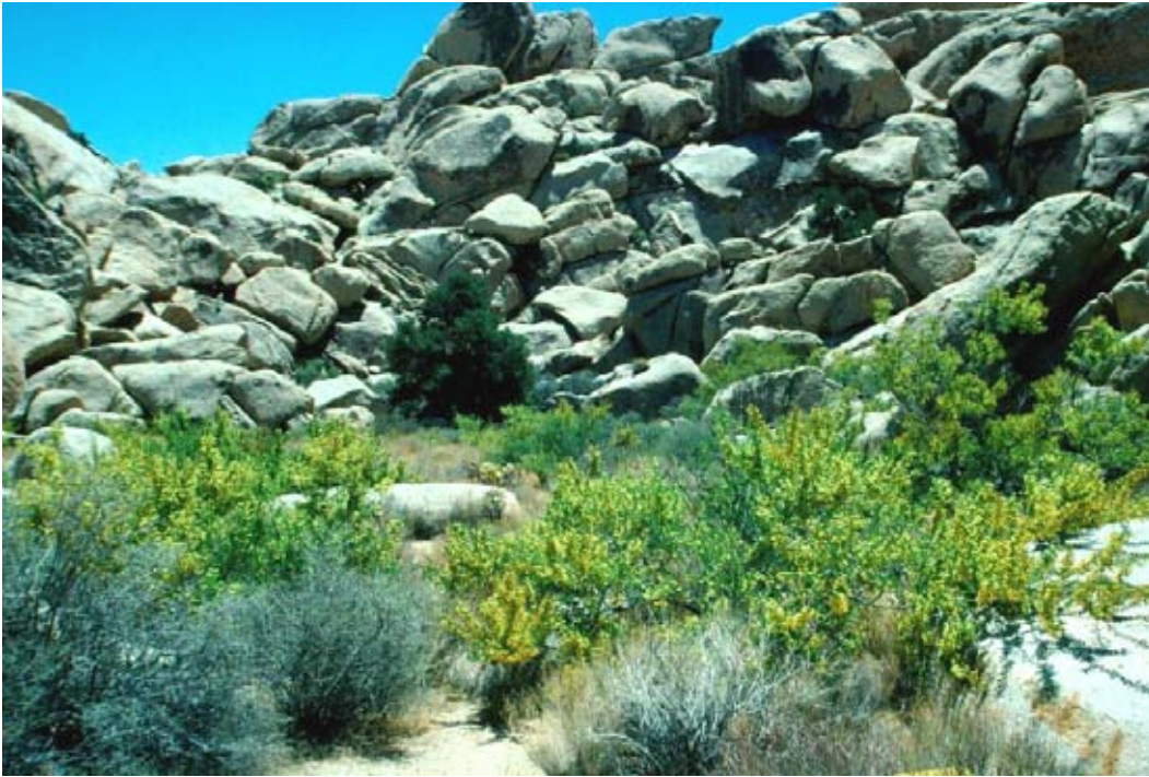
Figure A1. Acacia greggii Shrubland Alliance, Granite Cove, Granite Mountains

Acacia greggii is the sole, dominant, or important tall shrub or small tree in canopy. Chilopsis linearis , Parkinsonia florida , Juniperus californica , Juniperus osteosperma , Olneya tesota , or Psoralea argophylla may be present as emergent trees over the shrub canopy. Bebbia juncea , Ephedra californica , Encelia virginensis , Ericameria teretifolia , Eriogonum fasciculatum , Hymenoclea salsola , Hyptis emoryi , Larrea tridentata , Opuntia acanthocarpa , Phoradendron californicum , Prunus fasciculata , Rhus ovata , Salazaria mexicana , Senna armata , Viguiera parishii , or Yucca schidigera may be present. Trees < 5 m, scattered; shrubs < 3 m, intermittent or open. Ground layer sparse, annual herbs or grasses seasonally present.