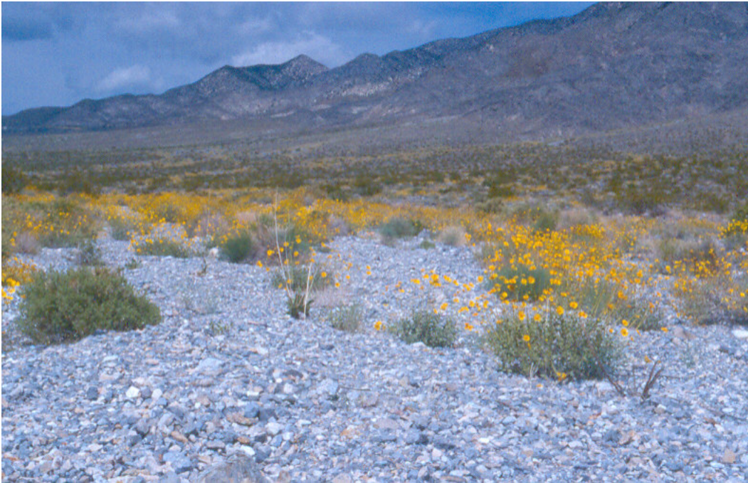
Figure A15. Encelia virginensis Shrubland Alliance, Last Chance Range

Encelia virginensis is the important or dominant canopy shrub. Ericameria nauseosa , Ephedra nevadensis , Gutierrezia microcephala , Hymenoclea salsola , Psoralea argophylla , Salvia dorrii , Salazaria mexicana , Stephanomeria pauciflora , Viguiera reticulata , Yucca baccata or Aristida purpurea may be present. Emergent Acacia greggii may occur. Canopy intermittent short shrubs < 2 m tall. Ground layer is intermittent.