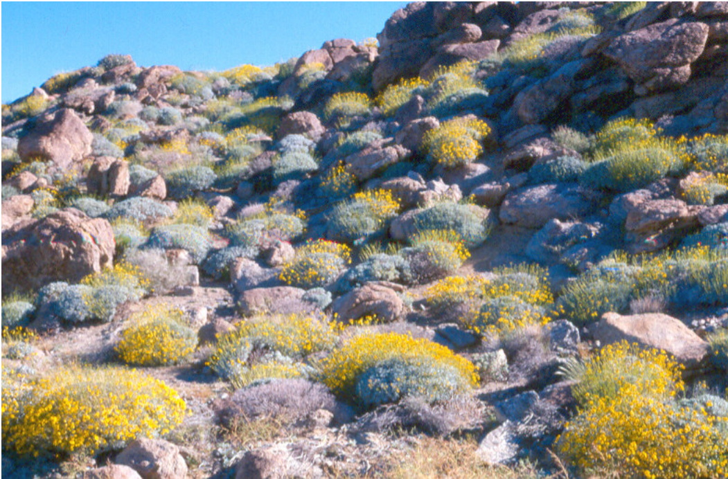
Figure A14. Encelia farinosa Shrubland Alliance

Encelia farinosa is the sole or dominant shrub in canopy. Ambrosia dumosa , Artemisia californica , Eriodictyon crassifolium , Eriogonum fasciculatum , Agave deserti , Ferocactus cylindraceus , Opuntia bigelovii , Echinocactus engelmannii , Salvia apiana , or Yucca whipplei may be present. Emergent Fouquieria splendens may be present. Shrubs <2 m tall; open to intermittent single-layered. Trees < 5 m tall scattered. Ground layer open; annuals seasonally present.