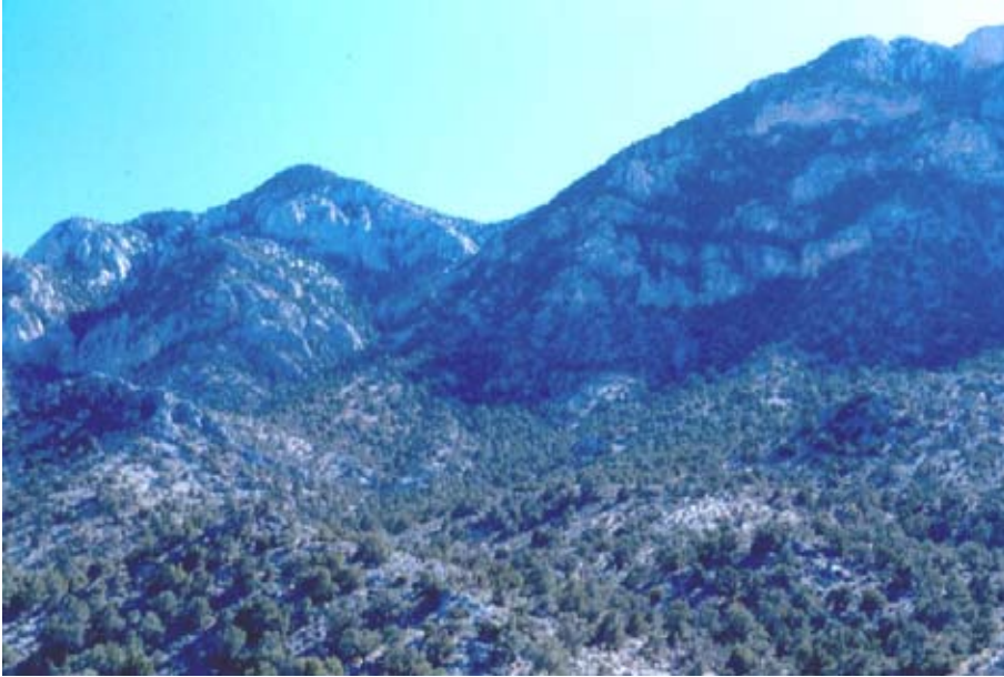
Figure A35. Pinus monophylla - ( Juniperus osteosperma ) Woodland Alliance, Clark Mountain ( Abies concolor Unique Stands along crest)

Pinus monophylla is the sole, dominant, or important tree in canopy. Juniperus osteosperma , Juniperus californica , J. occidentalis ssp. australis , Pinus jeffreyi , Quercus chrysolepis , Quercus cornelius-mulleri , or Quercus john-tuckeri may be present as emergent trees over a shrub canopy. Artemisia tridentata , Artemisia nova , Artemisia arbuscula , Chrysothamnus viscidiflorus , Chrysothamnus nauseosus , Ephedra viridis , Eriogonum fasciculatum , Eriogonum umbellatum , Grayia spinosa , Opuntia erinacea , Purshia tridentata , Purshia stansburiana , or Yucca baccata may be present. Trees < 15 m tall; canopy intermittent to open. Shrubs common. Ground layer absent, sparse, or grassy.