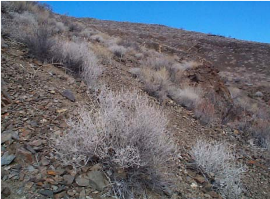
Figure A5. Ambrosia dumosa Dwarf-shrubland Alliance, Panamint Mountain

Ambrosia dumosa is the sole or dominant shrub in canopy. Acamptopappus spherocephalus , Atriplex canescens , Atriplex confertifolia , Atriplex hymenelytra , Echinocactus polycephalus , Ephedra funerea , Encelia farinosa , Larrea tridentata , Opuntia acanthocarpa , O. basilaris , O. bigelovii , O. ramosissima , or Pleuraphis rigida may be present. Shrubs in dominant layer < 1 m tall. Emergent Larrea tridentata and Fouquieria splendens may be present. Tall emergent shrubs < 3 m tall. Emergent trees < 5 m tall. Ground layer is open. Annuals seasonally present.