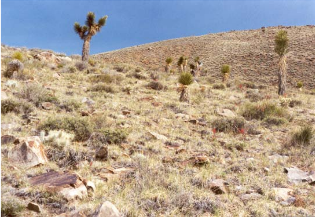
Figure A37. Pleuraphis jamesii Herbaceous Alliance, Inyo County

Pleuraphis jamesii is the sole or dominant grass in ground layer. Bouteloua gracilis , Elymus elymoides , Eriogonum wrightii , Muhlenbergia porteri , or Sphaeralcea ambigua may be present. Emergent shrubs such as Artemisia tridentata , Ephedra nevadensis , Ephedra viridis , Eriogonum fasciculatum , Gutierrezia microcephala , or Opuntia acanthocarpa may be present. Emergent Yucca brevifolia may be present. Grass < 1 m tall; cover is open to intermittent.