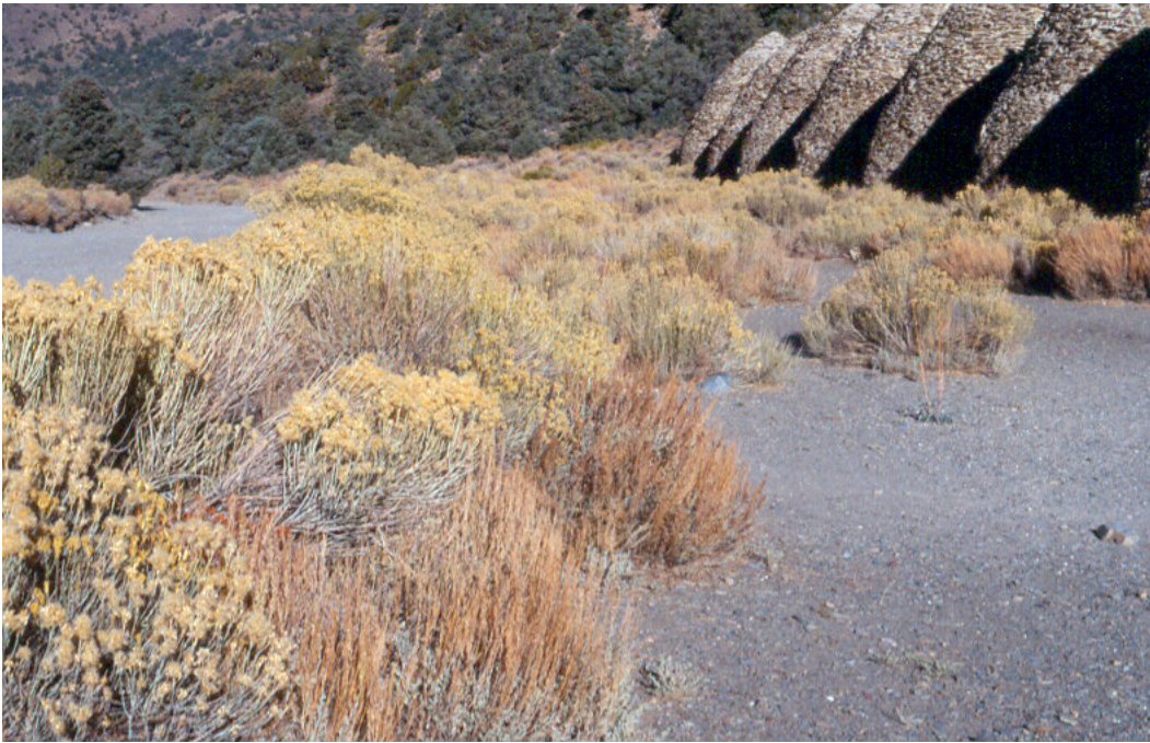
Figure A18. Ericameria nauseosa Shrubland Alliance, Wildrose Canyon

Ericameria nauseosa is the sole or dominant shrub in canopy. Artemisia tridentata , Chrysothamnus viscidiflorus , Ephedra species or Purshia tridentata may be present. Emergent junipers or pines may be present, or emergent shrubs may occur over a ground layer of grass. Trees scattered, if present. Shrubs < 3 m tall; canopy continuous, intermittent, or open. Ground layer sparse or grassy.