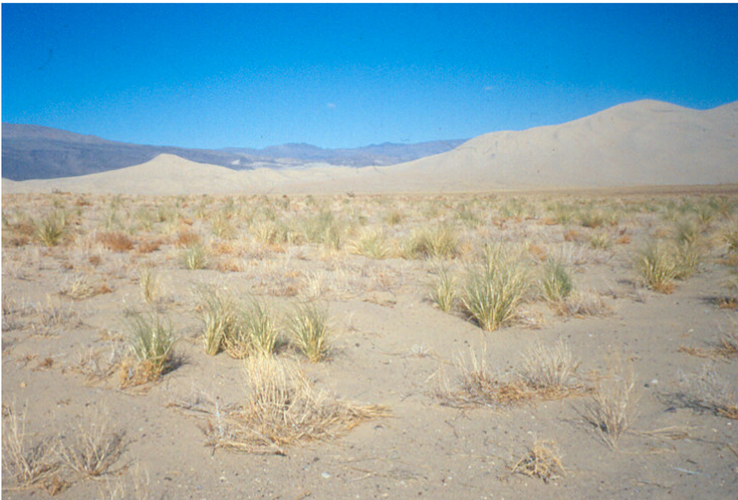
Figure A3. Achnatherum hymenoides Herbaceous Alliance, Eureka Dunes

Achnatherum hymenoides (aka Oryzopsis hymenoides ) is the sole or dominant grass in ground layer. Bromus tectorum , Elymus elymoides , Pascopyrum smithii , Koeleria