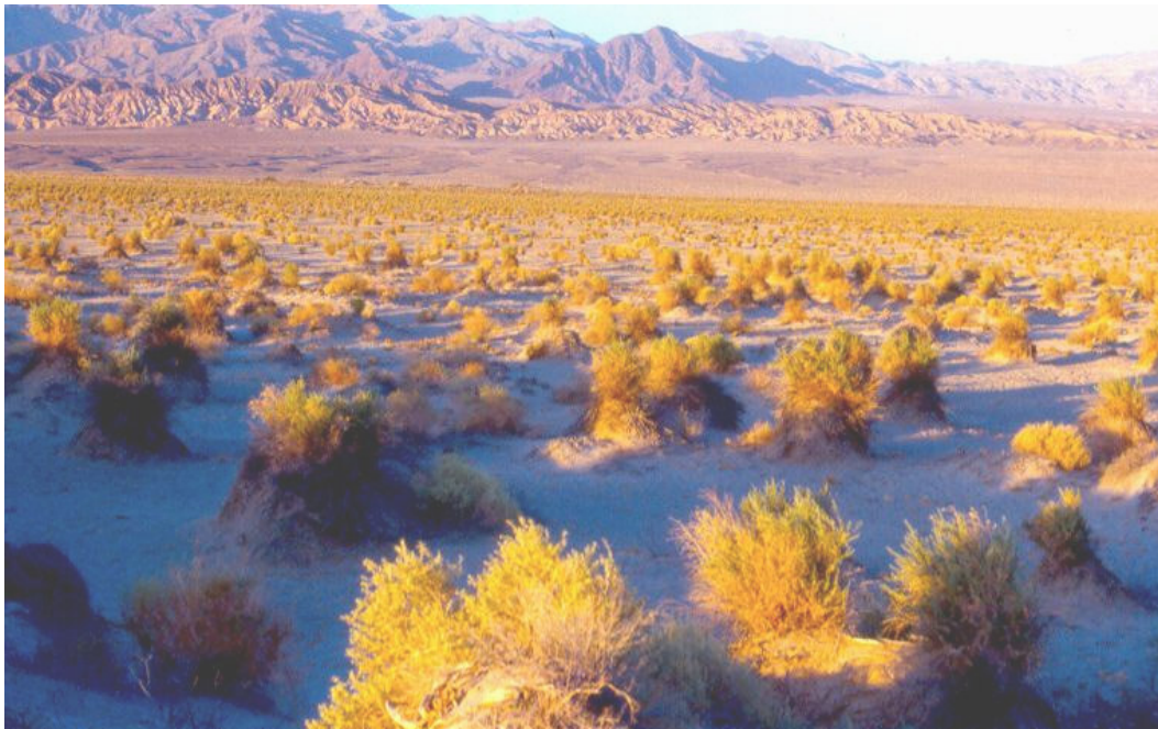
Figure A38. Pluchea sericea Seasonally Flooded Shrubland Alliance, Devils Cornfield, Death Valley National Park

Pluchea sericea is the sole or dominant shrub in canopy. Allenrolfea occidentalis , Atriplex torreyi , Atriplex canescens , Baccharis sergiloides , Baccharis emoryi , Distichlis spicata , Salix exigua , Suaeda moquinii , Schoenoplectus americanus , Tamarix spp., or