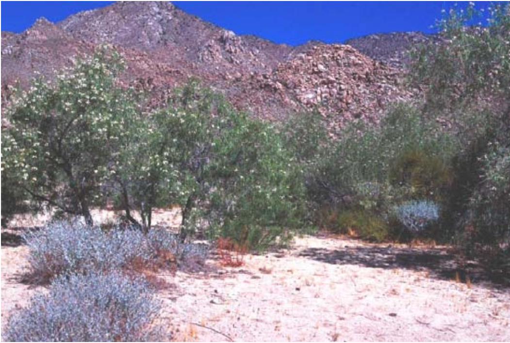
Figure A12. Chilopsis linearis Intermittently Flooded Shrubland Alliance

Chilopsis linearis is the sole, dominant, or important tall shrub or small tree in canopy; Acacia greggii , Olneya tesota , Prosopis glandulosa , Psoralea argophylla , or Yucca brevifolia may be present. Emergent trees may be present over a shrub canopy. Atriplex polycarpa , Bebbia juncea , Ephedra californica , Encelia virginensis , Ericameria paniculata , Eriogonum fasciculatum , Hymenoclea salsola , Hyptis emoryi , Larrea tridentata , Lepidospartum squamatum , Opuntia acanthocarpa , Petalonyx thurberi , Prunus fasciculata , Senecio flaccidus , Viguiera parishii , or Yucca schidigera , may be present. Trees < 6 m tall; canopy intermittent or open. Shrubs < 3 m tall; intermittent or open. Ground layer sparse, annual herbs or grasses seasonally present.