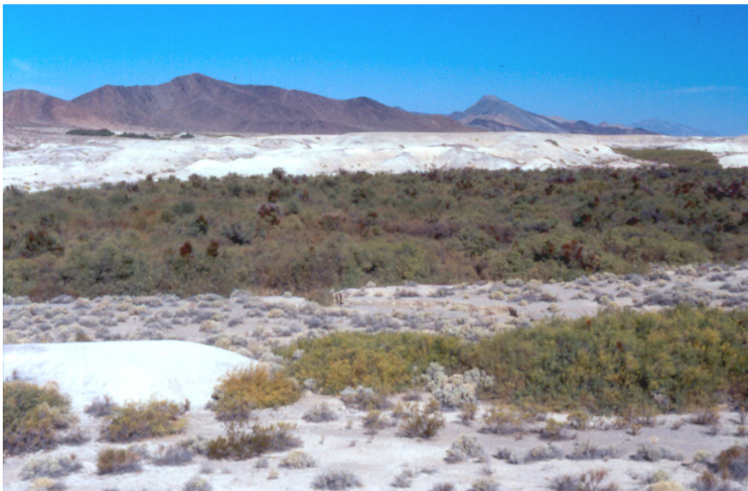
Figure A40. Prosopis glandulosa Shrubland Alliance, East of Tecopa

Prosopis glandulosa is the sole canopy shrub or small tree. Trees or shrubs < 10 m tall; canopy continuous or open. Atriplex canescens , Atriplex polycarpa , Allenrolfea occidentalis , Isocoma acradenia , Rhus ovata , Salix exigua , or Suaeda moquinii may be present.