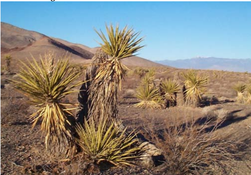
Figure A57. Yucca schidigera Shrubland Alliance, southern Nopah Range