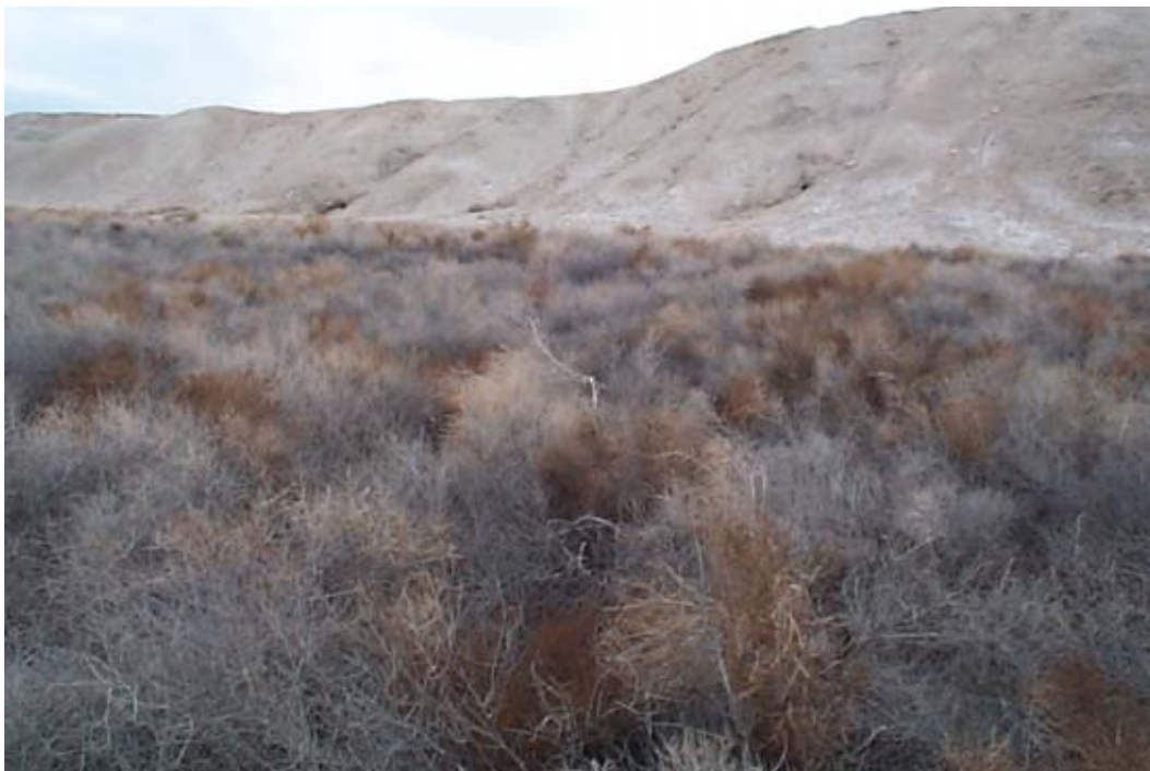
Figure A52. Suaeda moquinii Intermittently Flooded Shrubland Alliance, near Tecopa

Suaeda moquinii is the sole, dominant, or the most important shrub in overstory. Frankenia salina , Allenrolfea occidentalis , Atriplex polycarpa , Atriplex canescens , Sarcobatus vermiculatus , Kochia californica , or Sporobolus airoides may be present. Shrubs < 1.5 m tall; canopy open to closed.