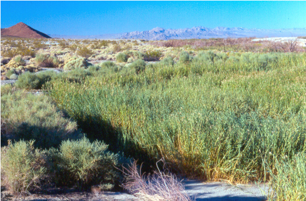
Figure A33. Phragmites australis Semipermanently Flooded Herbaceous Alliance, Salt Creek

Phragmites australis is the sole dominant species in herbaceous layer. Anemopsis californica , Juncus balticus , J. mexicanus , J. cooperi , Schoenoplectus americanus , Schoenoplectus acutus , or Schoenoplectus californica may be present. Emergent Salix species and Populus fremontii may be present. Grass < 4 m tall; cover continuous.