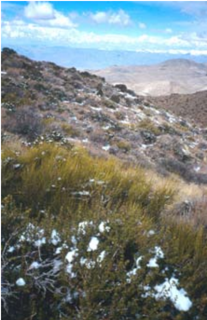
Figure A45. Purshia tridentata Shrubland Alliance

Purshia tridentata is the sole, dominant, or important shrub with Artemisia tridentata or Ericameria nauseosa in canopy. Cercocarpus ledifolius , Chrysothamnus viscidiflorus , Ephedra viridis , Prunus andersonii and/or Tetradymia canescens may be present. Emergent junipers, pines, or Yucca brevifolia may be present. Shrubs < 5 m tall; cover continuous, intermittent or open. Ground layer sparse or grassy.