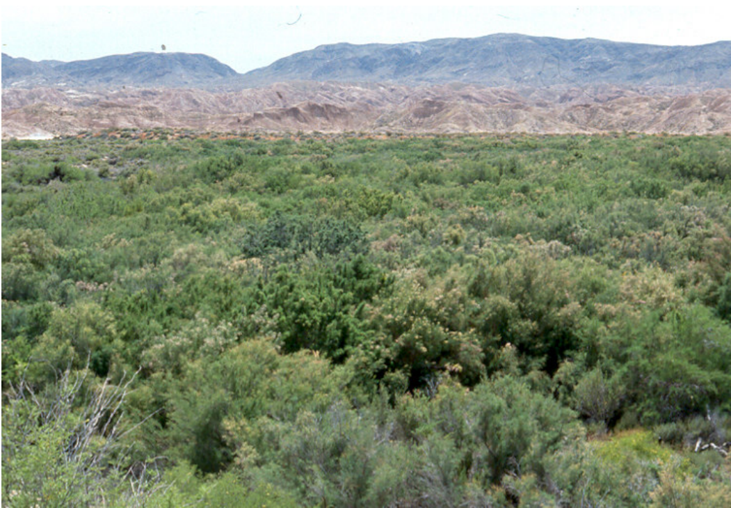
Figure A53. Tamarix spp. Semi-natural Temporarily Flooded Shrubland Alliance, Carrizo Marsh

Tamarix species is sole or dominant shrub. Acacia greggii , Atriplex species, Hymenoclea salsola , Populus fremontii , or Salix species may be present. Shrubs < 5 m tall. Shrub canopy is continuous or open. Emergent trees may be present. Ground layer is sparse.