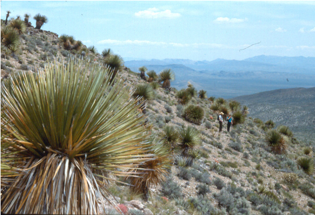
Figure A31. Nolina parryi Shrubland Alliance, Kingston Mountains

Nolina parryi is the dominant or important shrub in overstory. Pinus monophylla or Juniperus californica may be present in tree layer. Emergent trees may be present over a shrub canopy. Artemisia ludoviciana , Coleogyne ramosissima , Eriogonum fasciculatum , Eriogonum heermannii , Ericameria teretifolia , Gutierrezia microcephala , Opuntia acanthocarpa , Salazaria mexicana , Salvia mohavensis , Thamnosma montana , or Yucca schidigera may be present in the overstory. Achnatherum speciosum and Poa secunda may form a scattered grass understory. Shrubs 0.5-4 m tall; canopy is intermittent to open. Grasses 0.5-1 m tall; canopy is intermittent to open.