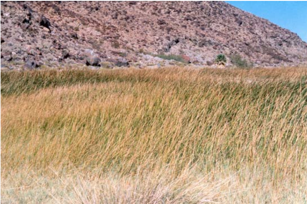
Figure A50. Schoenoplectus americanus Semipermanently Flooded Herbaceous Alliance, Soda Lake

Schoenoplectus americanus is the sole, dominant, or important tall graminoid. Anemopsis californica , Potentilla anserina , Distichlis spicata , Juncus cooperi , Juncus balticus , Schoenoplectus californicus , Typha spp., or Phragmites australis may be present. Grass < 4 m tall; cover continuous. Dense to intermittent understory of short grasses and herbs may be present.