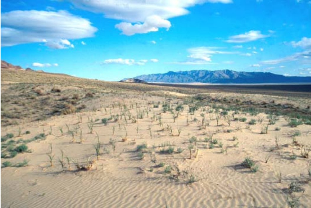
Figure A32. Panicum urvilleanum Sparsely Vegetated Herbaceous Alliance, Kelso Dunes

Panicum urvilleanum is the sole dominant or important grass in the canopy. Helianthus annuus , Oenothera deltoides , Dicoria canescens , or Achnatherum hymenoides may be present.