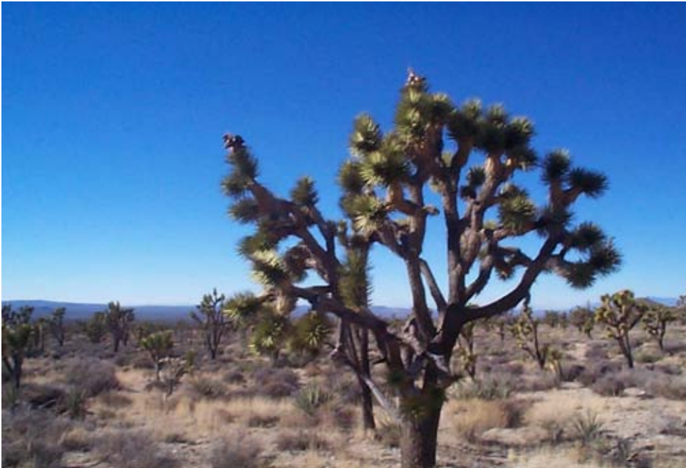
Figure A56. Yucca brevifolia Wooded Shrubland Alliance, Cima Dome

Yucca brevifolia is the emergent small tree (< 14 m tall) and abundant over a shrub canopy. Artemisia tridentata , Chrysothamnus viscidiflorus , Coleogyne ramosissima , Ephedra nevadensis , Eriogonum fasciculatum , Gutierrezia microcephala , Hymenoclea salsola , Krascheninnikovia lanata , Larrea tridentata , Lycium andersonii , Opuntia acanthocarpa , Tetradymia axillaris , Yucca schidigera , or Yucca baccata may be present. Shrubs < 3 m tall; canopy intermittent or open. Emergent Pinus monophylla , Juniperus californica , or Juniperus osteosperma may be also present. Ground layer may include several cacti and perennial grasses including Pleuraphis rigida , Pleuraphis jamesii , Achnatherum speciosum , or Poa secunda . Annuals seasonally present.