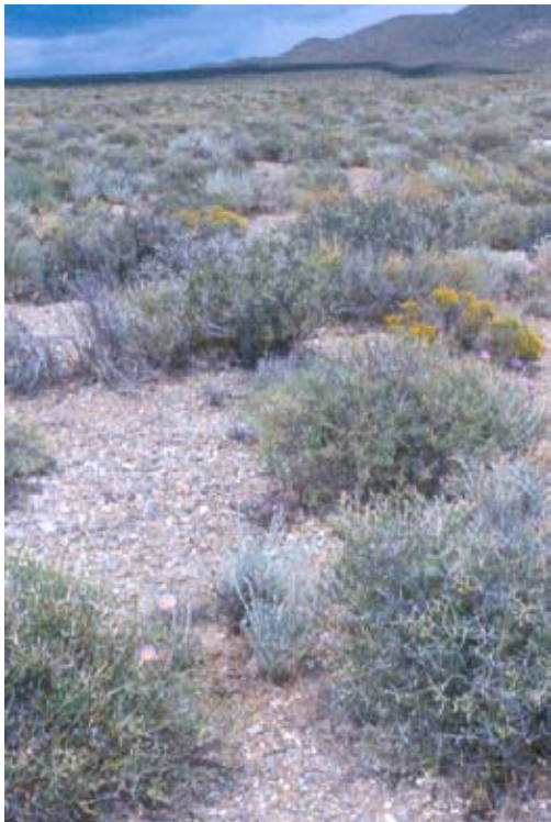
Figure A30. Menodora spinescens Dwarf-Shrubland Alliance, Last Chance Range