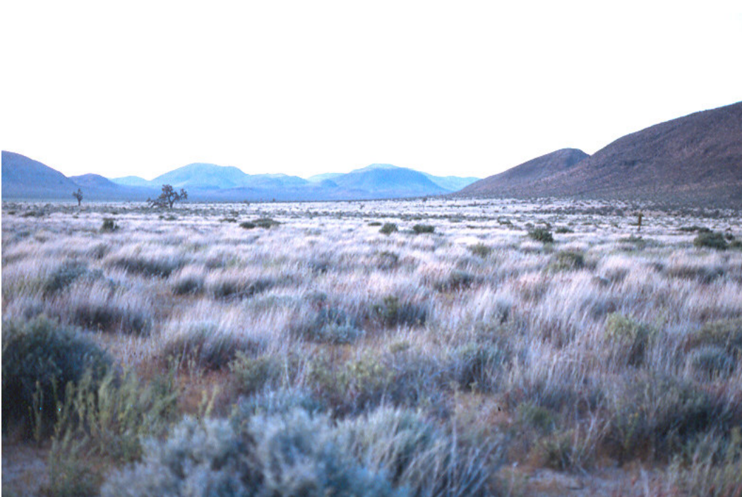
Figure A36. Pleuraphis rigida Herbaceous Alliance, East of Superior Lake