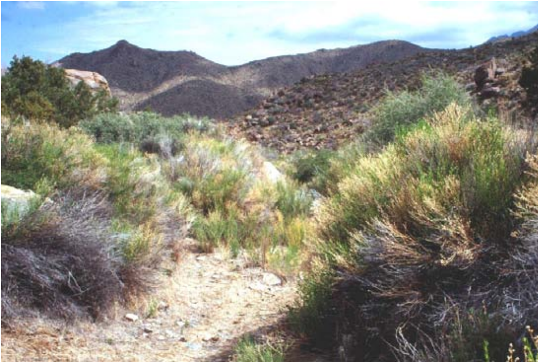
Figure A11. Baccharis sergiloides Intermittently Flooded Shrubland Alliance

Baccharis sergiloides is the sole or dominant shrub in canopy. Eriogonum fasciculatum , Gutierrezia microcephala , Lotus rigidus , Yucca schidigera , Ericameria linearifolia , Sphaeralcea ambigua , Acacia greggii , Opuntia acanthocarpa , Artemisia ludoviciana , Prunus fasciculata , or Rhus trilobata may be present. Emergent Populus fremontii and Salix species may be present. Shrubs < 5 m tall; canopy open to continuous. Understory is sparse to intermittent.