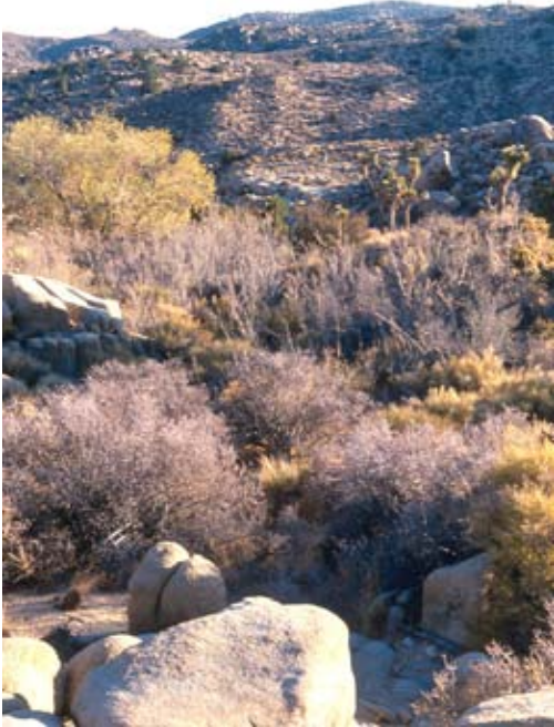
Figure A20. Forestiera pubescens Temporarily Flooded Shrubland Alliance, Willow Spring

Forestiera pubescens is the dominant or important shrub in the canopy. Salix exigua , Salix laevigata , Atriplex canescens , Vitis girdiana , Baccharis sergiloides , Baccharis emoryi , Phragmites australis , or Rhus trilobata may be present. Canopy intermittent to continuous. Shrubs < 5 m tall.