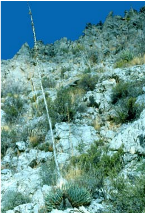
Figure A44. Purshia stansburiana Shrubland Alliance, Clark Range

Purshia stansburiana is the dominant or important shrub in the canopy. Agave utahensis , Artemisia nova , Ephedra viridis , Mortonia utahensis , Achnatherum speciosum , Prunus fasciculata , Thamnosma montana , Salvia mohavensis , Opuntia chlorotica or Yucca baccata may be present. Emergent Pinus monophylla and Juniperus osteosperma may be present. Shrubs < 5 m; cover open. Ground layer sparse.