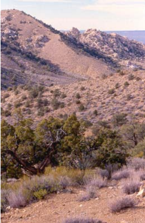
Figure A24. Juniperus osteosperma Wooded Shrubland Alliance

Juniperus osteosperma is the sole or dominant tree or large shrub occurring over a shorter-shrub canopy. Pinus monophylla may be present. Ambrosia dumosa , Artemisia tridentata , Atriplex confertifolia , Ericameria spp., Coleogyne ramosissima , Ephedra nevadensis , Ephedra viridis , Eriogonum fasciculatum , Grayia spinosa , Gutierrezia microcephala , Purshia tridentata , Salvia dorrii , or Yucca baccata may be present. Trees < 15 m tall; canopy intermittent or open. Shrubs < 2 m tall; continuous or intermittent. Ground layer sparse or grassy.