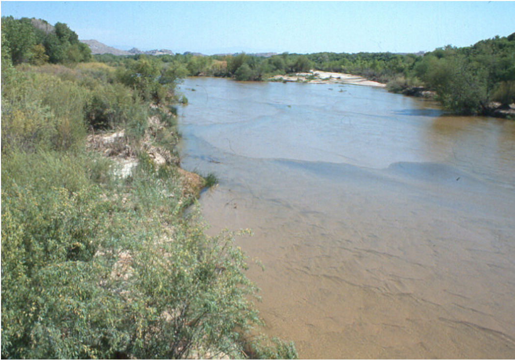
Figure A49. Salix (exigua) Temporarily Flooded Shrubland Alliance, Mojave River near Victorville

Salix exigua is sole or dominant shrub in the canopy. Populus fremontii , Baccharis salicifolia , Baccharis sergiloides , Baccharis emoryi , Alnus rhombifolia , Salix lasiolepis , Salix laevigata , Salix lucida , or Salix gooddingii may be present. Emergent trees may be present. Shrubs < 7 m tall; canopy continuous. Ground layer is variable.