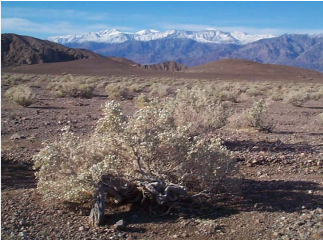
Figure A7. Atriplex hymenelytra Shrubland Alliance, Death Valley

Atriplex hymenelytra is the sole or conspicuous shrub in canopy. Encelia farinosa , Ambrosia dumosa , Atriplex confertifolia , Suaeda moquinii , Larrea tridentata , Tidestromia oblongifolia , Dalea mollossima , or Peucephyllum schottii may be present. Shrubs < 1 m tall; canopy open. Ground layer sparse; annuals seasonally present.