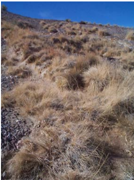
Figure A51. Sporobolus airoides Intermittently Flooded Herbaceous Alliance, Travertine Springs