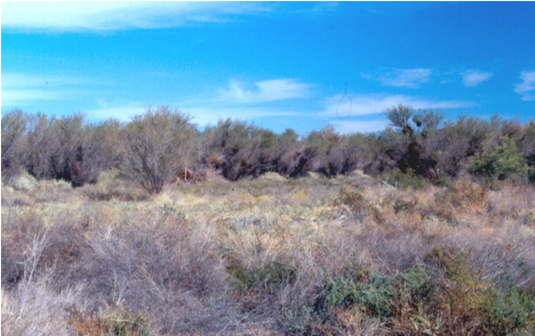
Figure A41. Prosopis pubescens Shrubland Alliance, Shoshone

Prosopis pubescens is the dominant or important large shrub in canopy. Prosopis glandulosa , Baccharis salicifolia , B. emoryi , Isocoma acradenia , Salix exigua , Populus fremontii , Suaeda moquinii , Atriplex canescens , Atriplex polycarpa , or Sporobolus airoides may be present. Large shrubs or small trees < 8 m tall; canopy open to intermittent. Ground layer open to intermittent; may be grassy.