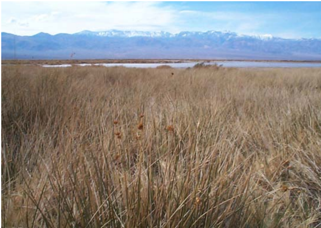
Figure A23. Juncus cooperi Seasonally Flooded Herbaceous Alliance, Death Valley

Juncus cooperi is the sole dominant or important species in this herbaceous alliance. Atriplex spp., Juncus mexicanus , Distichlis spicata , Schoenoplectus americanus , Phragmites australis , Anemopsis californica , Iva acerosa , or Heliotropium curassavicum may be present. Grasses and herbs < 1 m tall. Canopy intermittent to continuous.