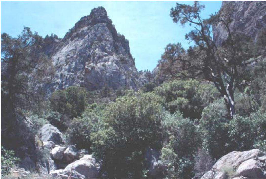
Figure A47. Quercus chrysolepis Forest Alliance

Quercus chrysolepis is the sole, dominant, or important tree with Arbutus menziesii , Lithocarpus densiflorus , Pinus lambertiana , or Quercus garryana in the tree canopy. Abies concolor , Acer macrophyllum , Calocedrus decurrens , Pinus coulteri , Pinus monophylla , Pinus ponderosa , Pseudotsuga menziesii , Pseudotsuga macrocarpa , Quercus kelloggii , and/or Umbellularia californica may be present. Trees < 30 m tall; canopy continuous, may be one- or two-tiered. Shrubs are infrequent. Ground layer is sparse or absent.