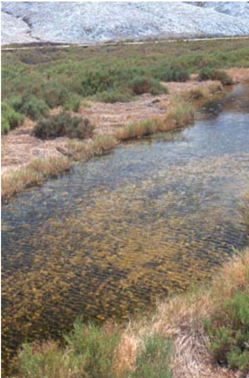
Figure A4. Allenrolfea occidentalis Shrubland Alliance, Salt Creek

Allenrolfea occidentalis is the sole or dominant shrub in canopy. Suaeda moquinii , Sarcobatus vermiculatus , Atriplex canescens , Distichlis spicata , Sporobolus airoides , Frankenia salina or Kochia californica may be present. Shrubs < 2 m tall; canopy continuous to open. Ground layer variable.