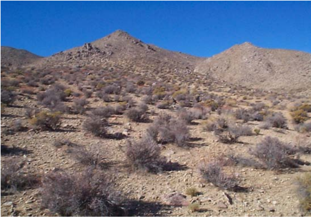
Figure A13. Coleogyne ramosissima Shrubland Alliance, Homewood Canyon

Coleogyne ramosissima is the sole or dominant shrub in canopy. Artemisia spinescens , Atriplex confertifolia , Eriogonum fasciculatum , Ephedra nevadensis , Grayia spinosa , Krascheninnikovia lanata , Menodora spinescens , Salazaria mexicana , or Thamnosma montana may be present. Emergent trees such as Juniperus californica , Juniperus osteosperma , Pinus monophylla , Yucca schidigera , or Yucca brevifolia may be present. Shrubs < 1 m tall; canopy intermittent to continuous. Ground layer sparse.