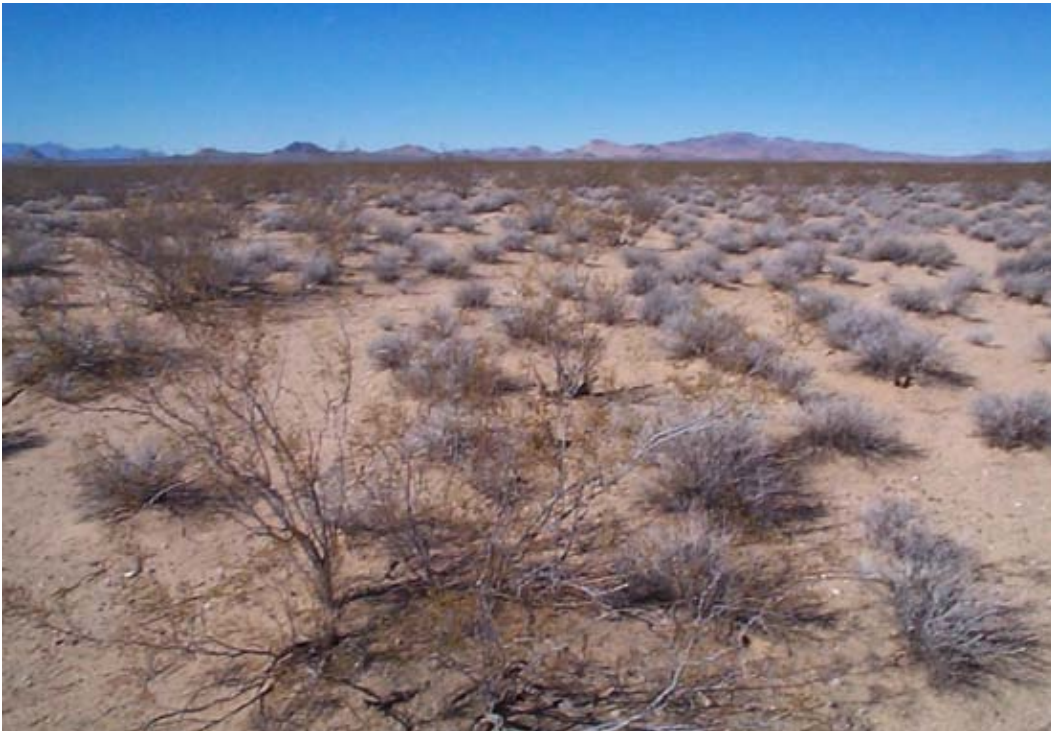
Figure A26. Larrea tridentata - Ambrosia dumosa Shrubland Alliance, Lanfair Valley

Larrea tridentata and Ambrosia dumosa are the important or conspicuous shrubs in the canopy. Other species that can be present are Achnatherum speciosum , Amphipappus fremontii , Atriplex confertifolia , Atriplex hymenelytra , Atriplex polycarpa , Bebbia