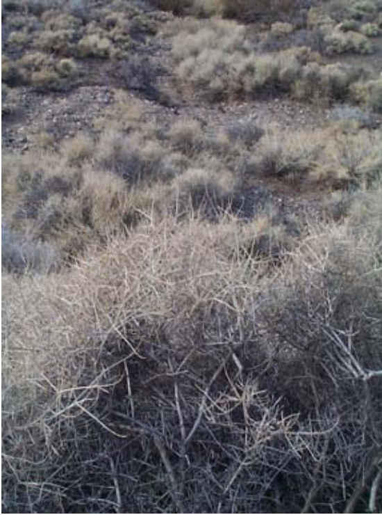
Figure A48. Salazaria mexicana Shrubland Alliance, Panamint Mountains

Salazaria mexicana is the sole or dominant shrub in canopy. Achnatherum speciosum , Atriplex confertifolia , Ephedra nevadensis , Eriogonum fasciculatum , Grayia spinosa , Hymenoclea salsola , Krascheninnikovia lanata , Larrea tridentata , Lycium andersonii , Mirabilis bigelovii , Salvia dorrii , Thamnosma montana or Viguiera reticulata may be present. Emergent Acacia greggii and Yucca brevifolia may be present. Shrubs < 3 m tall; canopy continuous, intermittent, or open. Ground layer sparse.