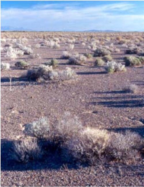
Figure A10. Atriplex confertifolia Shrubland Alliance, Amargosa Desert

Atriplex confertifolia is the sole or dominant shrub in canopy. Ambrosia dumosa , Artemisia spinescens , Atriplex polycarpa , Atriplex spinescens , Chrysothamnus viscidiflorus , Encelia actonii , Coleogyne ramosissima , Ephedra nevadensis , Eriogonum heermannii , Grayia spinosa , Gutierrezia microcephala , Krascheninnikovia lanata , Larrea tridentata , Lycium andersonii , Sarcobatus vermiculatus , or Tetradymia axillaris may be present. Shrubs < 1 m tall; canopy continuous, intermittent, or open. Emergent taller shrubs may be present. Ground layer sparse.