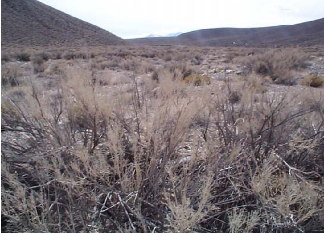
Figure A19. Ericameria paniculata Intermittently Flooded Shrubland Alliance; Emigrant Canyon, Panmint Mountains

Ericameria paniculata is the sole or dominant shrub in canopy. Ambrosia eriocentra , Brickellia incana , Encelia farinosa , Encelia virginensis , Ephedra nevadensis , Ephedra californica , Eriogonum fasciculatum , Hymenoclea salsola , Salvia dorrii or Stephanomeria pauciflora may be present. Emergent Acacia greggii and Chilopsis linearis may be present. Trees < 5 m tall; scattered cover. Shrubs < 3 m tall; intermittent or open cover. Ground layer sparse. Annual herbs or grasses seasonally present.