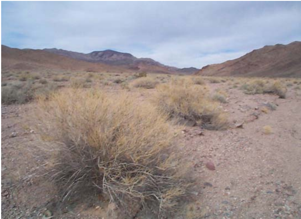
Figure A22. Hymenoclea salsola Shrubland Alliance, Jubilee Pass, Death Valley