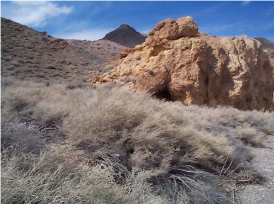
Figure A8. Atriplex polycarpa Shrubland Alliance, Emigrant Canyon

Atriplex polycarpa is the sole or dominant shrub in canopy. Ambrosia dumosa , Atriplex canescens , Bromus madritensis , Chamaesyce polycarpa , Distichlis spicata , Hymenoclea salsola , Isocoma acradenia , Larrea tridentata or Schismus barbatus may be present. Emergent Prosopis glandulosa may be present. Shrubs < 3 m tall; canopy continuous to open. Ground layer variable, including native annuals.