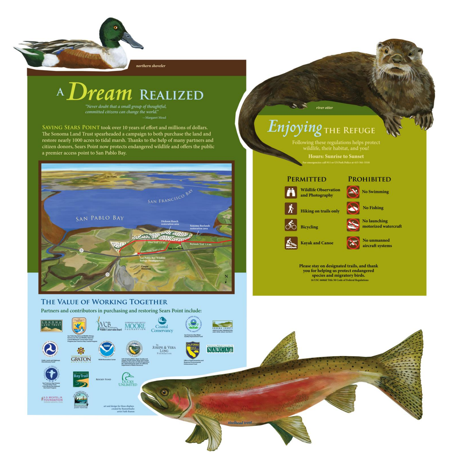
Figure 2: Sign located at entry kiosk acknowledging all sources of funding, including NFWF.