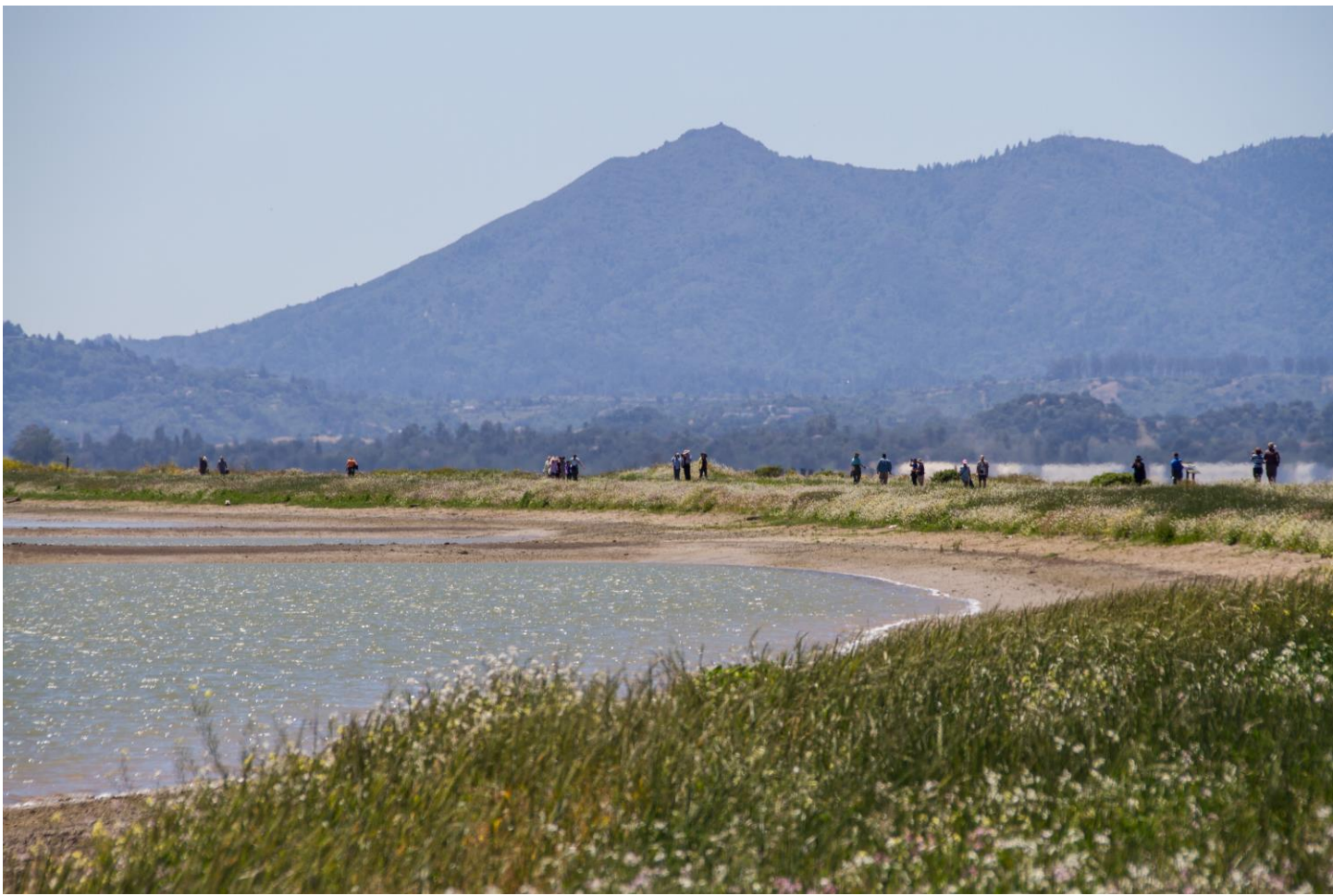
Photograph 3: Trail with restored wetland in foreground and Mt. Tamalpias in background