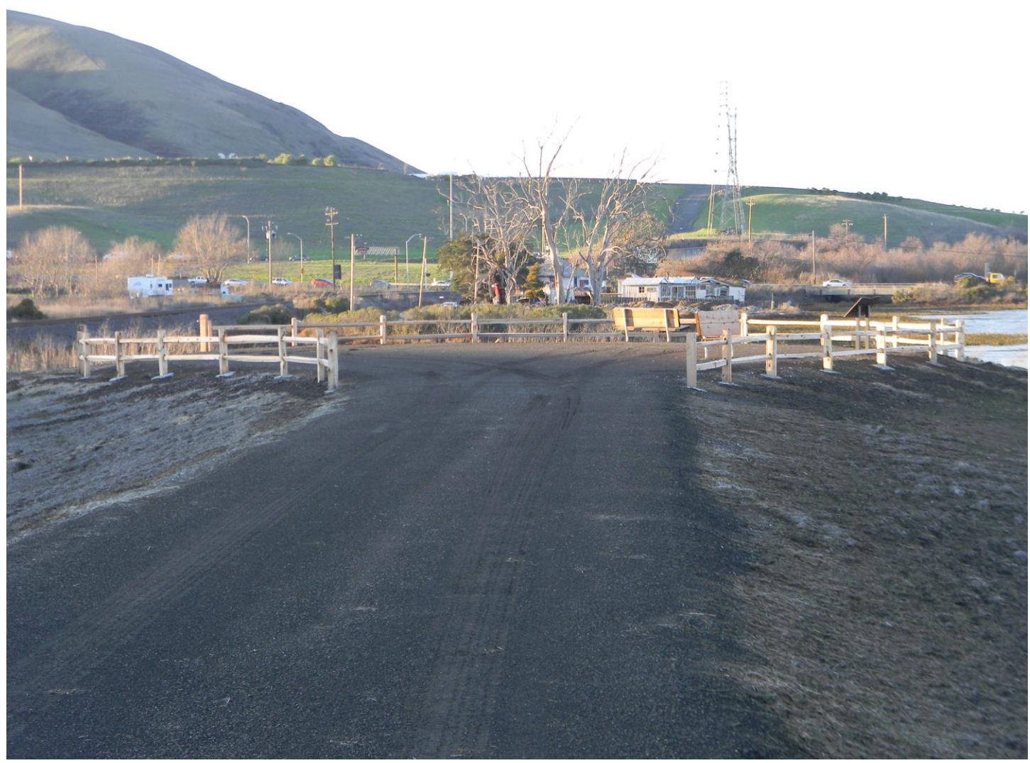
Photograph 4: End of new trail