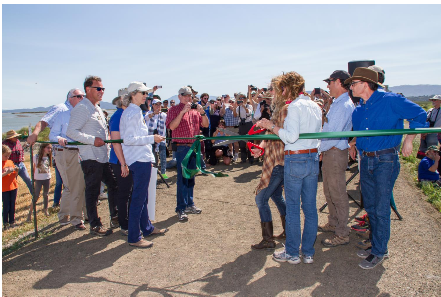
Photograph 1: Ribbon cutting for opening of new segment of the Bay Trail