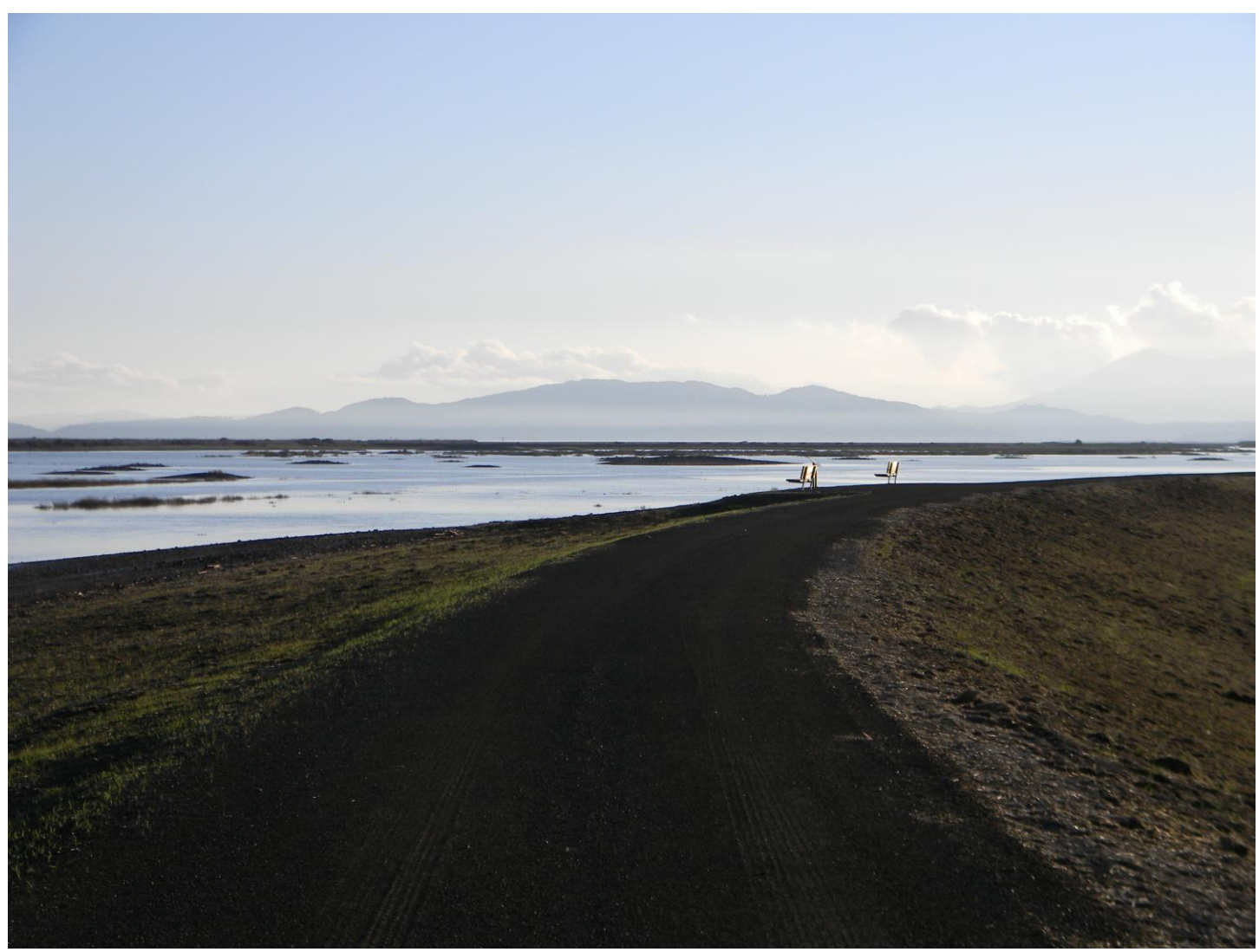
Photograph 5: Evening on the new Bay Trail