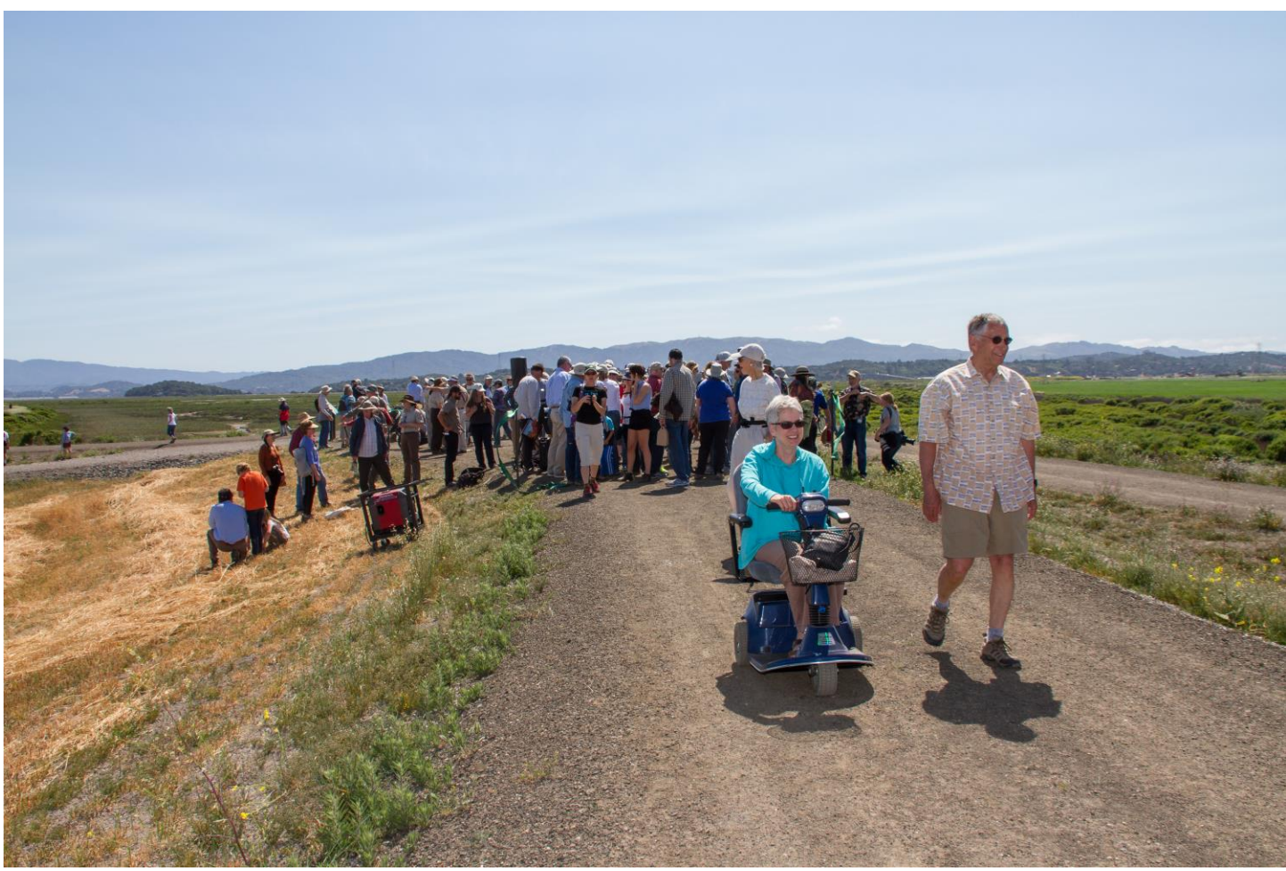
Photograph 2: ADA compliant Bay Trail