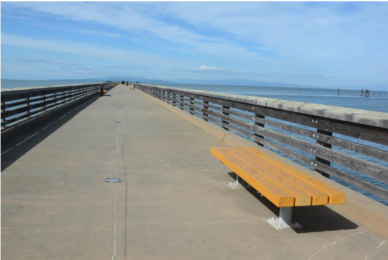
Photographs 8 and 9: Front view (Photo 8, top) and side view (Photo 9, bottom) of new Alaskan Yellow Cedar wood replacement benches after the project.