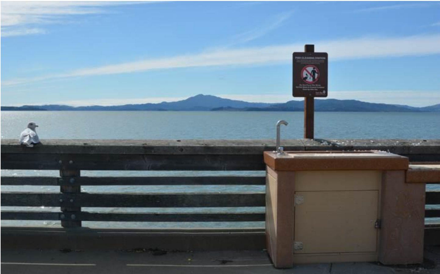
Photograph 2: Fish Cleaning Station with Pelican Sign