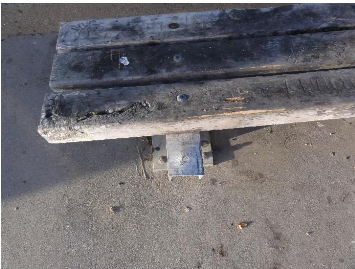
Photographs 5 to 7: Wood benches before the project, showing non-conforming steel supports (Photo 5, top), wood deterioration (Photo 6, middle), and damage from vandalism (Photo 7, bottom)