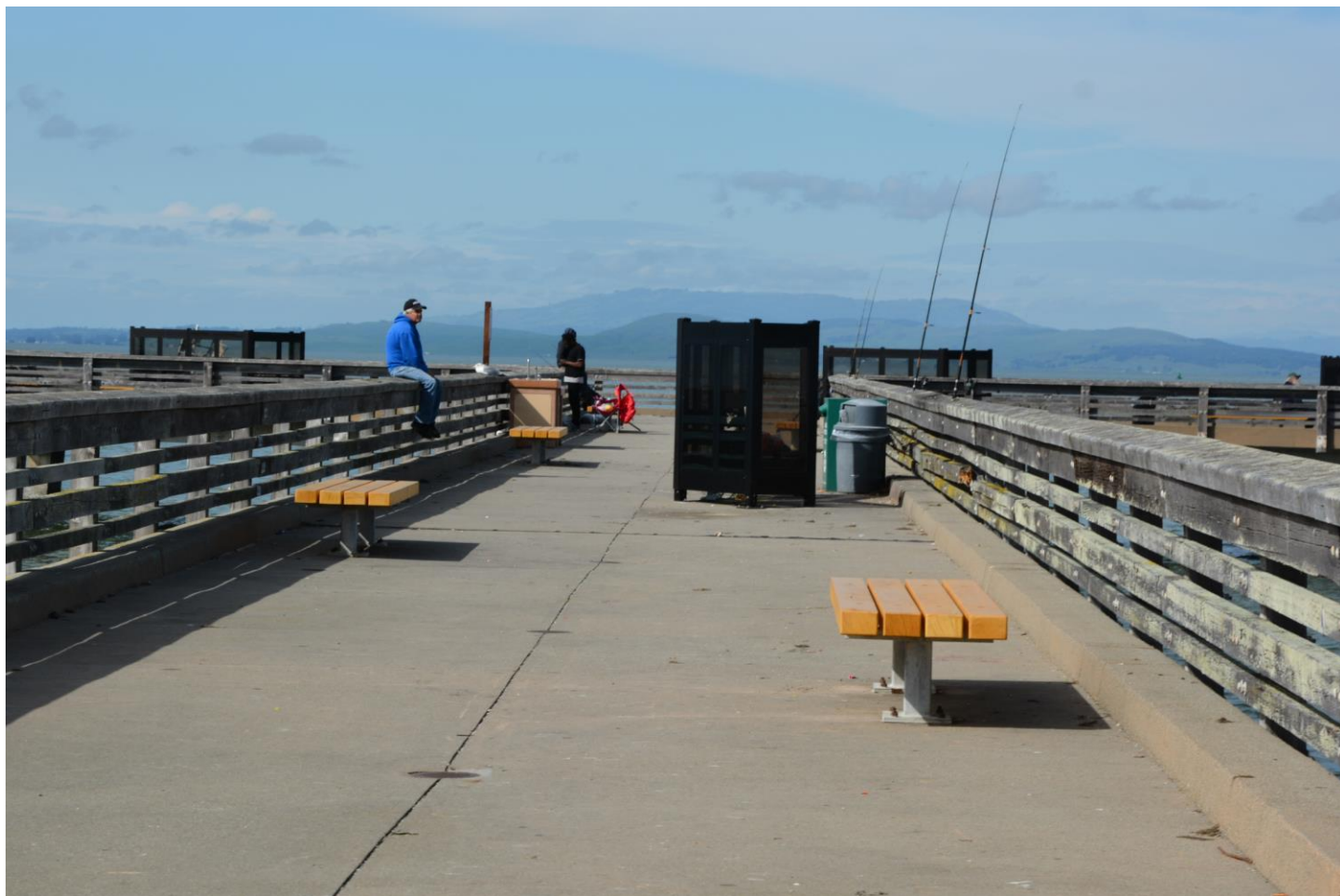
Photograph 1: New windcreens, benches and beautiful views