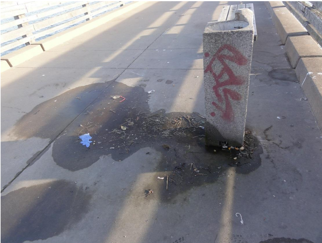
Photographs 18 and 19: Front view (Photo 18, top) and side view (photo 19, bottom) of drinking fountain before the project