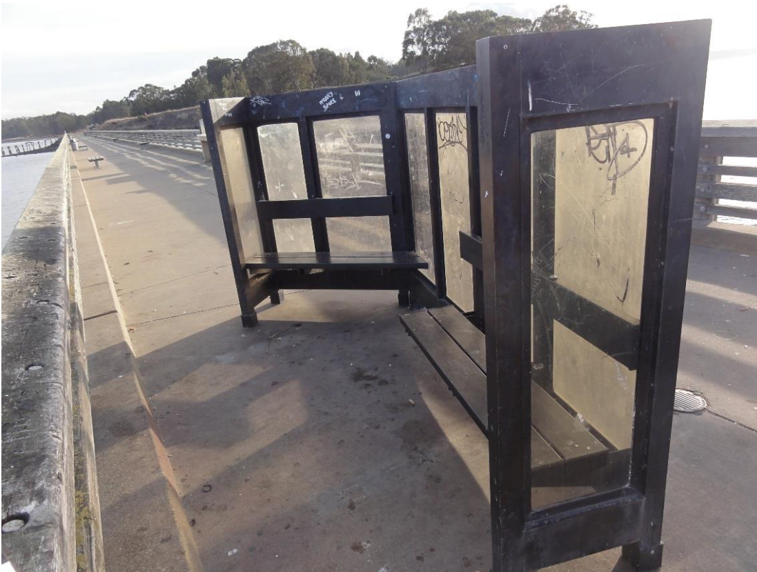
Photographs 10 and 11: Windscreens before the project had been vandalized and were not ADA compliant. Views of windscreens from behind (Photo 10, top) and the front (Photo 11, bottom).