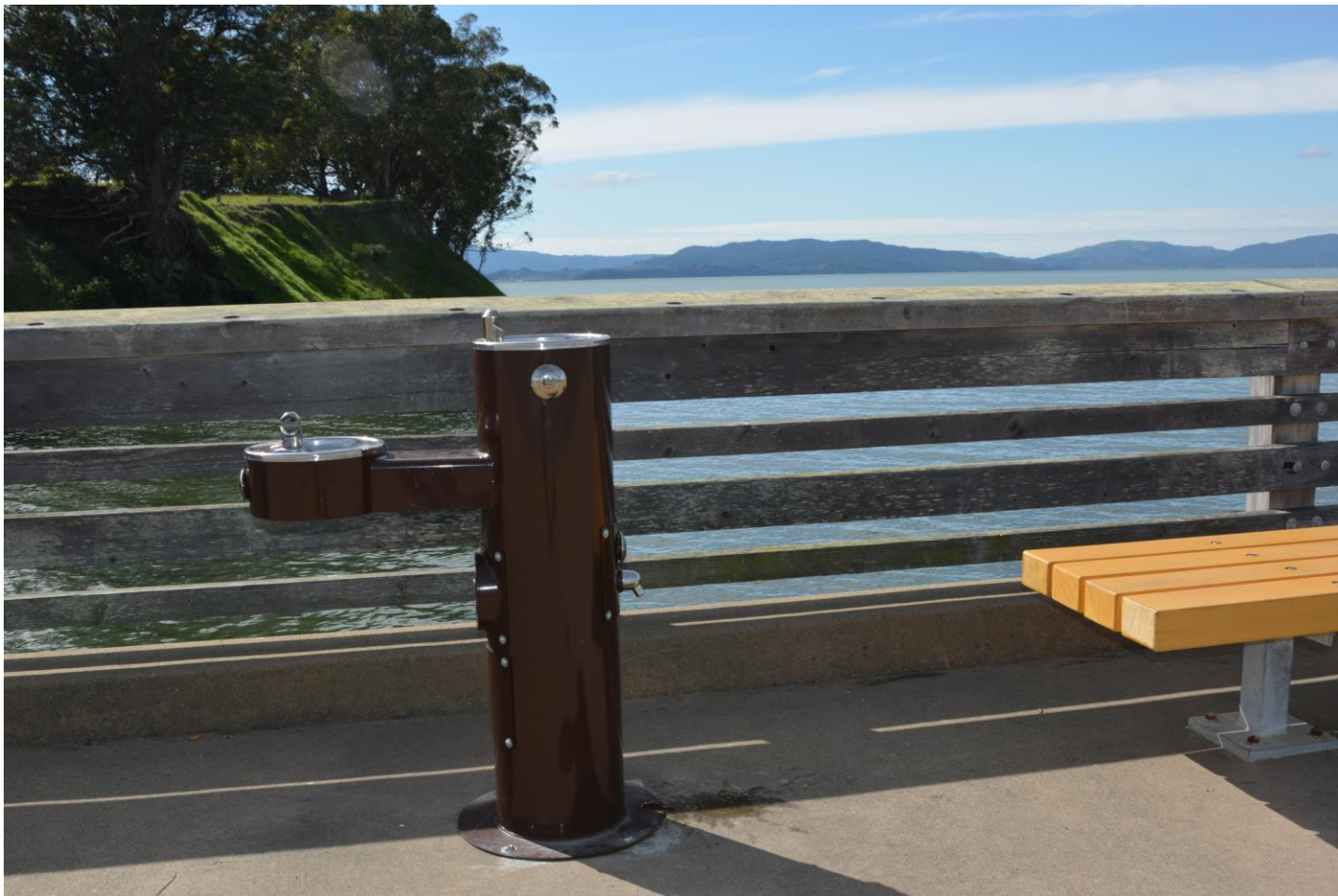
Photograph 3: New ADA drinking fountain and bench with weather resistant wood.