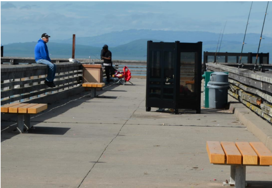
Photographs 12 and 13: New windscreens after the project with improved accessibility.