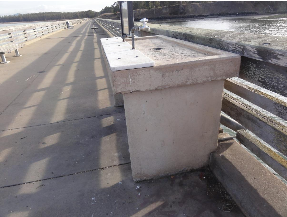
Photographs 14 and 15: Front view (Photo 14, top) and side view (Photo 15, bottom) of fish cleaning table before the project.