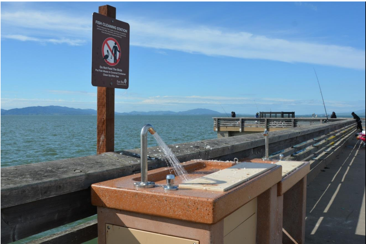
Photographs 16 and 17: Front view (Photo 16, top) and side view (photo 17, bottom) of fish cleaning table after the project, showing improvements in accessibility.