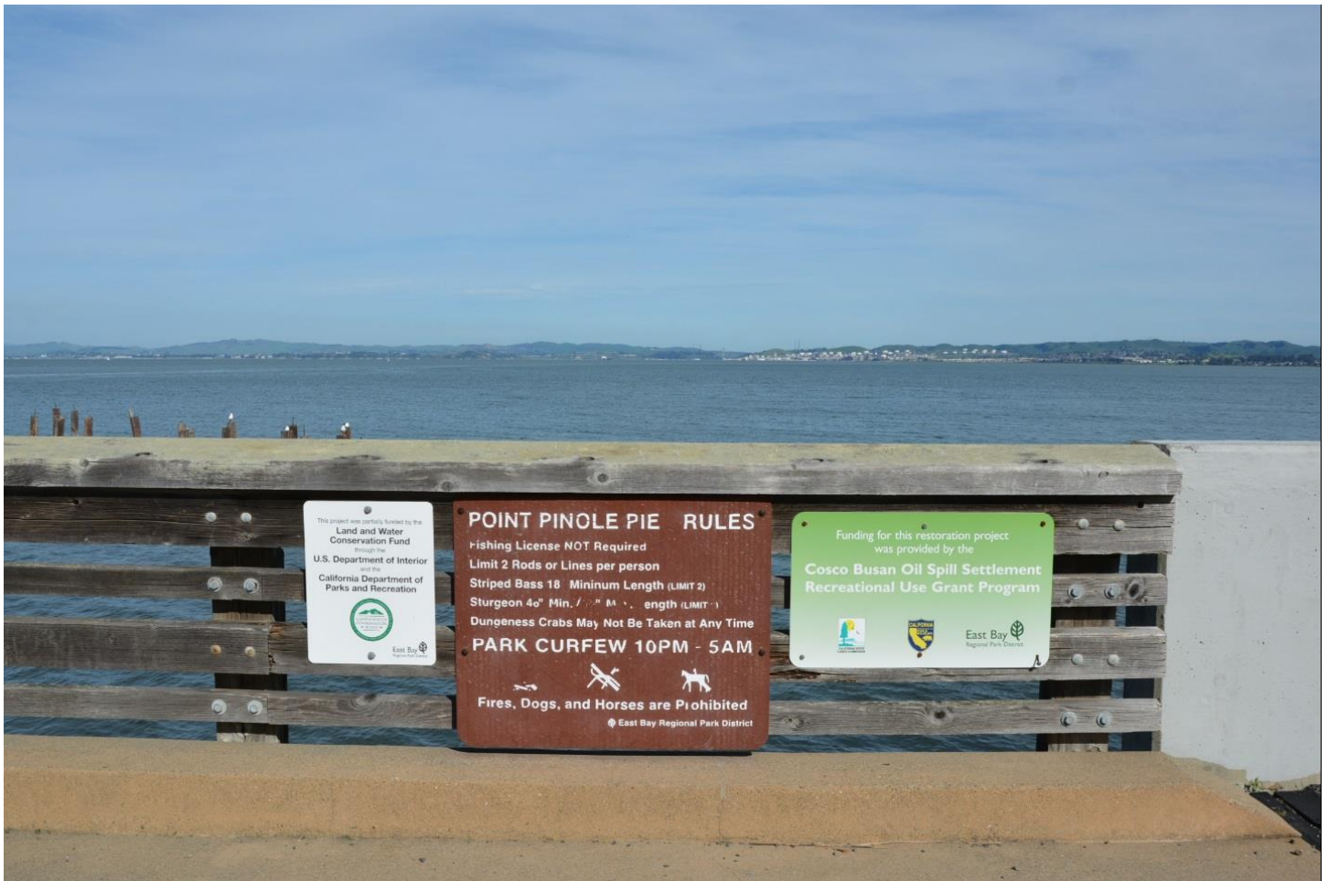
Photograph 22: Group of signs that list pier rules and acknowledge sources of funding of pier improvements.