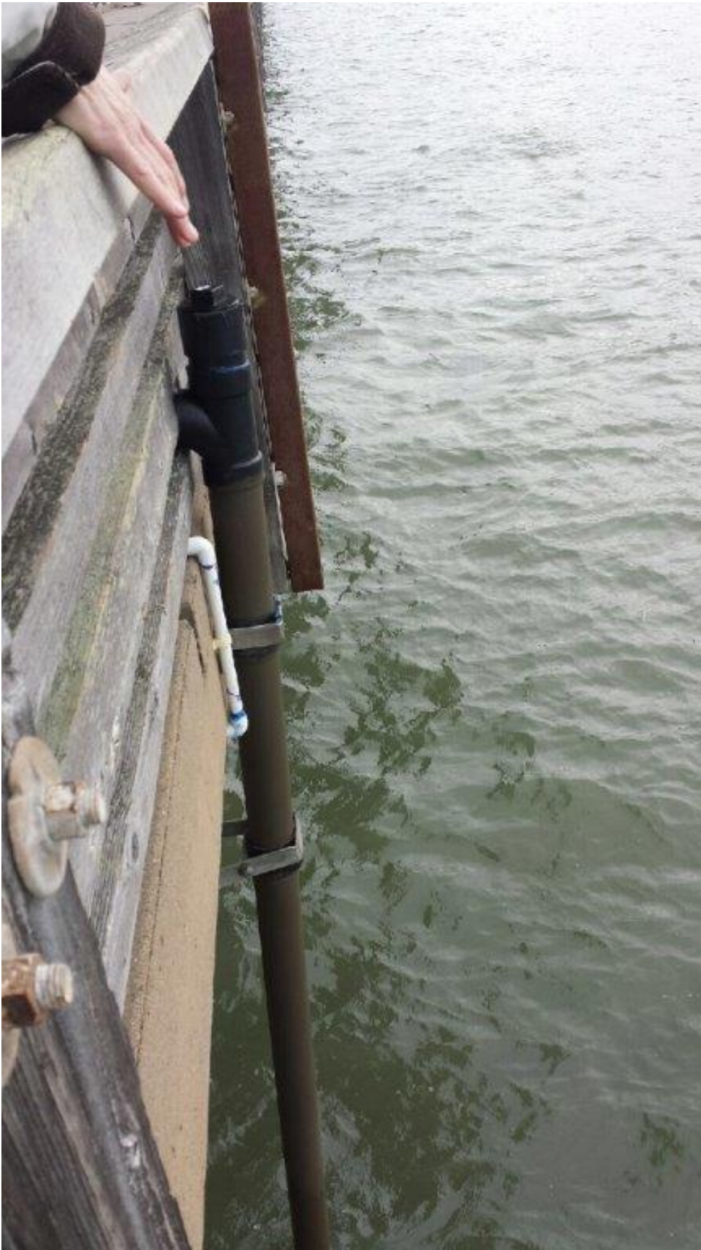
Photograph 4: Plumbing to fish cleaning station underneath pier.