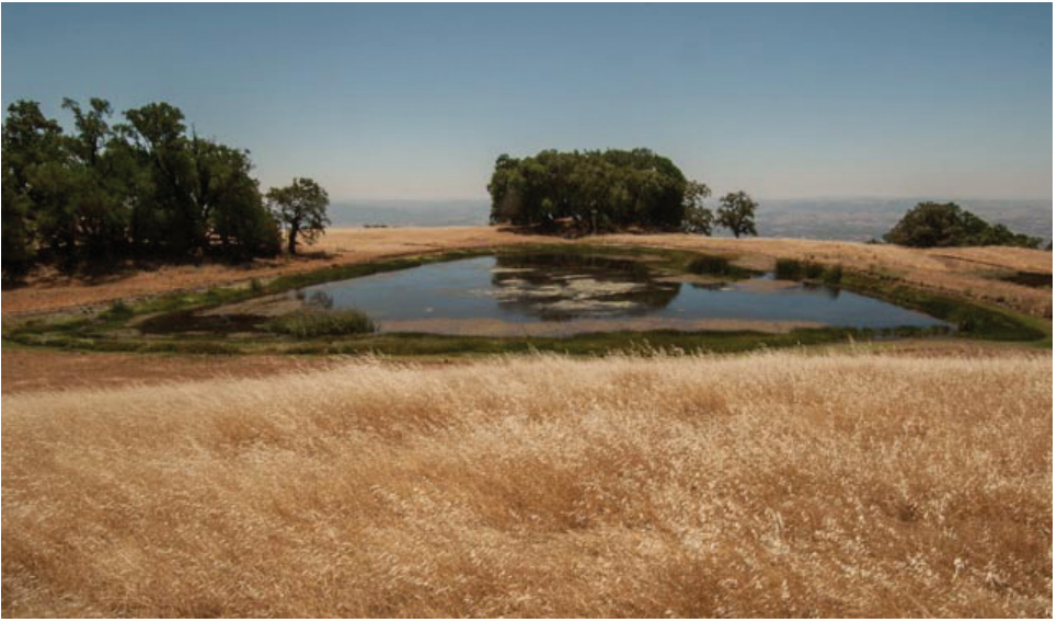
FIGURE 2. —Leaky Lake in July, showing common spikerush ringing the littoral zone with a few dense stands of tule in the deeper portion.