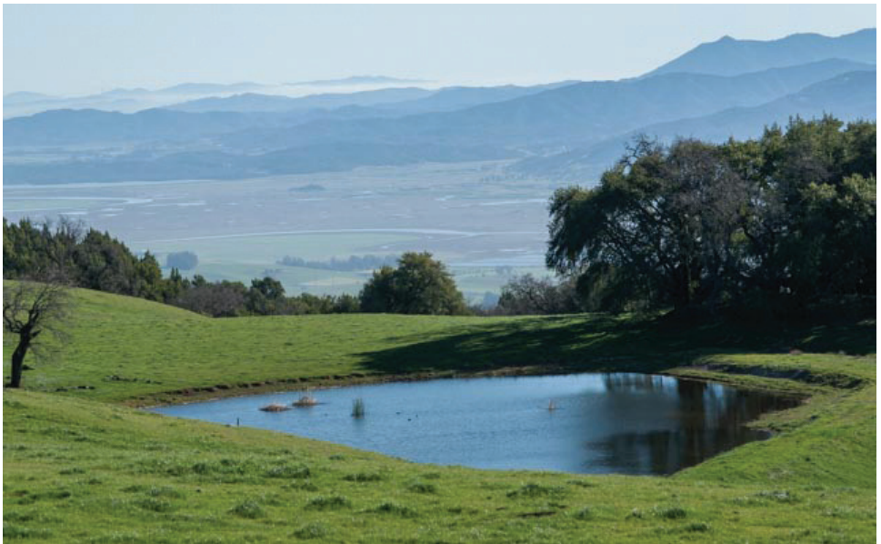
FIGURE 3. —Leaky Lake in early spring, when most littoral vegetation is inundated by rising water and cattle have cropped much of the tule growing close to shore when water levels were lower in late summer.