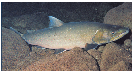
Bull trout ( Salvelinus confluentus ) are a cold-water salmonid native to the Pacific Northwest. This species is in decline in much of its range and is often found in high elevation areas where instream habitat is still intact.

Roger Tabor, U.S. Fish and Wildlife Service