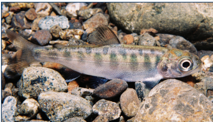
Chinook salmon ( Oncorhynchus tshawytscha ) are an anadromous salmon iconic of the Pacific Northwest. Juvenile chinook (above) spend up to a year in freshwater before migrating to the ocean to grow to maturity.

Flitcroft explains that wildfire has a way of shaking up an ecosystem in a way that adds complexity—something that helps with the survival not only of salmon, but other creatures as well. Given the opportunity, salmonids and other species that are adapted to disturbance will gravitate toward a more complex environment rather than a simpler one.