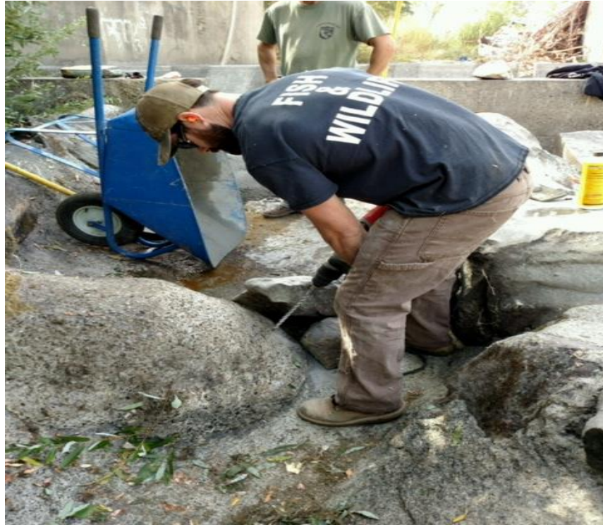
Figure 5. California Fish and Wildlife staff building up a wall on the Kelsey Creek Detention Structure East Fish Ladder in order to form a resting pool for hitch (September 20 and 21, 2017).