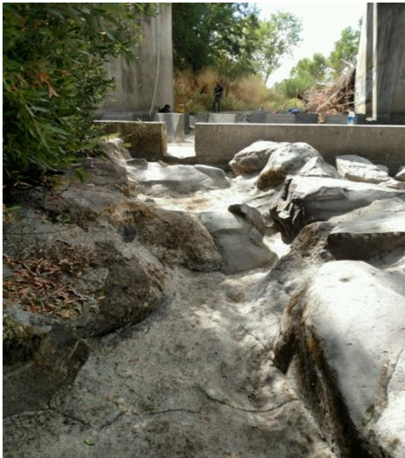
Figure 3. Kelsey Creek Detention Structure East Fish Ladder looking upstream towards detention structure (September 20 and 21, 2017).