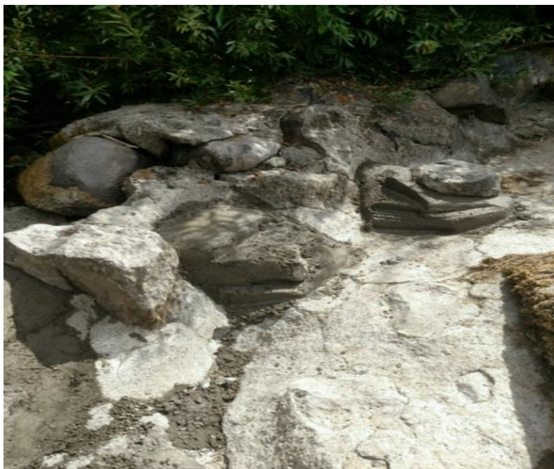
Figure 4. Kelsey Creek Detention Structure East Fish Ladder after concrete was added in order to slow down flows exiting detention structure (September 20 and 21, 2017).