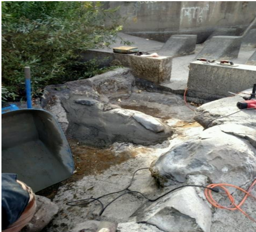
Figure 6. Finished wall, forming a resting pool for hitch on Kelsey Creek Detention Structure East Fish Ladder looking upstream (September 20 and 21, 2017).